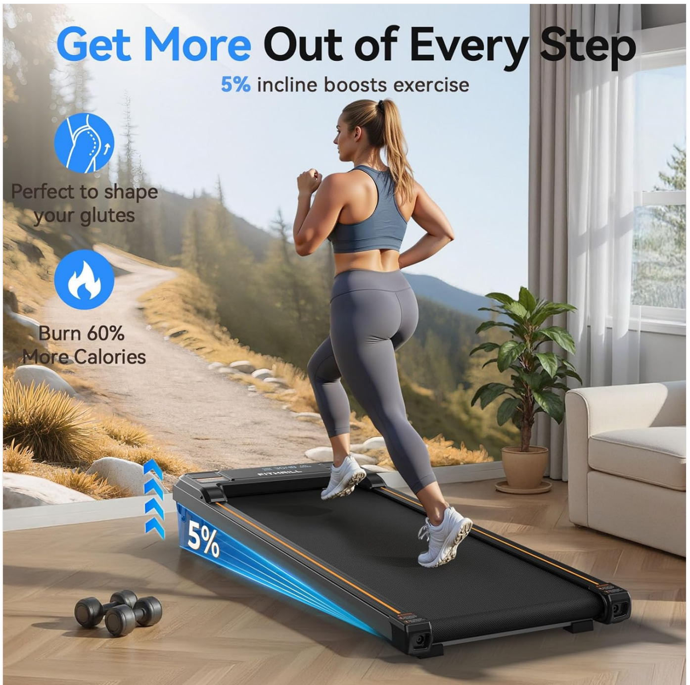
Image: A woman exercising on the Fithrill Walking Pad, highlighting the 5% incline feature designed to boost exercise intensity and calorie burn.