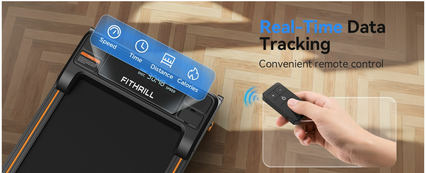
Image: Close-up of the Fithrill Walking Pad's LED display showing real-time data and the remote control used for operation.

The treadmill is operated via a remote control. Remove the protective plastic tab from the remote control's battery compartment to activate it. The remote is pre-installed with a battery.