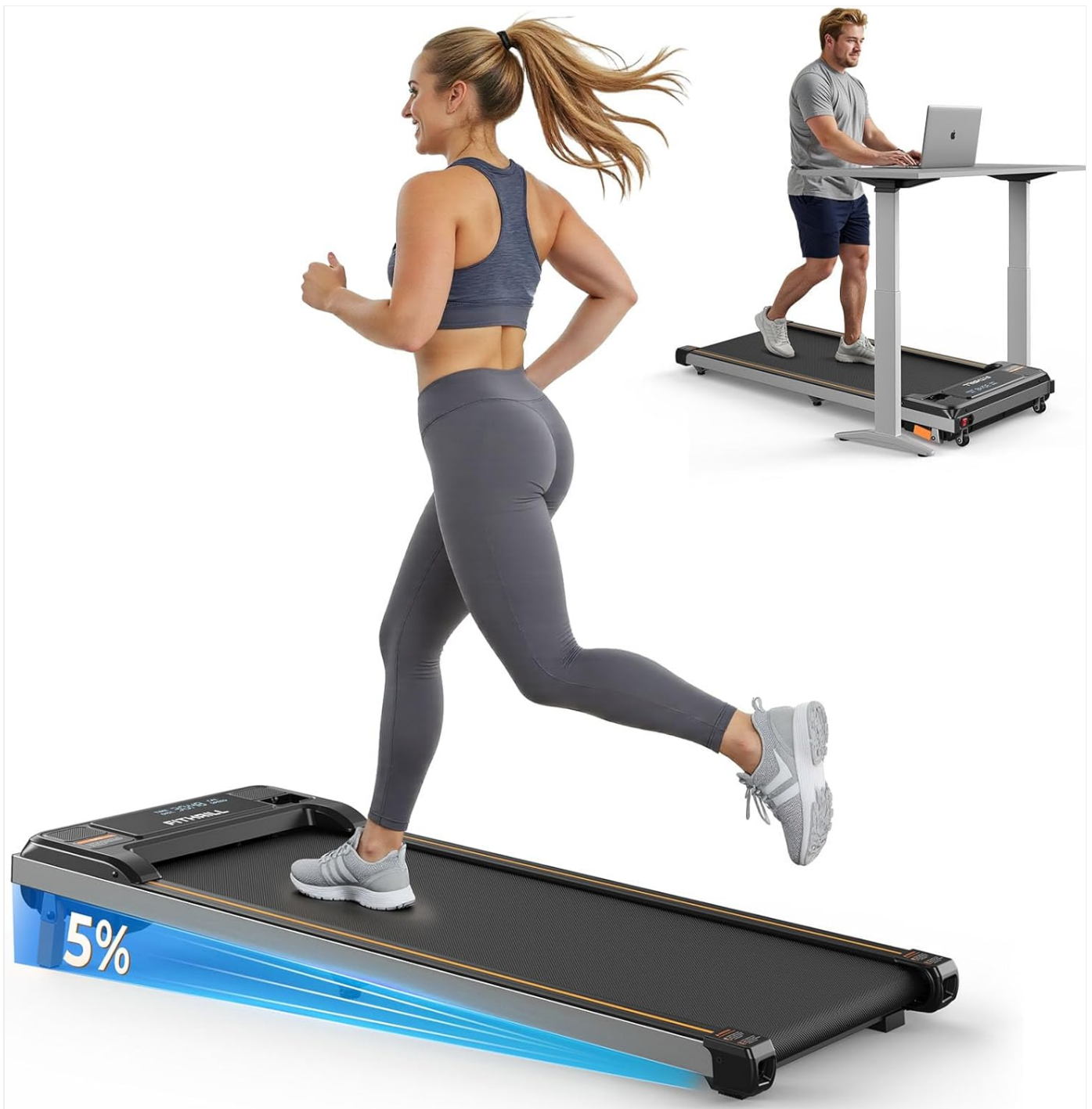
Image: The Fithrill Under Desk Walking Pad Treadmill in a home office setting, demonstrating its compact design and suitability for both walking and jogging.