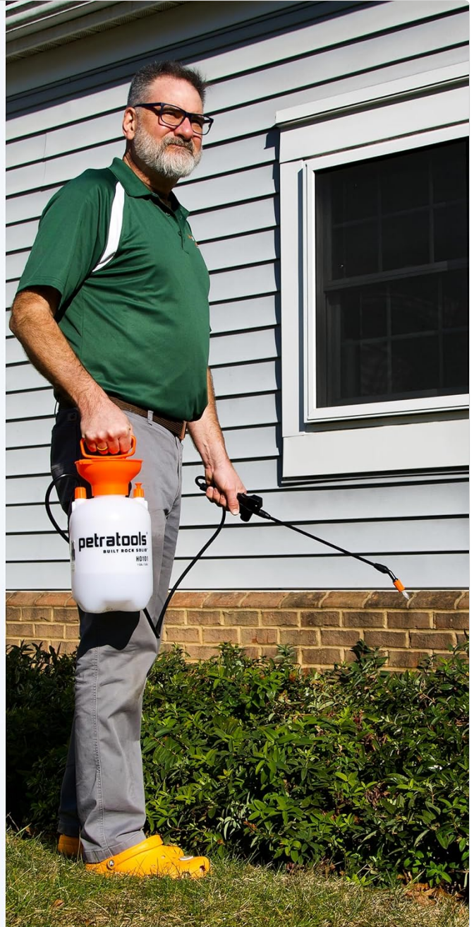
Image: The wide mouth lid and easy carry handle facilitate filling and transport.

EASY CARRY HANDLE Spray convenience in a grasp