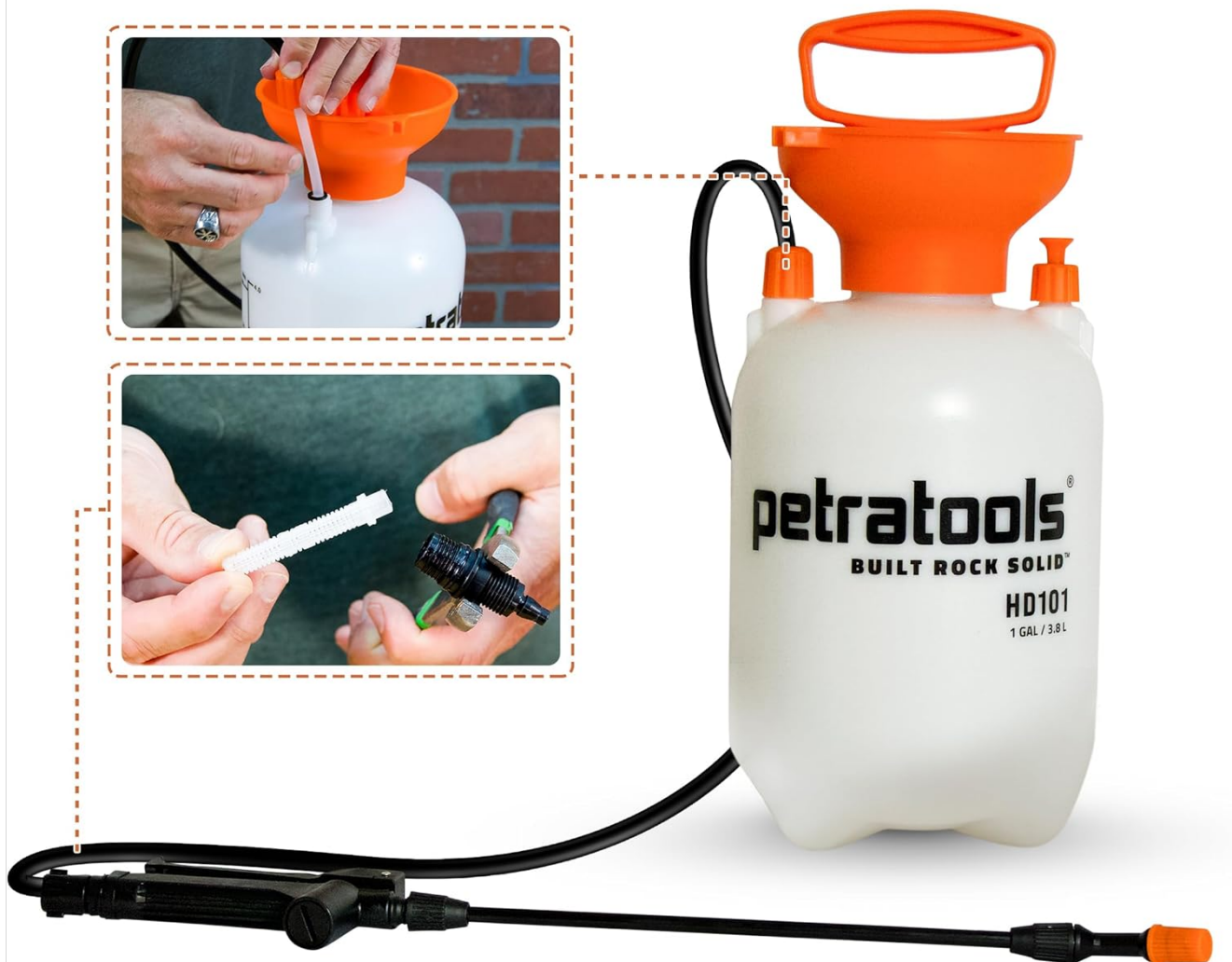
Image: Instructions for accessing and cleaning the built-in filters to maintain clog-free operation.