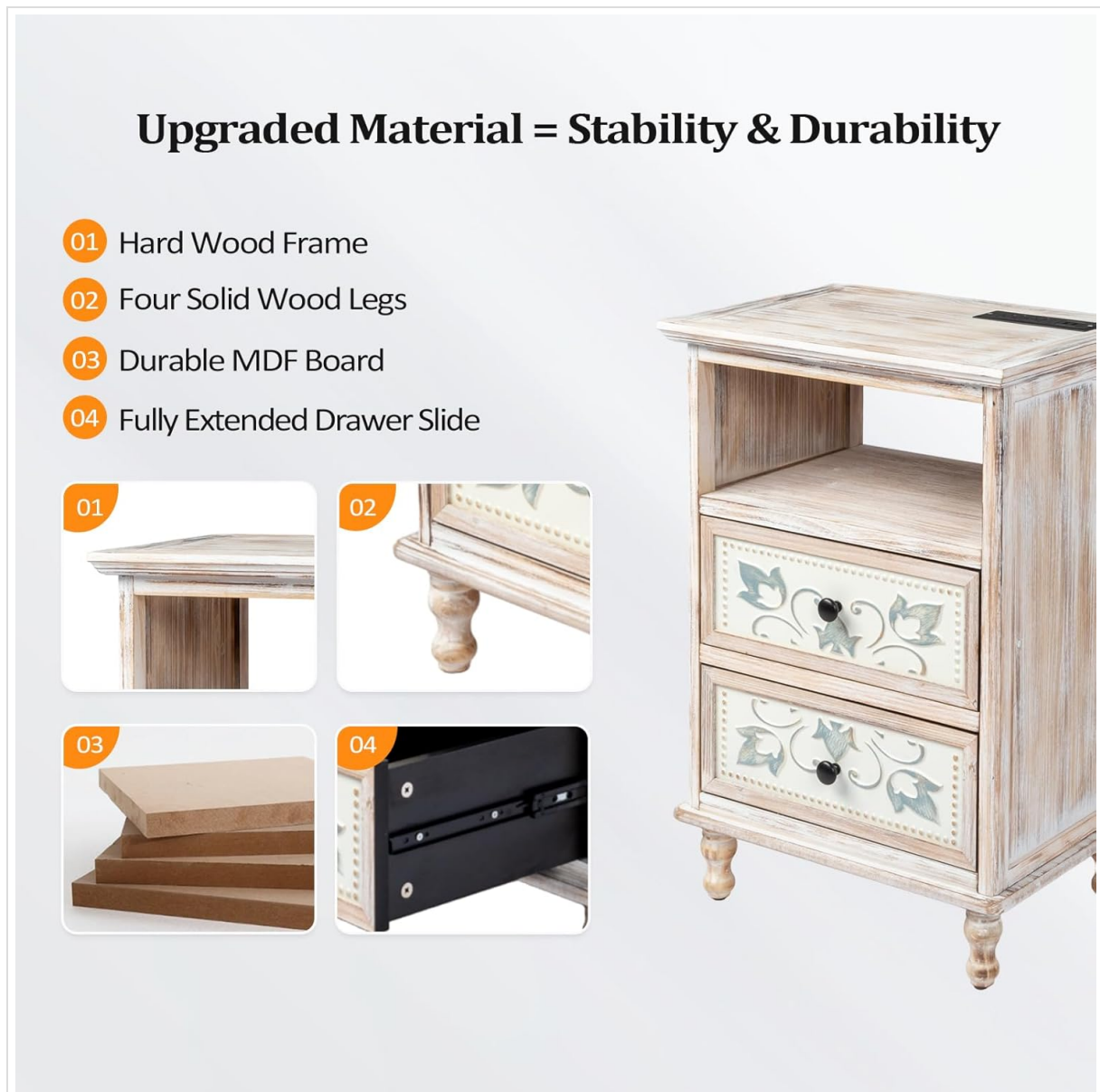
Figure 1: Key components and materials for assembly, highlighting the hard wood frame, solid wood legs, MDF board, and fully extended drawer slides for stability and durability.

Assembly of this nightstand typically requires two people and a screwdriver. Please refer to the included Assembly Guide for step-by-step instructions and diagrams. Ensure you have adequate space and all components before starting.