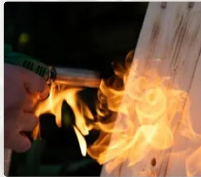
Burn the Wood