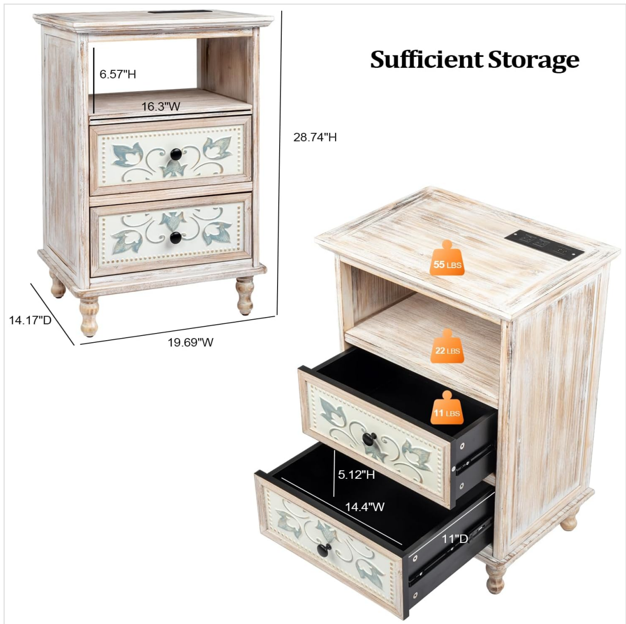
Figure 5: Product dimensions and internal storage measurements.