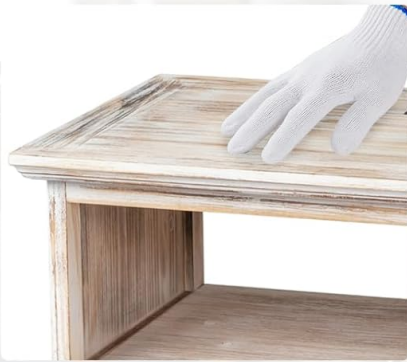
Apply Fir Wood Veneer