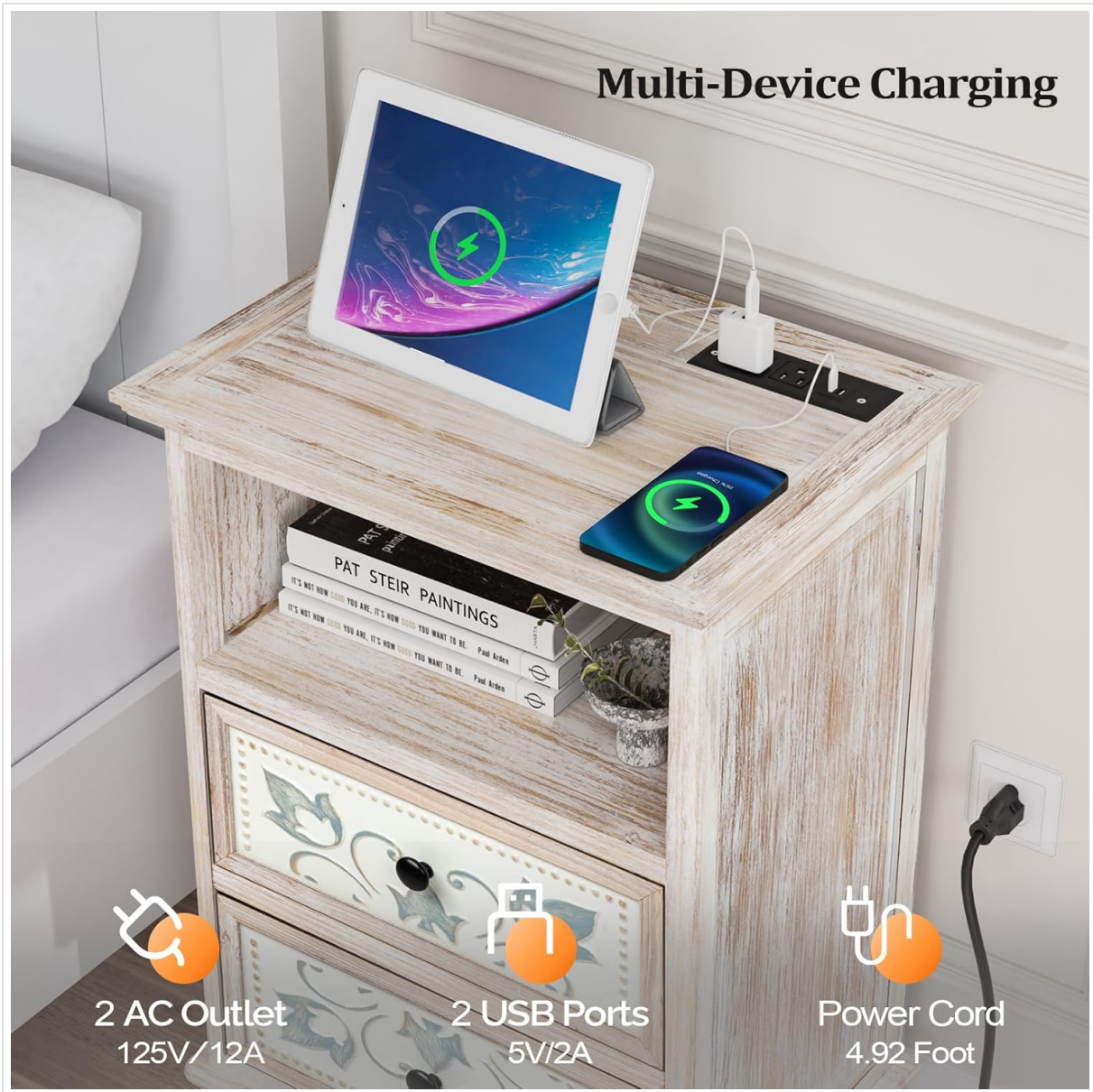
Figure 3: Example of multiple devices charging simultaneously.