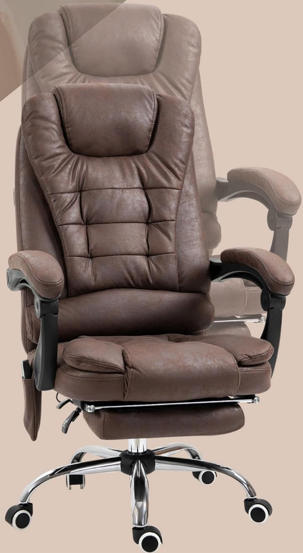
Figure 6: Visual representation of the massage points and the wired remote control for functions.

Sollevare e abbassare per regolare l'altezza