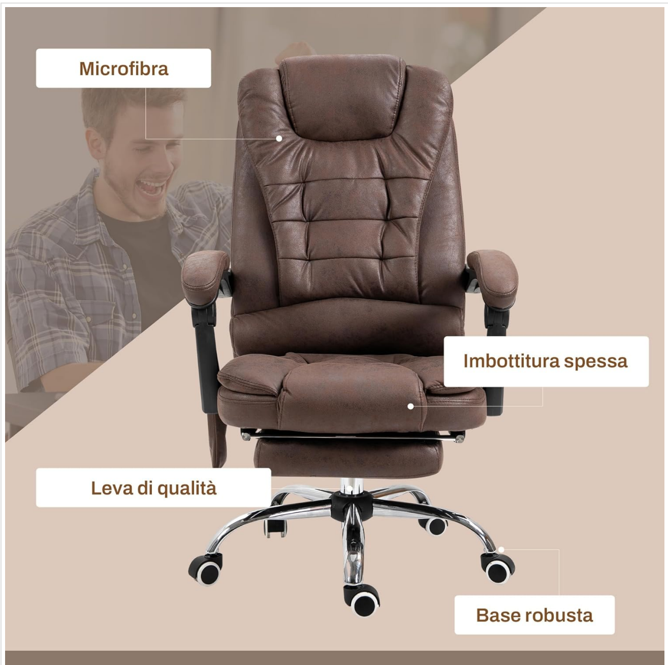
Figure 7: Close-up of the chair's 360-degree swivel base and durable wheels.