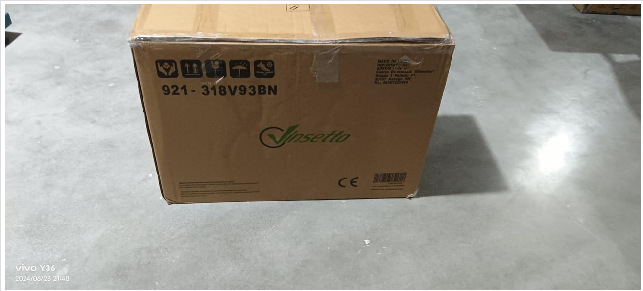
Figure 2: Product packaging showing model number 921-318V93BN.