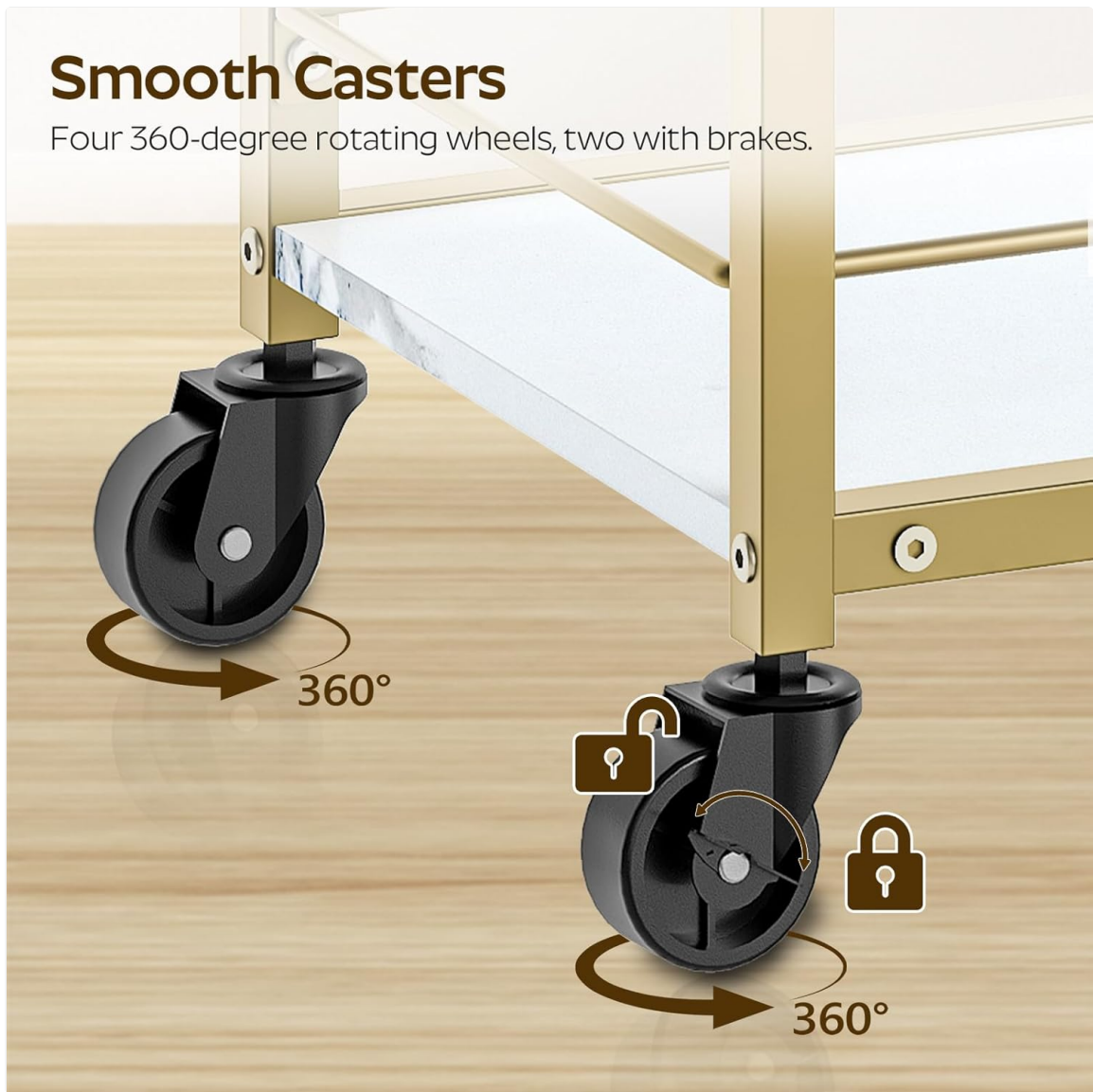
Image: View of the smooth-rolling casters, highlighting the locking feature on two wheels for stability.

Four 360-degree rotating wheels, two with brakes.