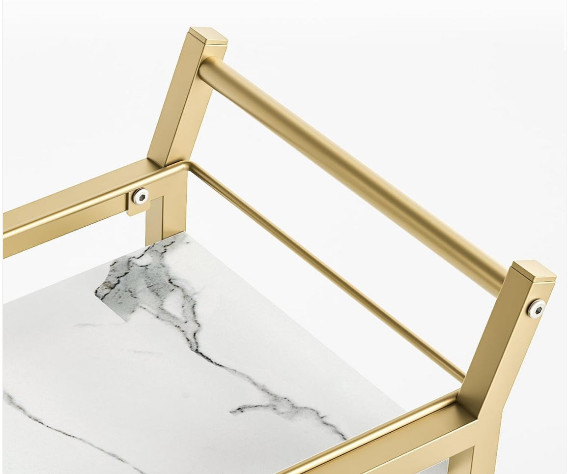
Image: Detail of the practical handle at the top of the bar cart, facilitating easy movement.

The bar cart can be easily pushed anywhere.