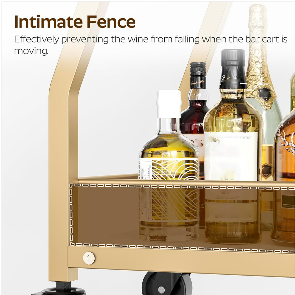
Image: Detail of the protective fence on the bar cart's shelves, designed to secure items.

Effectively preventing the wine from falling when the bar cart is moving.