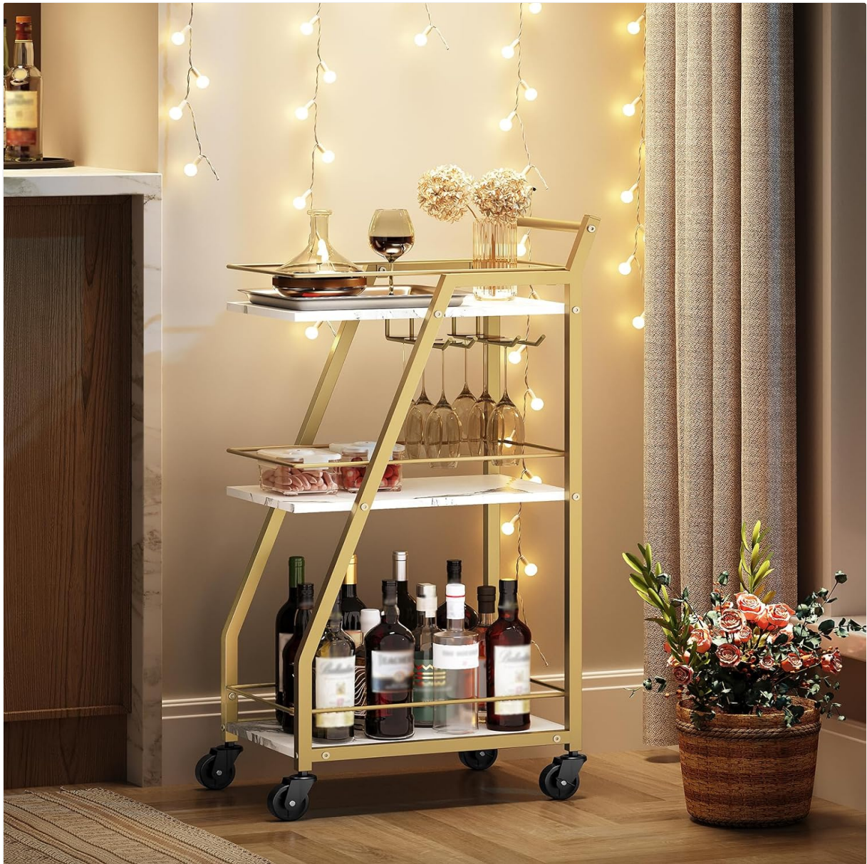
Image: The YATINEY Bar Cart Model BC03DW, a three-tier gold-framed cart with marble-patterned shelves, shown in a living space with various beverages and decor.