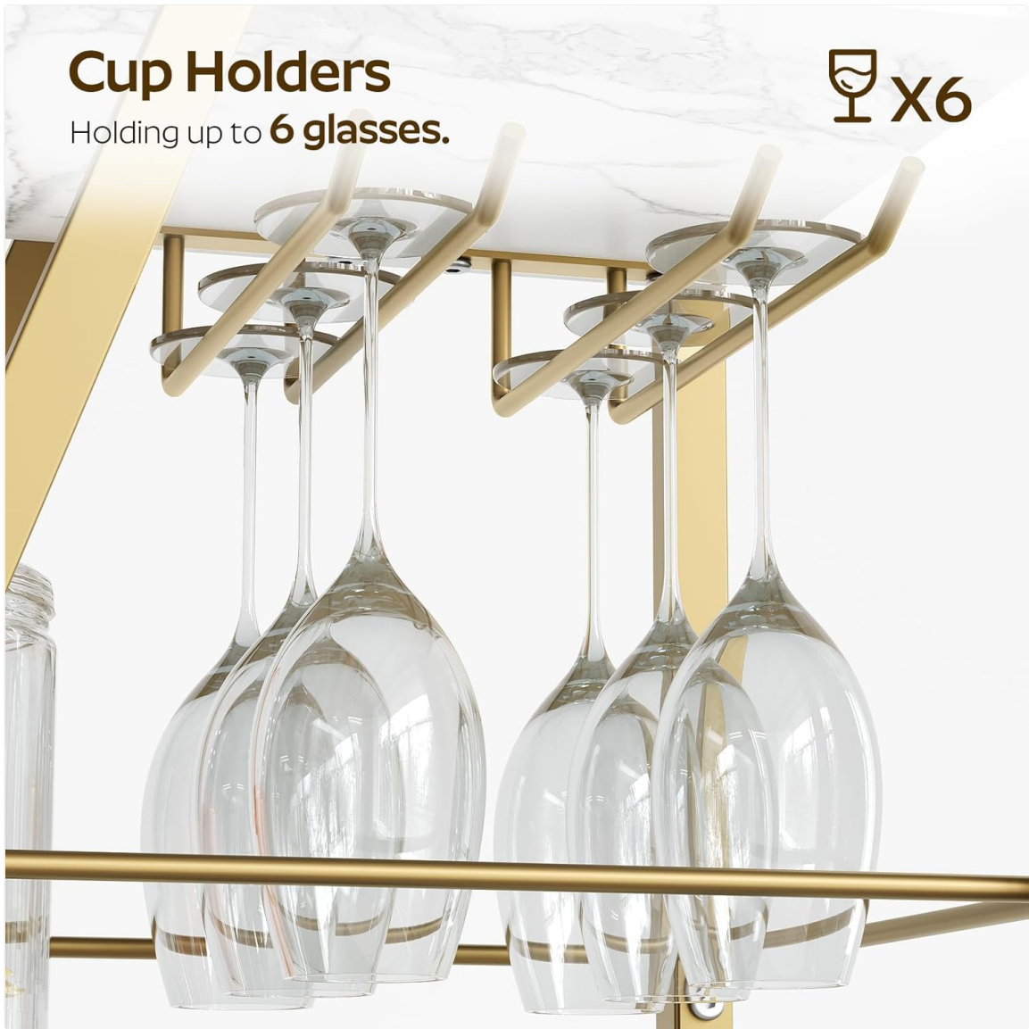
Image: Close-up of the integrated cup holders, capable of storing up to six stemmed glasses.