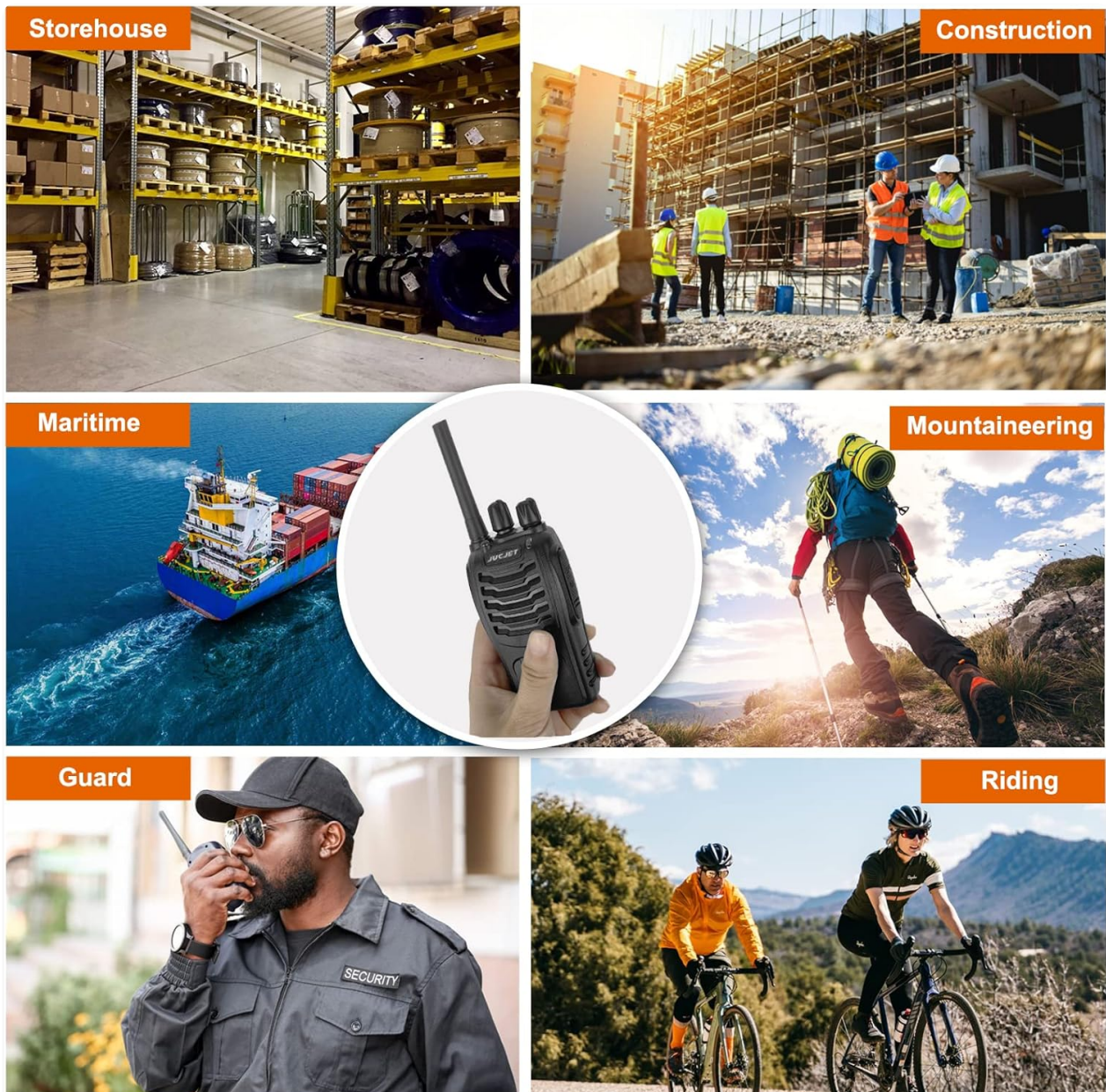
Image: Collage showing various application scenarios for the JUCJET H888S Walkie Talkie, including use in a storehouse, construction site, maritime environment, mountaineering, by security guards, and during cycling.