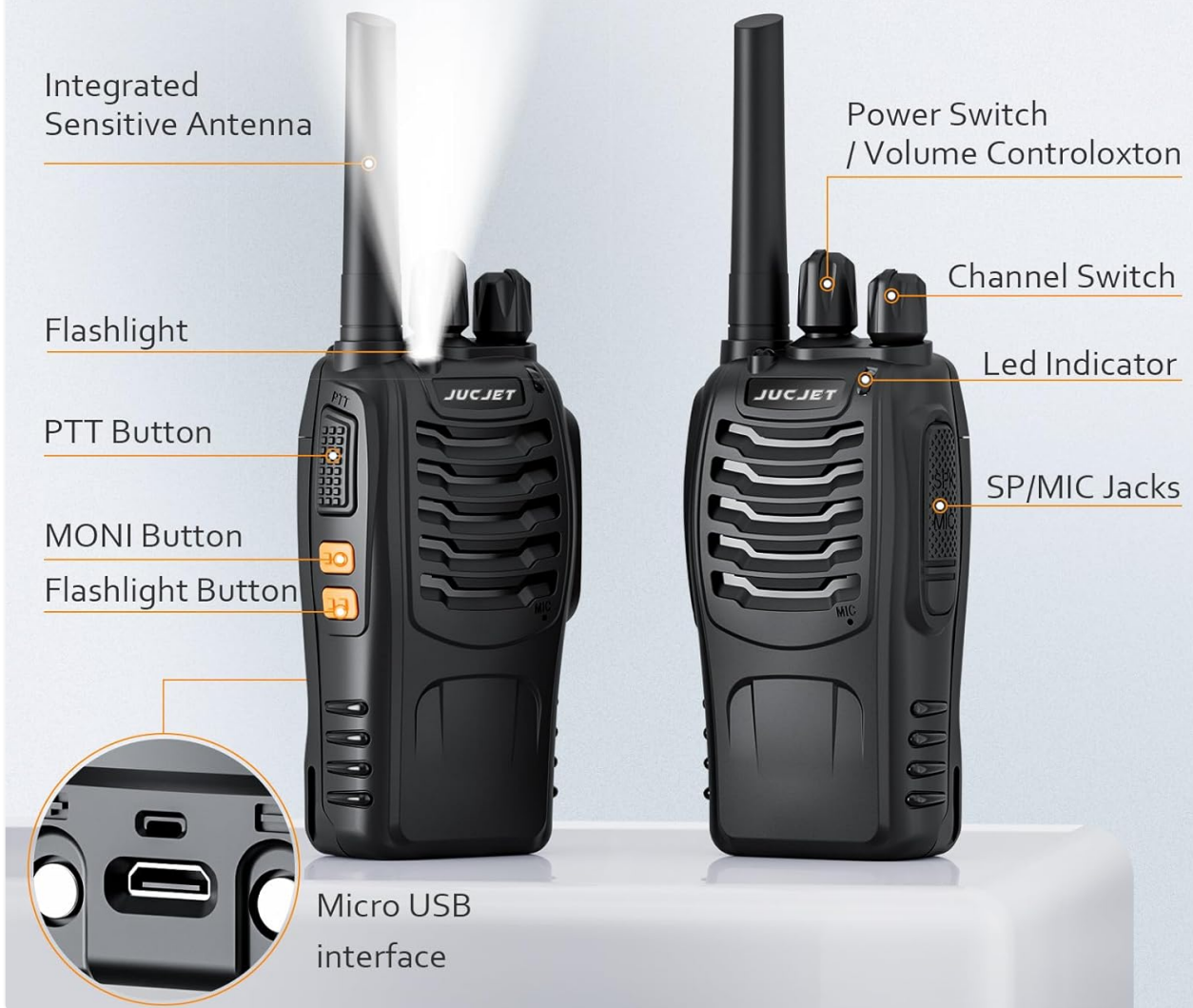
Image: Diagram illustrating the key components of the JUCJET H888S Walkie Talkie, including the integrated sensitive antenna, flashlight, PTT button, MONI button, flashlight button, Micro USB interface, power switch/volume control, channel switch, LED indicator, and SP/MIC jacks.