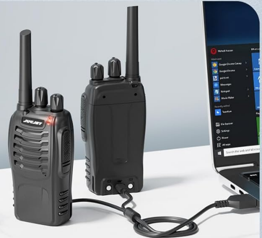
Image: Illustration of two charging methods for the JUCJET H888S Walkie Talkie: using the dedicated charging station and direct USB-C cable charging via a car charger or laptop.