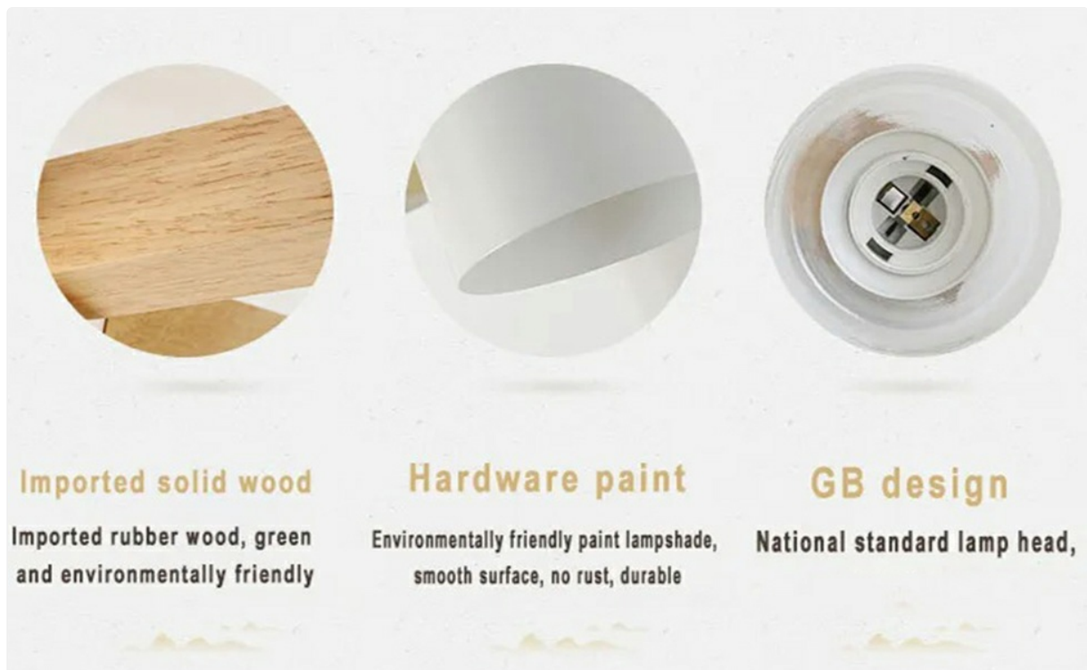
Figure 4.2: Detail of the E26 lamp head and material components.

Your browser does not support the video tag.