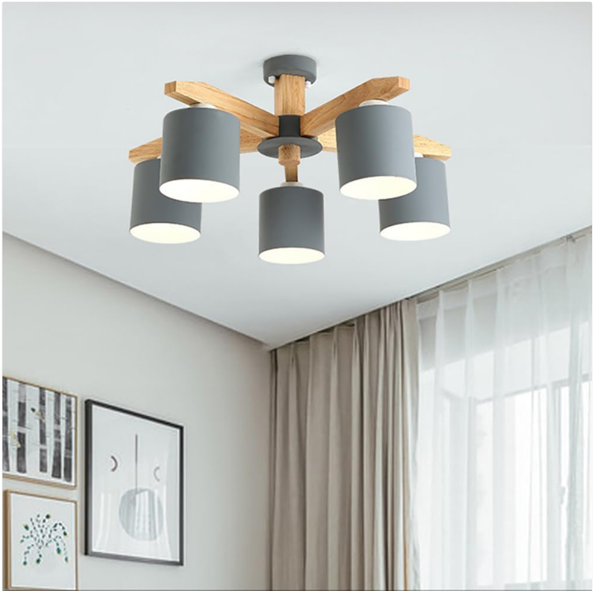
Figure 2.1: Front view of the Liudefa 5-Light Modern Ceiling Pendant Light.