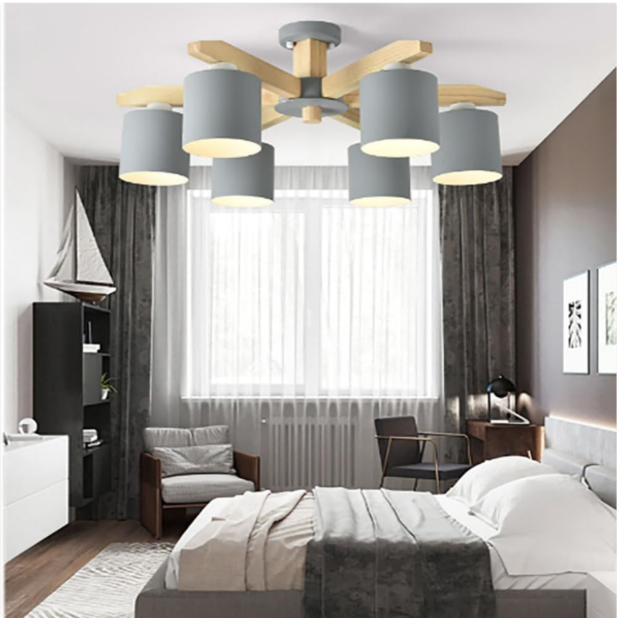
Figure 2.3: The light fixture installed in a bedroom setting.