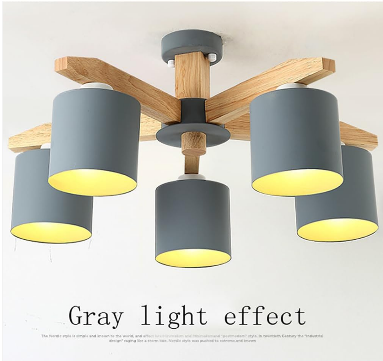
Figure 5.1: The light fixture illuminated, showcasing the light effect.

Once installed and powered, the light fixture can be operated via a standard wall switch. The product specifications also indicate "App" as a control method, suggesting potential smart home integration. Refer to the specific app's instructions for detailed setup and usage if this feature is desired.