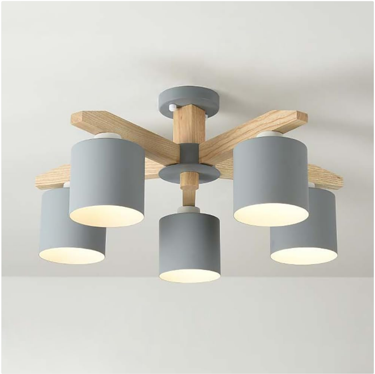
Figure 2.2: Angled view of the Liudefa 5-Light Modern Ceiling Pendant Light, highlighting the wood and metal construction.