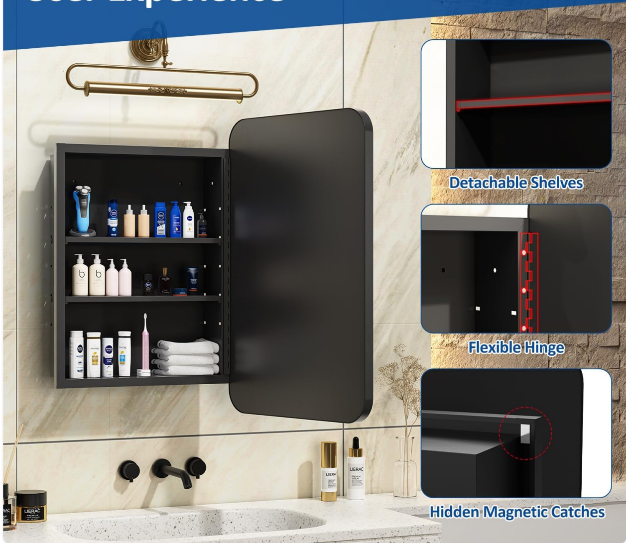
Image: Interior view highlighting detachable shelves and flexible hinges for easy adjustment.