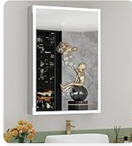
Image: Visual guide for recessed installation.