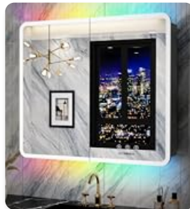
Image: Visual guide for wall-mounted installation.