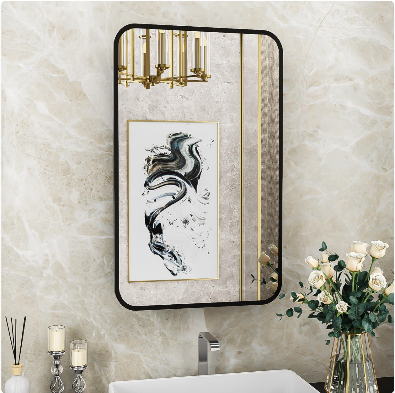
Image: ACEMIRO 16x24 Inch Black Mirror Medicine Cabinet in a bathroom setting.