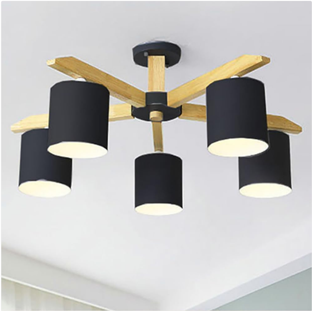
Image 1.1: The Liudefa 8018-5Black 5-Light Modern Wood Flush Mount Ceiling Light. This fixture features five black cylindrical shades mounted on natural wood arms, providing a modern aesthetic suitable for various indoor spaces.