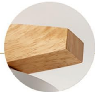
Beautiful and translucent