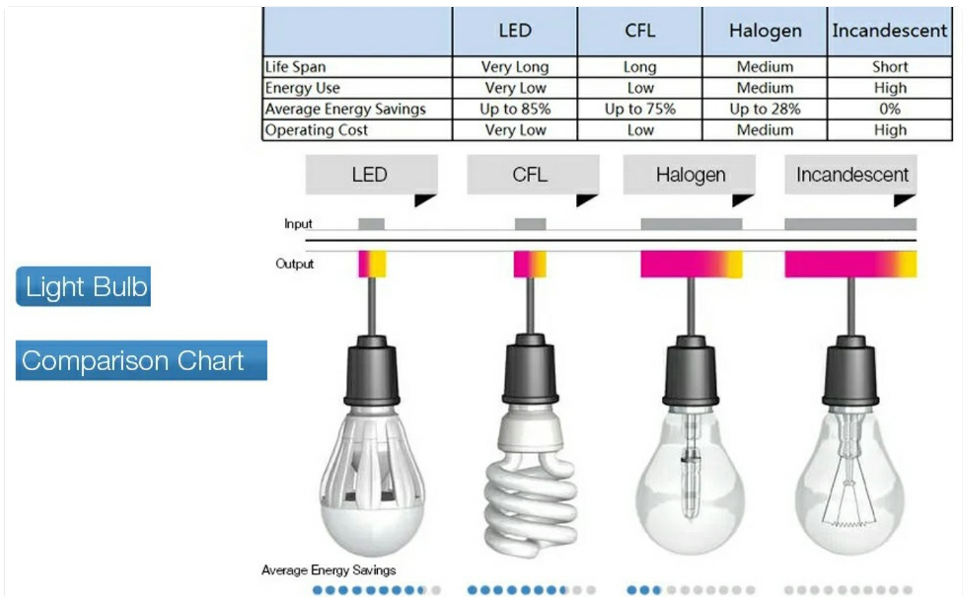
Image 4.2: A comparison chart for different light bulb types (LED, CFL, Halogen, Incandescent) detailing their life span, energy use, average energy savings, and operating cost. This fixture is compatible with E26 bulbs, including LED options.