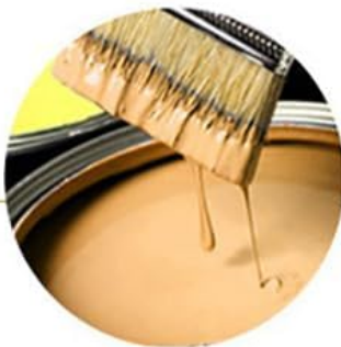
Environmental protection paint

Non-polluting, environmentally friendly paint, good decorative performance, smooth and delicate