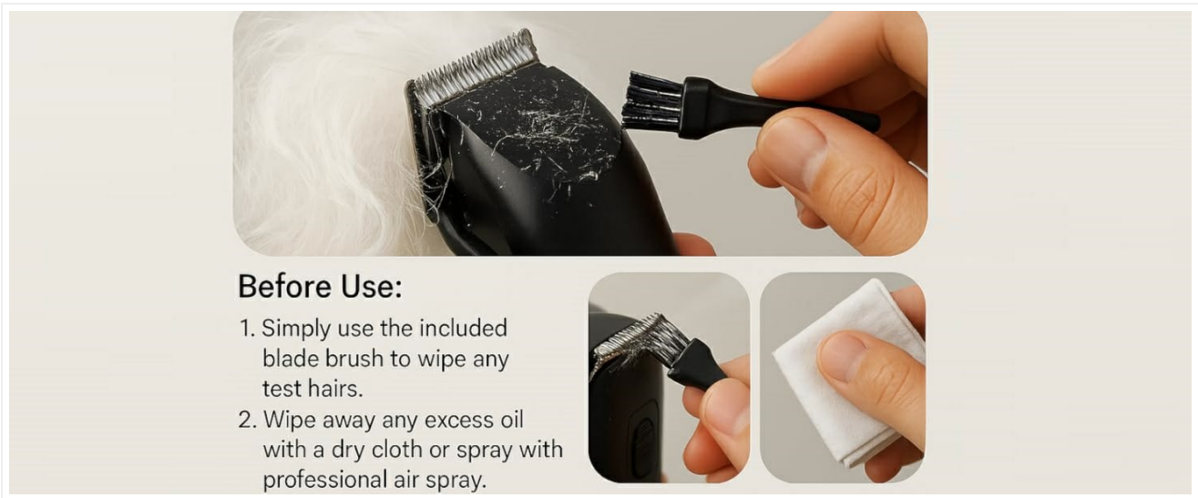
Image 3: Demonstrating initial blade cleaning with the provided brush.