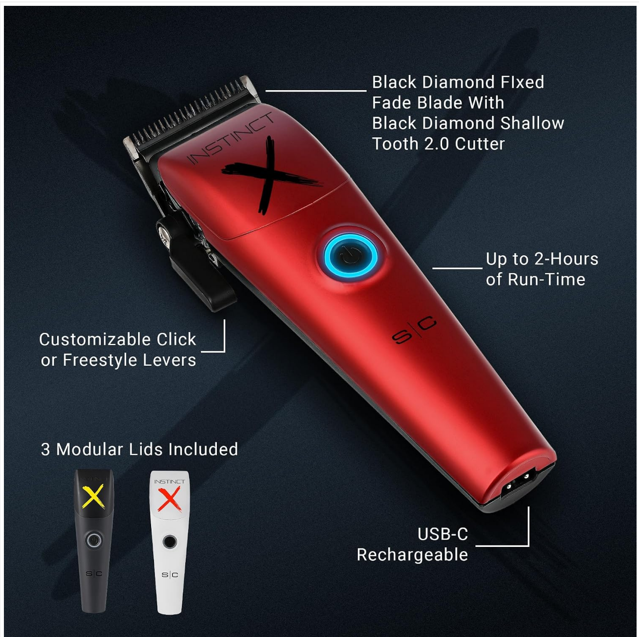
Image 5: The Stylecraft Instinct-X clipper displayed with its three modular lids.