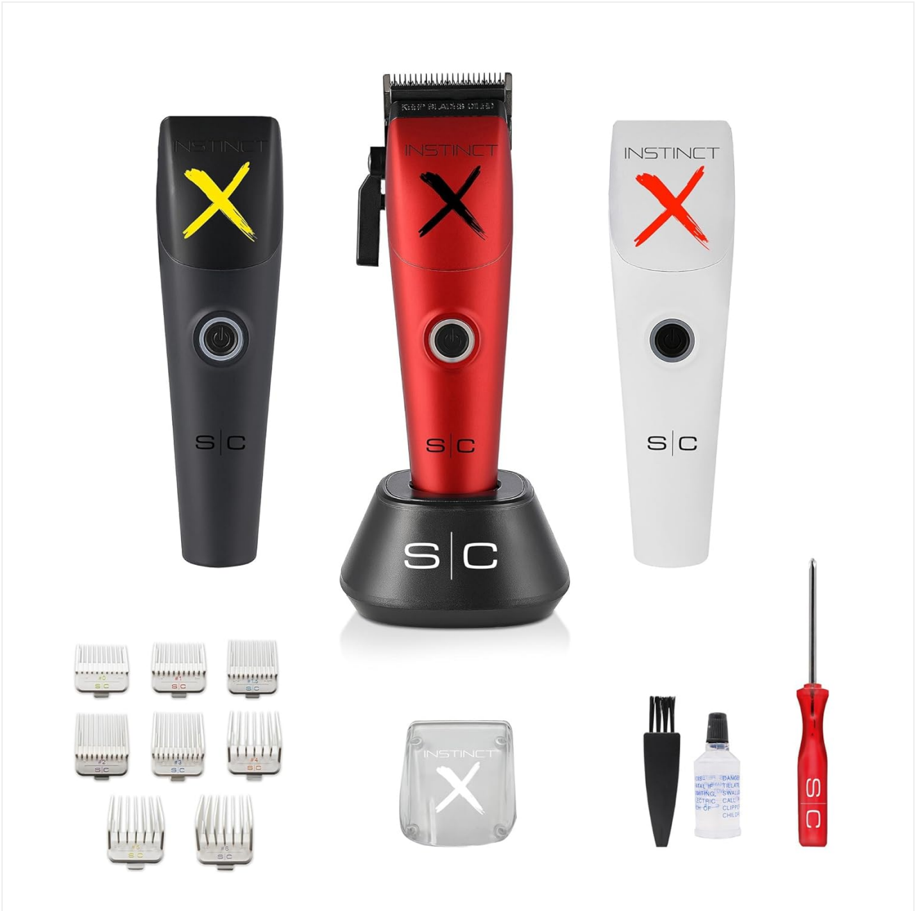
Image 2: Included components with the Stylecraft Instinct-X clipper.

Upon opening the package, verify that all components are present. The package should include the clipper, 8 Dub magnetic guards, a charging stand/cord, a micro-USB cord, 3 levers, 3 interchangeable lids, a showcase window, a cleaning/maintenance kit, and a mini screwdriver.