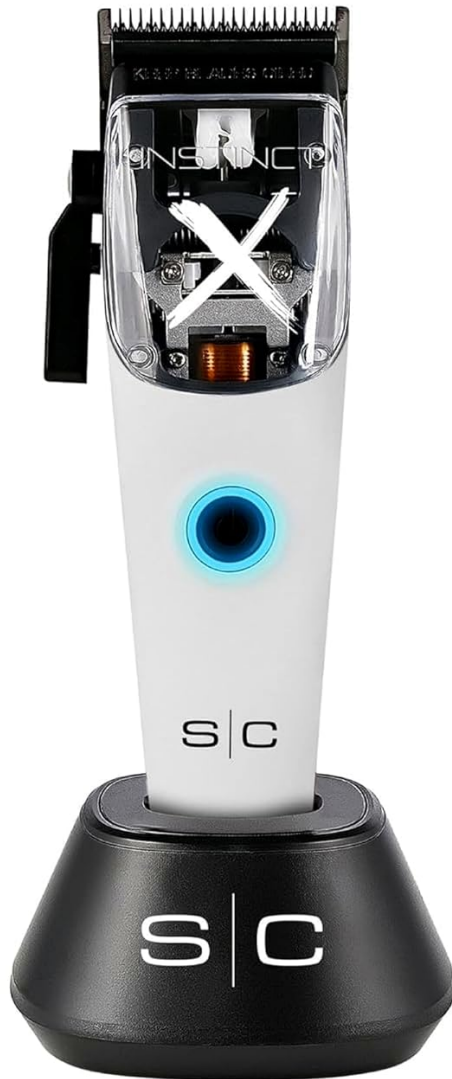
Image 1: Stylecraft Instinct-X Cordless Hair Clipper, showcasing its sleek design.