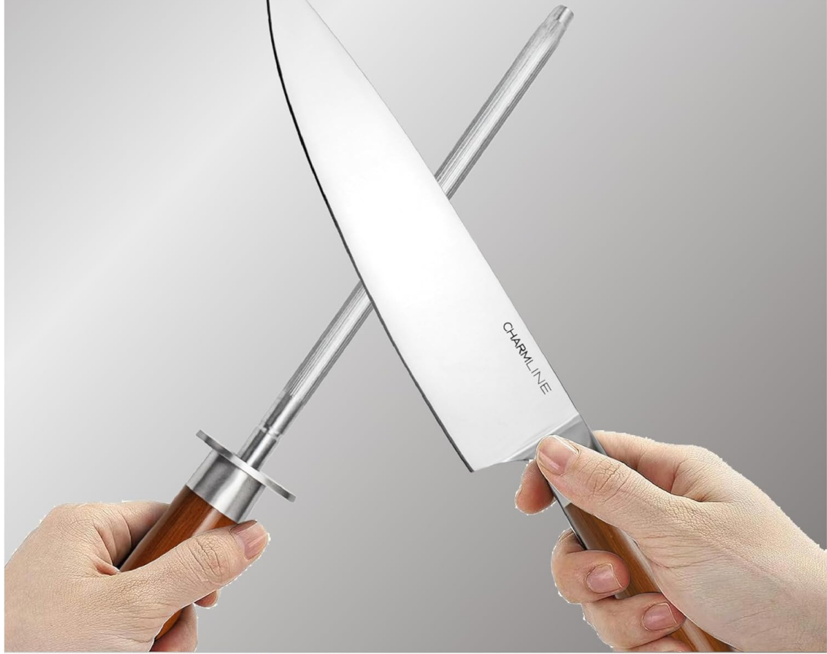
Image 4: A user demonstrating the proper technique for sharpening a Charmline knife using the included sharpening steel.

Keeping your quality knives in excellent condition will enhance your chef capabilities