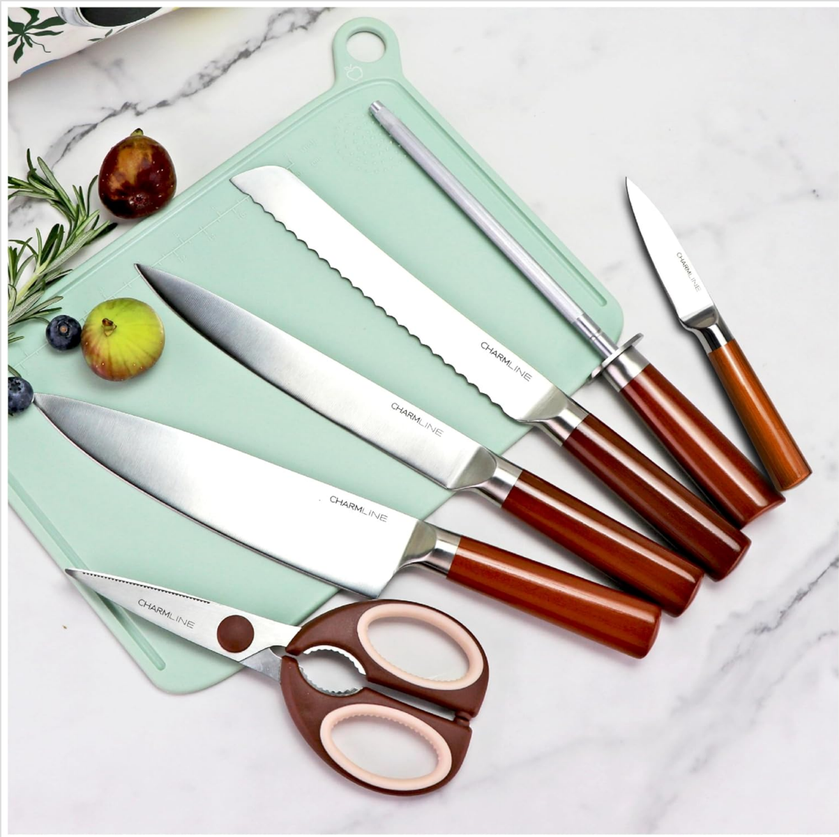
Image 1: Overview of the Charmline 6-Piece Knife Set, showcasing the various knives, scissors, and sharpener.