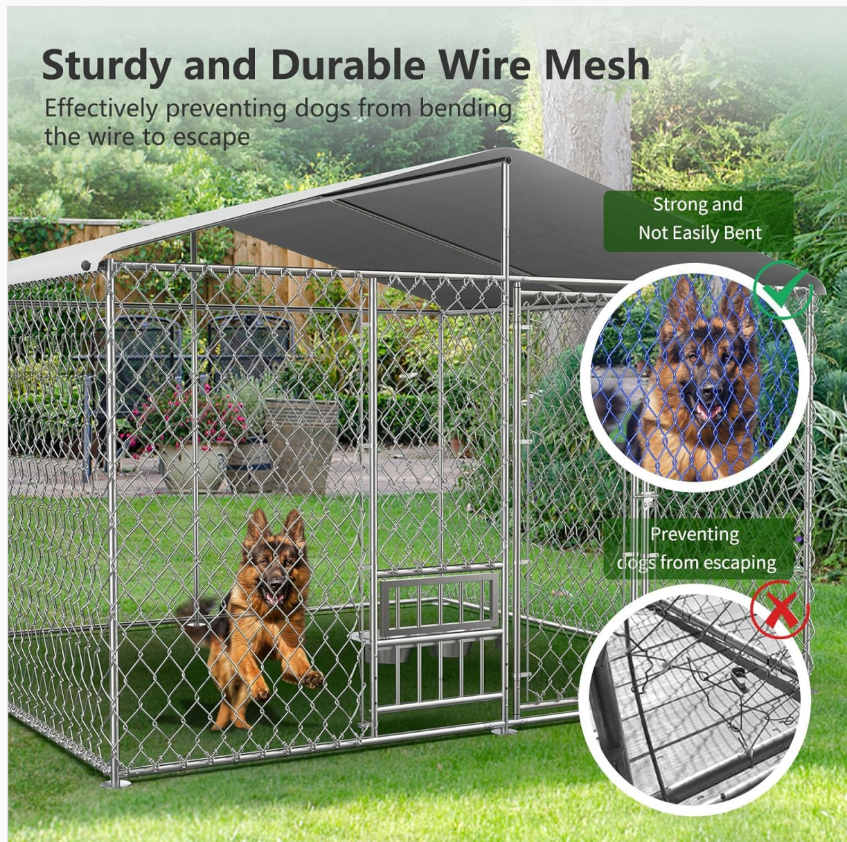
Image: Sturdy and durable wire mesh construction, designed to prevent bending and escape.