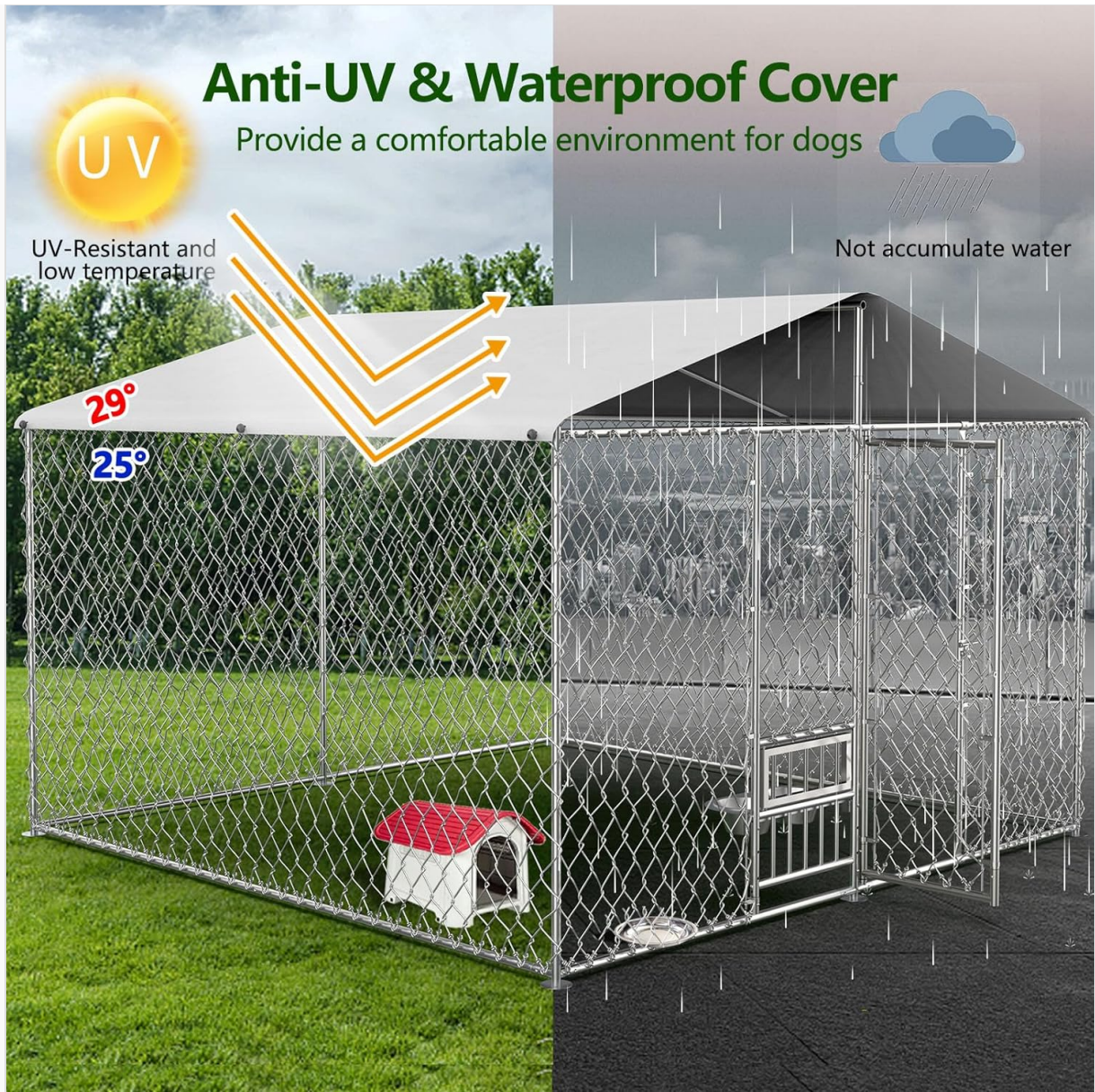
Image: The kennel's roof provides protection from UV rays and rain.