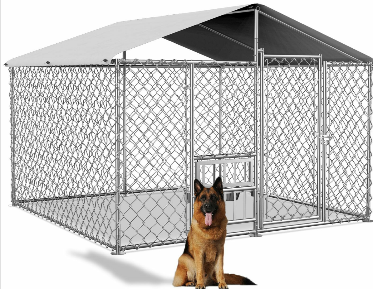
Image: Overview of the assembled Lyromix Outdoor Dog Kennel.

Your browser does not support the video tag.