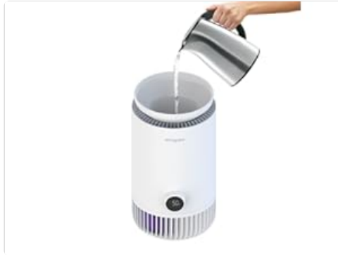
Image 2: Illustrates the process of pouring water into the top reservoir of the air purifier.