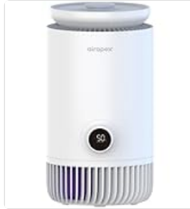
Image 3: Close-up of the AIRAPEX T3 Air Purifier's digital display and touch controls.