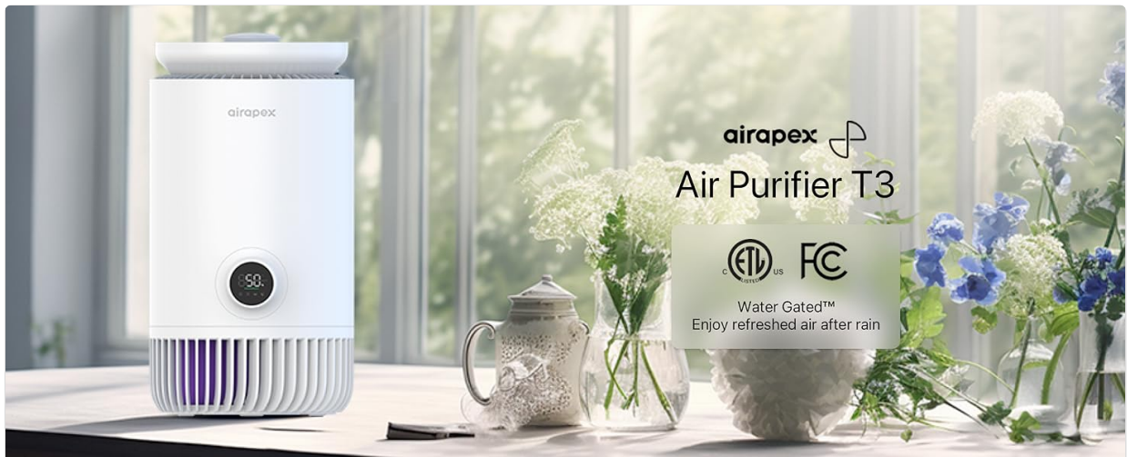
Image 1: AIRAPEX T3 Air Purifier highlighting 'Water Gated' technology for refreshed air.

Thank you for choosing the AIRAPEX T3 Air Purifier Activated Charcoal Water Filter. This filter is designed to work with your AIRAPEX T3 Air Purifier to enhance air quality through a dual-effect purification system. It combines a HEPA filter with a water washing filter to thoroughly purify physical, biological, and chemical pollutants. The premium granular activated carbon filter effectively absorbs unwanted odors and fumes, including smoke, cooking odors, pet odors, and Volatile Organic Compounds (VOCs). The water filter component captures residual sediment, chemicals, and heavy metals from the water used for humidification. This manual provides essential information for proper setup, operation, and maintenance to ensure optimal performance and longevity of your filter.