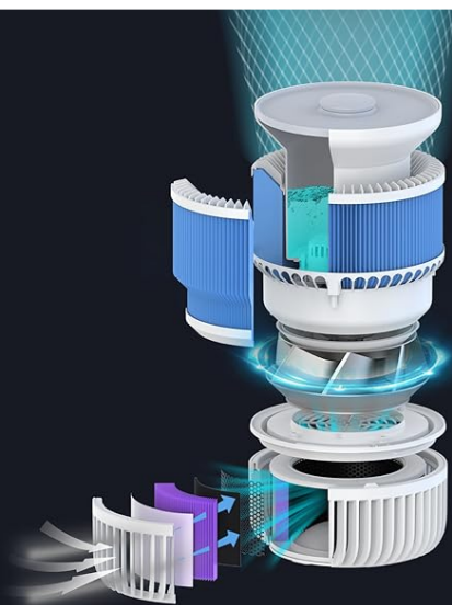
Image: Diagram illustrating the multi-stage filtration system of the AIRAPEX T3 Air Purifier, including the HEPA filter.