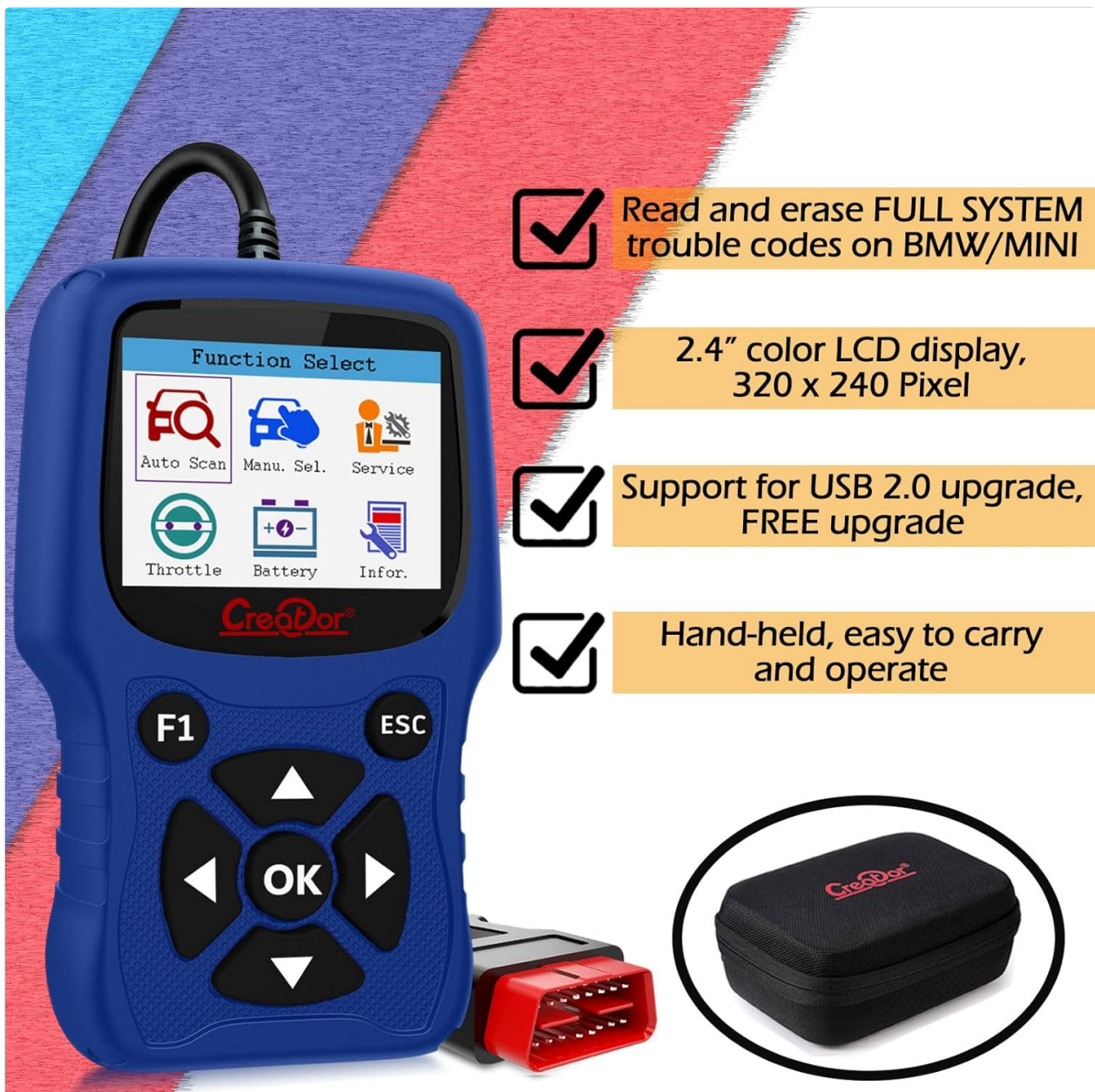
Image: The Creator C420 scanner with its OBD-II connector, ready for connection to a vehicle.