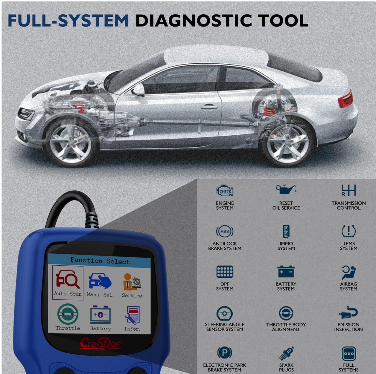
Image: Visual representation of the full system diagnostic capabilities of the C420 scanner.