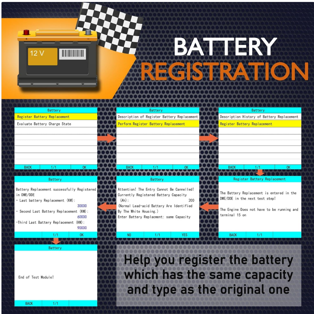
Image: Step-by-step screen prompts for performing battery registration using the C420 scanner.