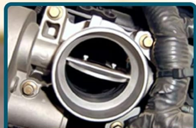
THROTTLE BODY ALIGNMENT

Image: Examples of advanced features available on the C420, including battery registration, CBS reset, and oil reset.