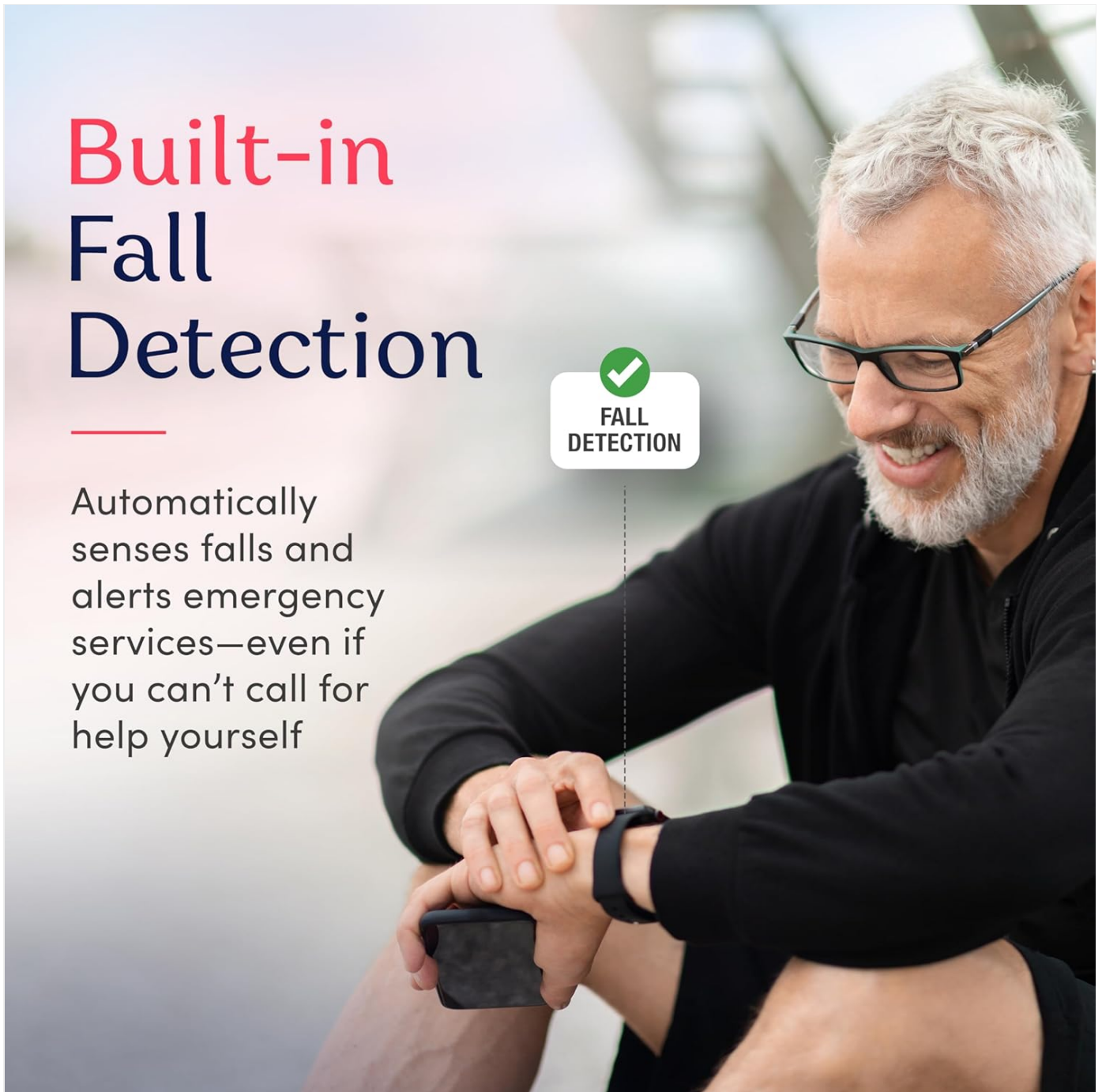
Image: The smartwatch's built-in fall detection feature, which automatically alerts emergency services.