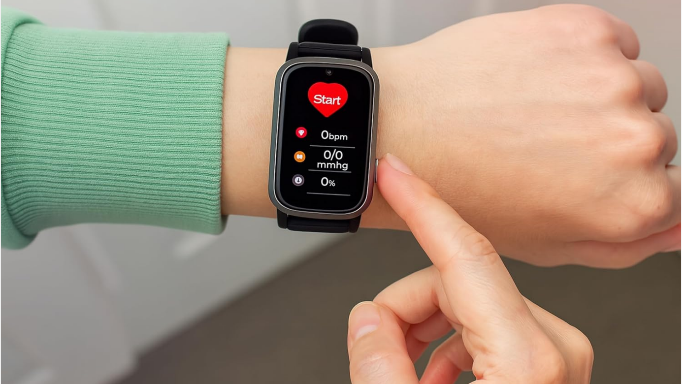
Image: The smartwatch displaying real-time health tracking data.

Monitors heart rate, blood pressure, oxygen levels, number of steps, and inactivity period