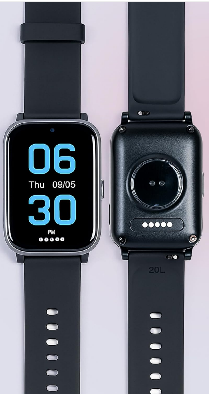
Image: The Smart Med Alert Smart Watch and its charging accessories as found in the box.