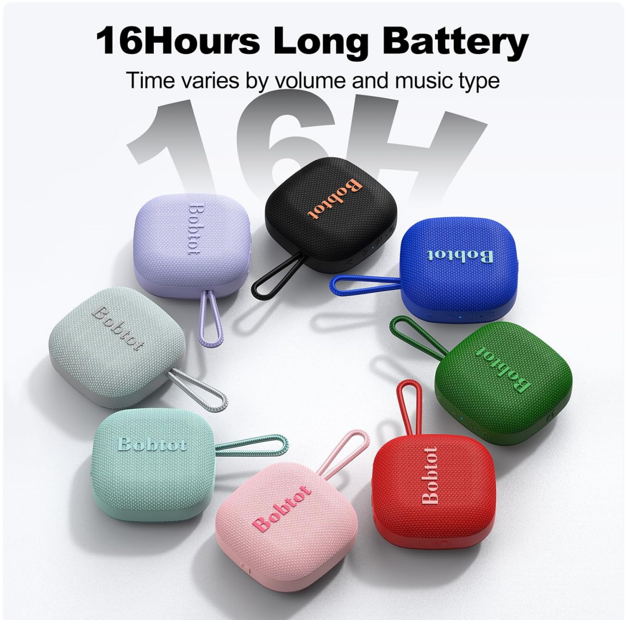
Image: An array of Bobtot speakers in different colors, illustrating the product's 16-hour battery life.