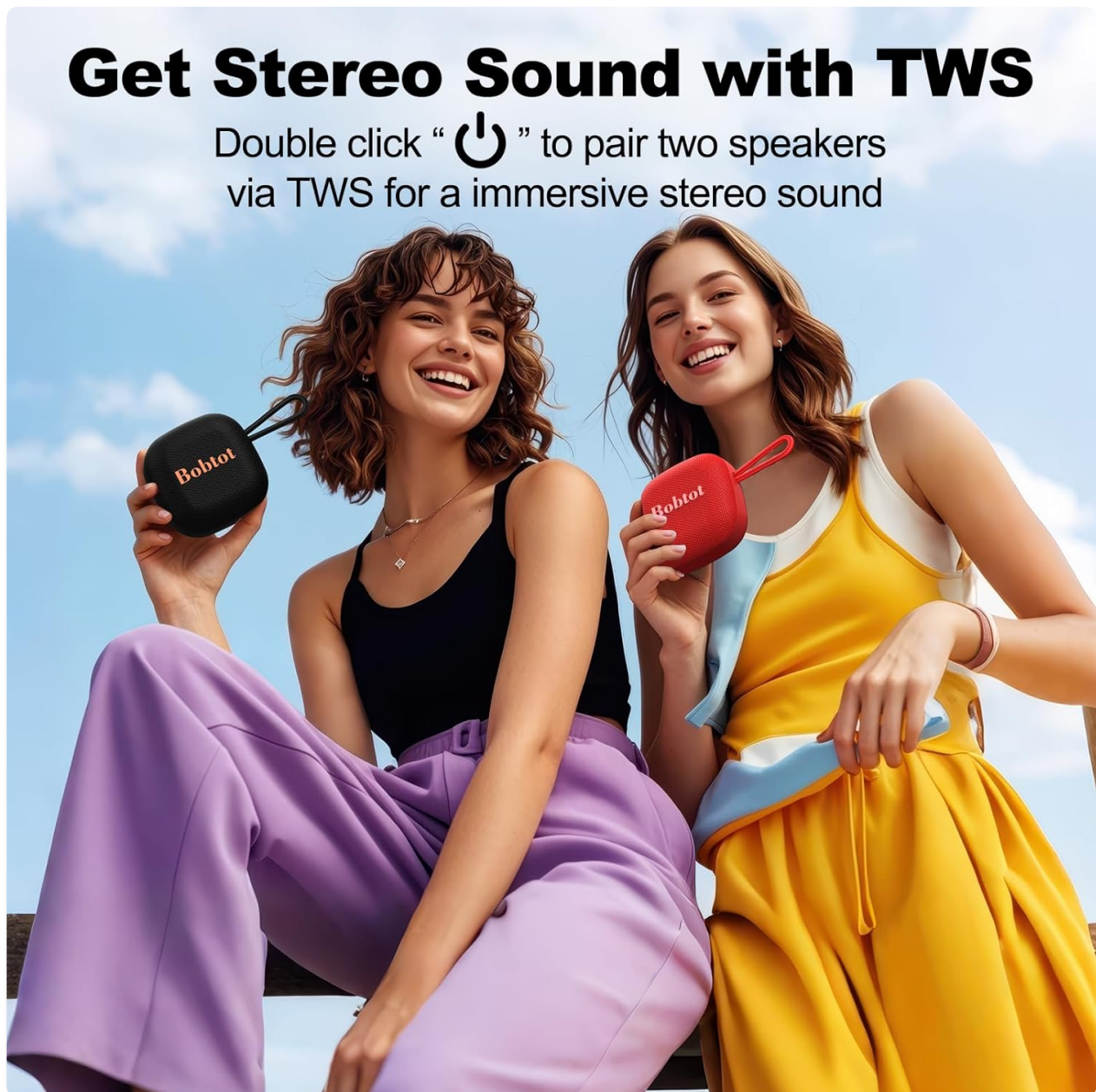
Image: Two Bobtot speakers demonstrating True Wireless Stereo (TWS) pairing for an immersive audio experience.