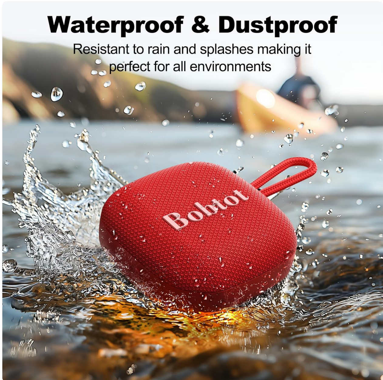
Image: The Bobtot speaker in water, illustrating its waterproof and dustproof design, suitable for various environments.