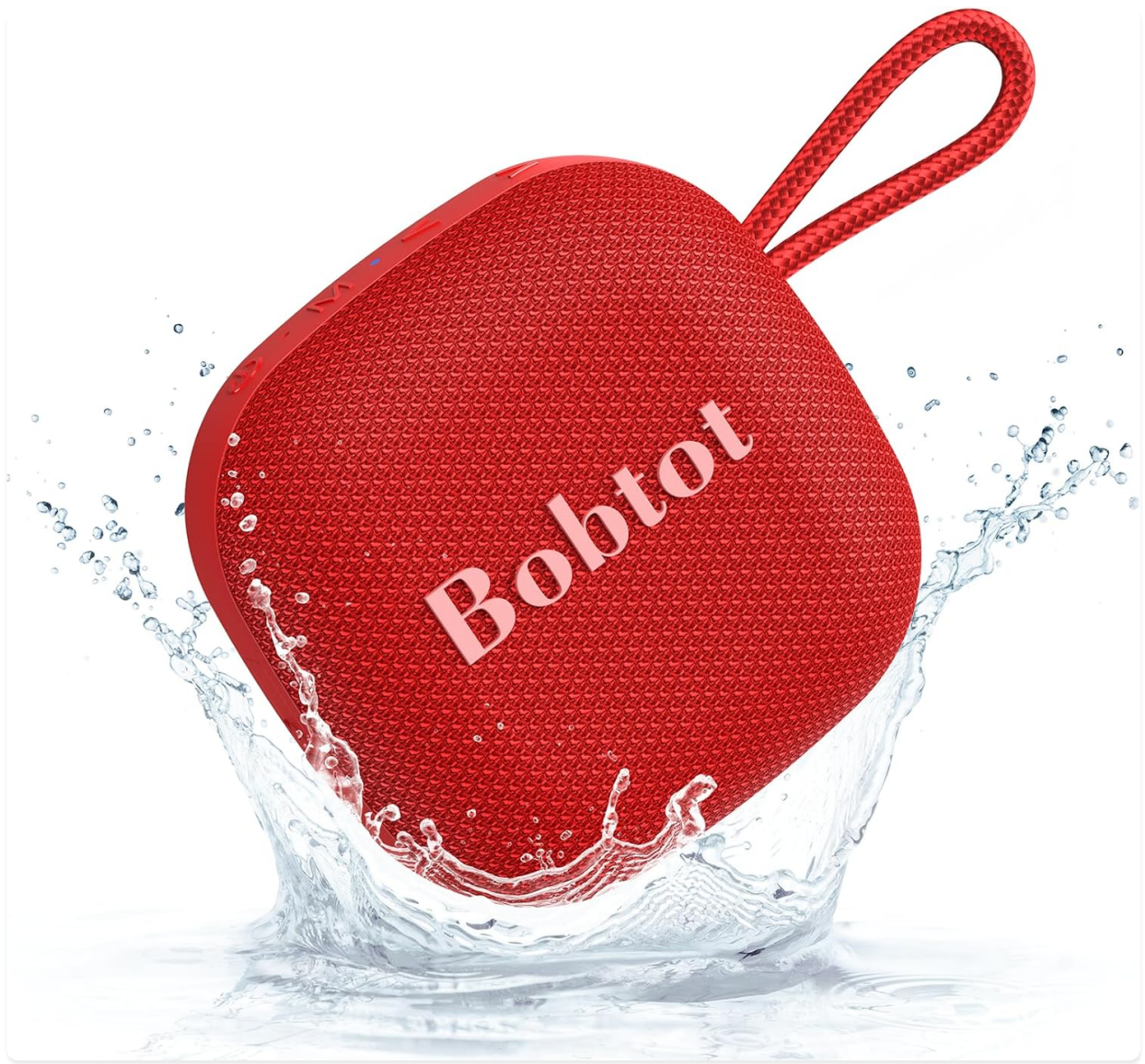
Image: The Bobtot Portable Bluetooth Speaker, Model ET35, demonstrating its IPX7 waterproof capability by being partially submerged in water.