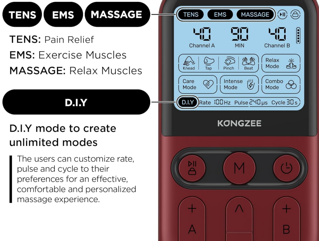
Image 4.1: Detailed view of the device's screen and control buttons, highlighting TENS, EMS, Massage, and D.I.Y. modes.