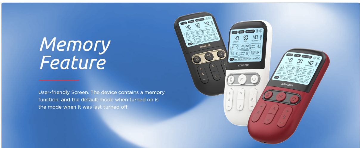
Image 5.2: The device features a USB-C charging port for convenient power replenishment, offering up to 90 minutes of use per charge.