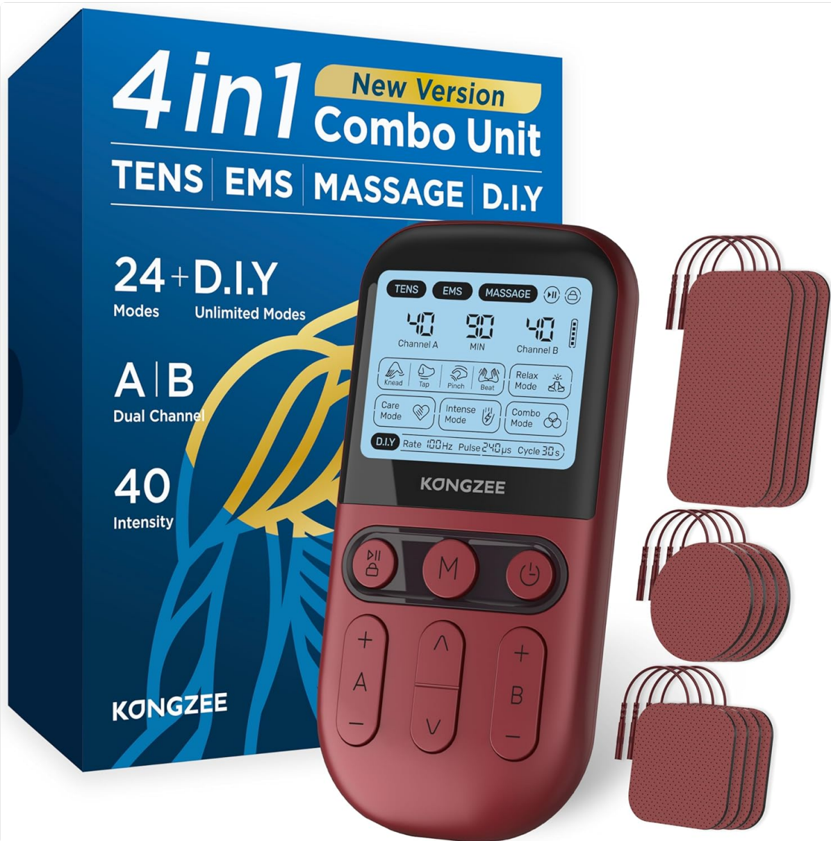
Image 1.1: Kongzee 4-in-1 TENS EMS Massage Muscle Stimulator with its packaging and electrode pads.