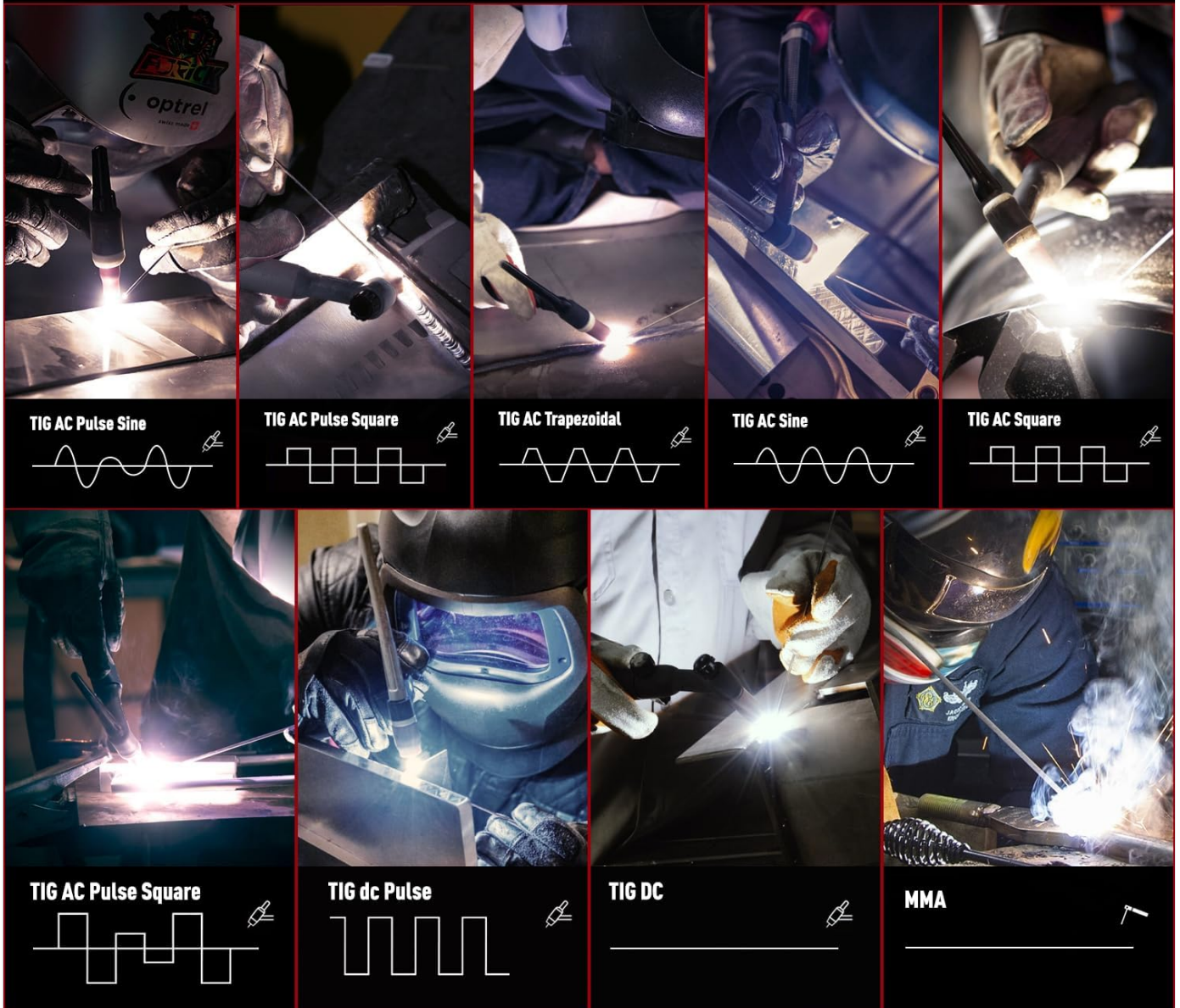
Image: A comprehensive display of the nine versatile welding modes offered by the ANDELI TIG-250Pro ACDC, illustrating different TIG AC Pulse, TIG AC, TIG DC, and MMA options for diverse welding needs.