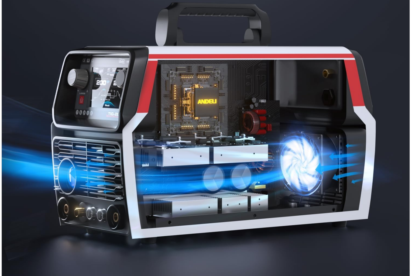
Image: Visual representation of the safety features integrated into the ANDELI TIG-250Pro ACDC welding machine, highlighting VDR, over-voltage, overload, overheating, and over-current protection.