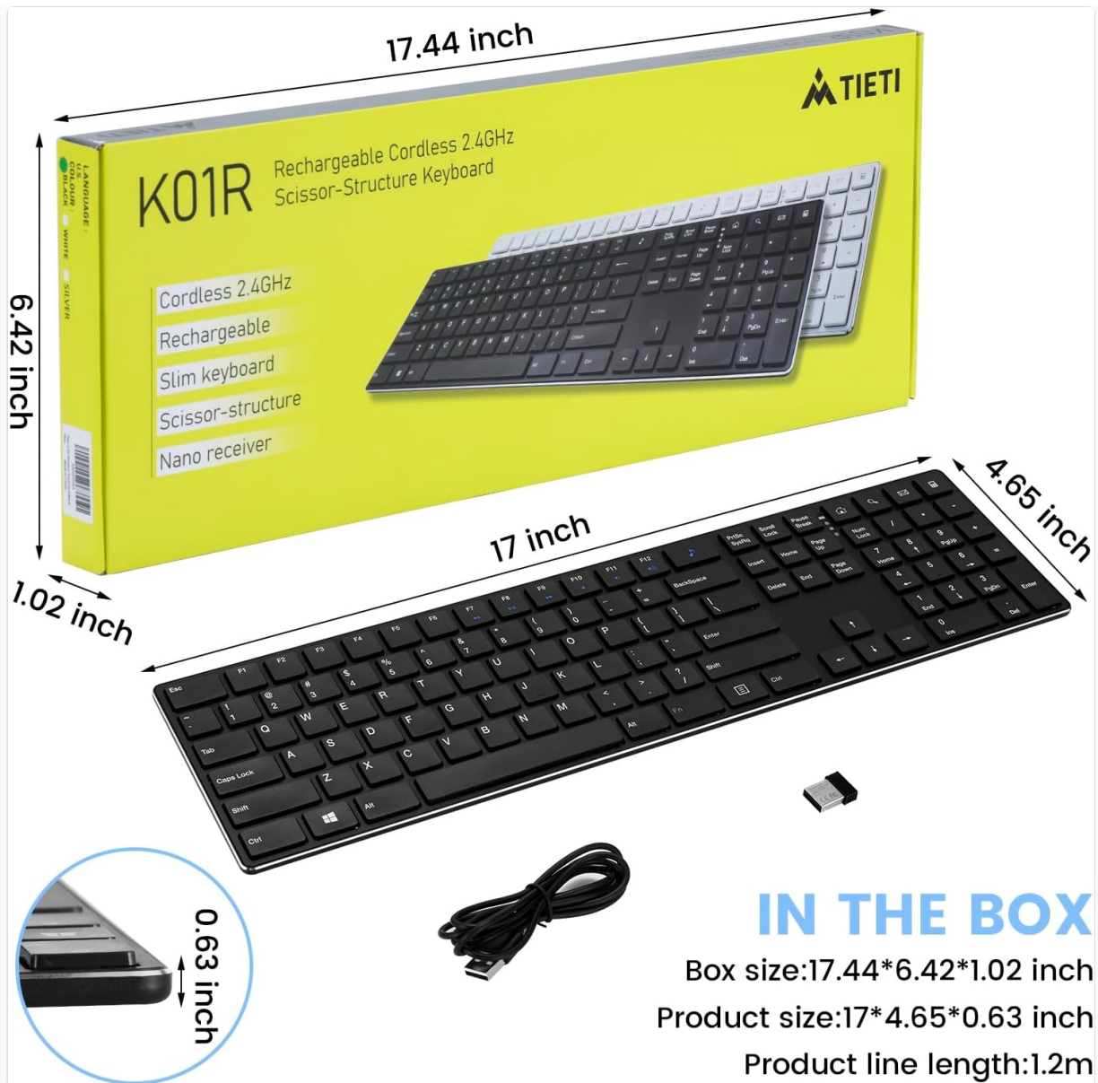
Image: Contents of the TIETI K01R Wireless Keyboard package, including the keyboard, USB receiver, and USB charging cable, alongside the product box with dimensions.