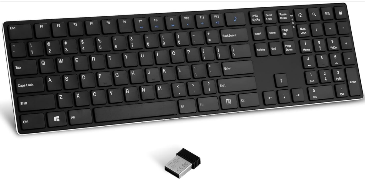
Image: The TIETI K01R Wireless Keyboard, showcasing its full-size layout and the compact USB receiver.