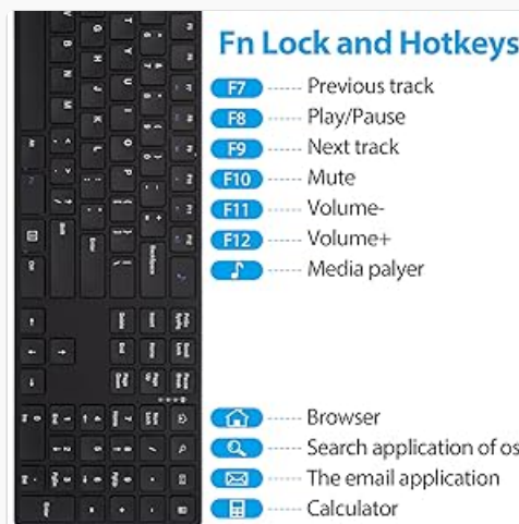
Image: A visual guide to the multimedia function keys (hotkeys) on the keyboard, indicating their respective actions when used with the Fn key.

The keyboard features 12 multimedia shortcuts accessible via the Function (Fn) key. Press and hold the Fn key, then press the corresponding F-key to activate the shortcut.