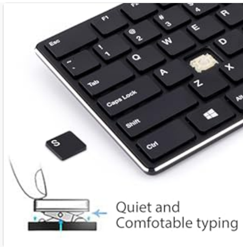
Image: A detailed view of the scissor switch mechanism beneath a keycap, illustrating the design that contributes to quiet and comfortable typing.