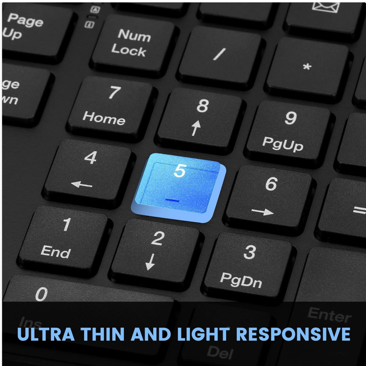
Image: A close-up of the numeric keypad, demonstrating the ultra-thin profile and responsive keys.