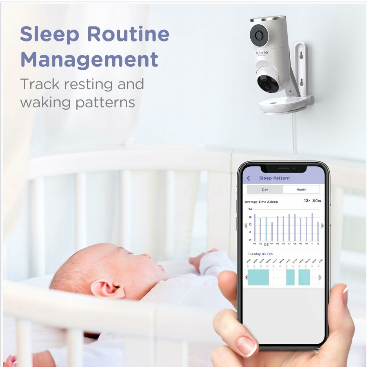
Image: Key features of the Nursery Pal Dual Vision Smart Camera.