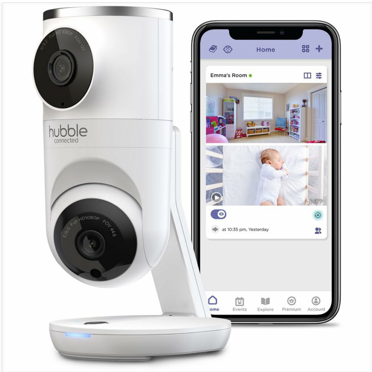
Image: Camera connected to the HubbleClub app on a smartphone.