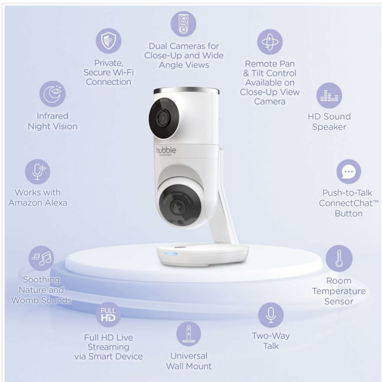
Image: Camera placed on a flat surface.