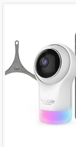
Image: Push-to-Talk ConnectChat button on the camera base.

Use the ConnectChat feature in the app to speak to your baby. Press and hold the microphone icon in the app to transmit your voice through the camera's speaker. This can be used to soothe your baby or communicate with them.