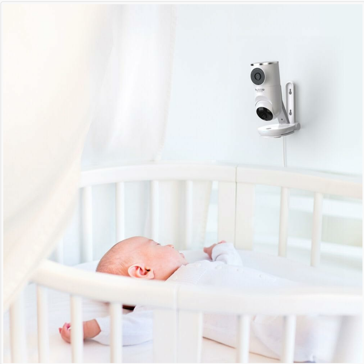
Image: Sleep routine management and tracking within the HubbleClub app.