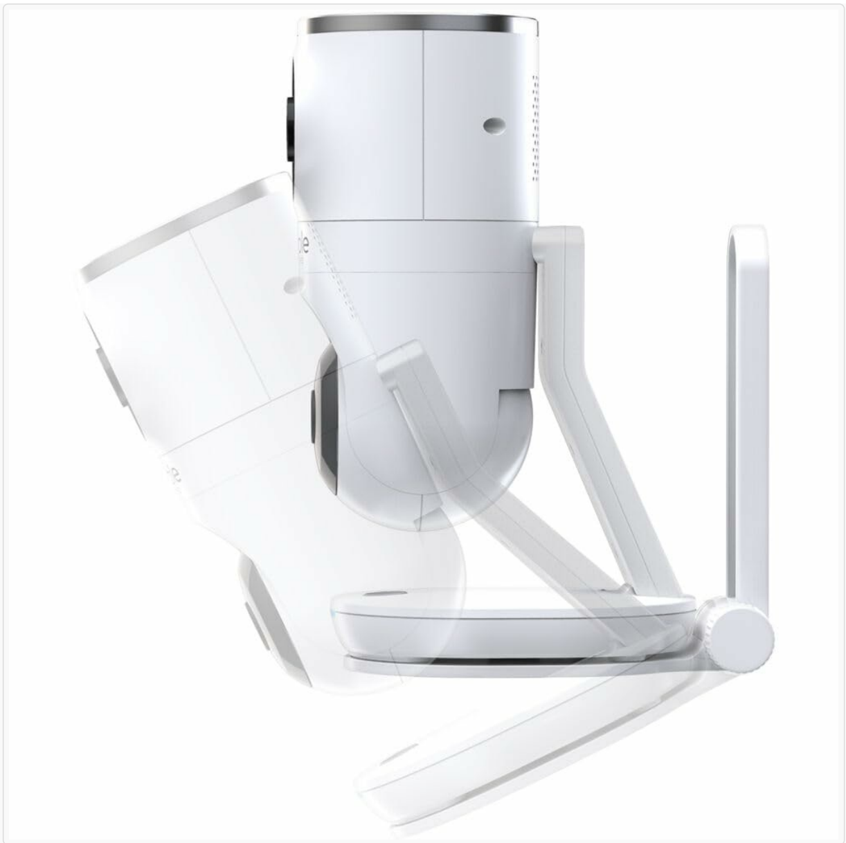
AI Motion Tracking in action, keeping the baby in view.