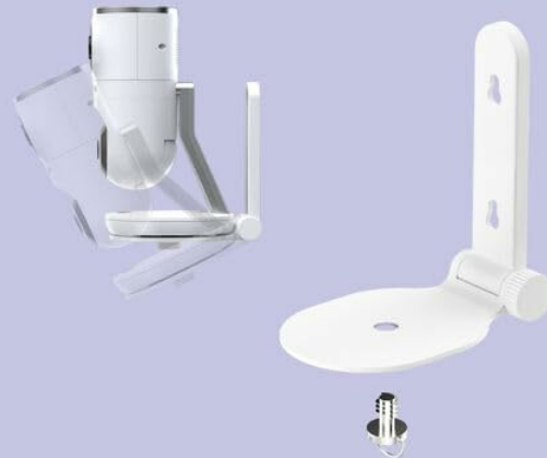
Universal Wall Mount