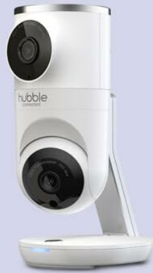
Wi-Fi HD Dual Lens Camera