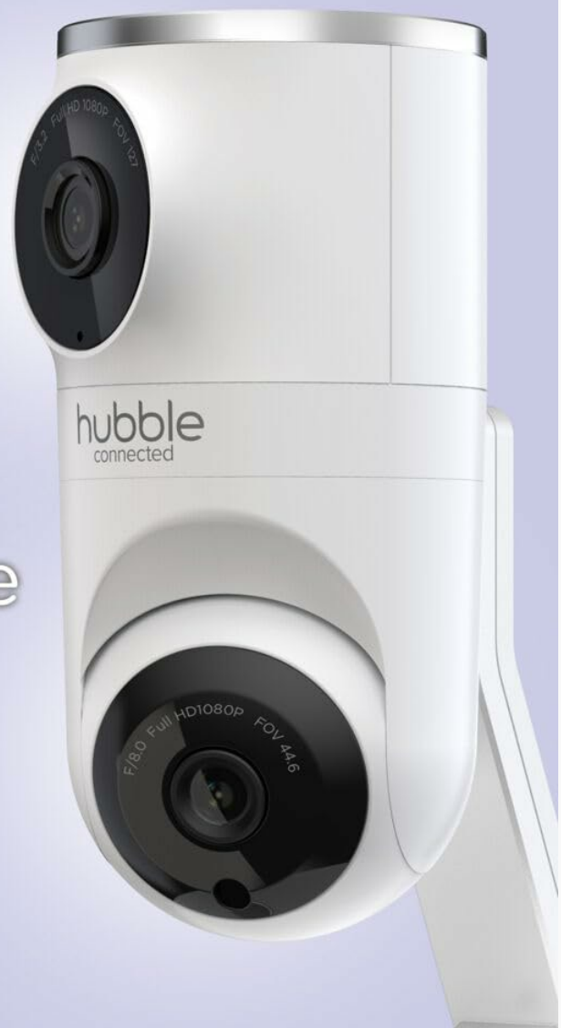
Image: Patented Dual Camera Technology for close-up and wide-angle views.

Patented Dual Camera technology with Close-up View and Wide Angle View