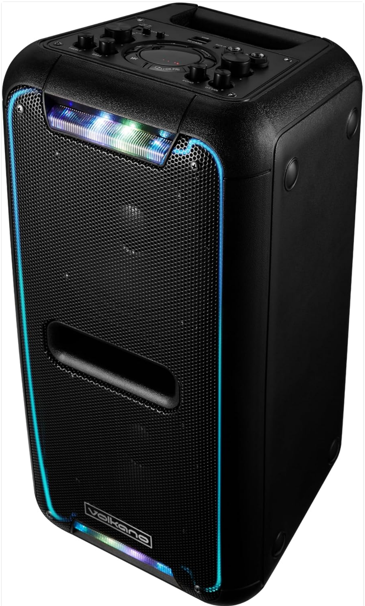
Figure 4.2: Top and side view of the speaker, illustrating the control panel with various buttons and ports for operation.