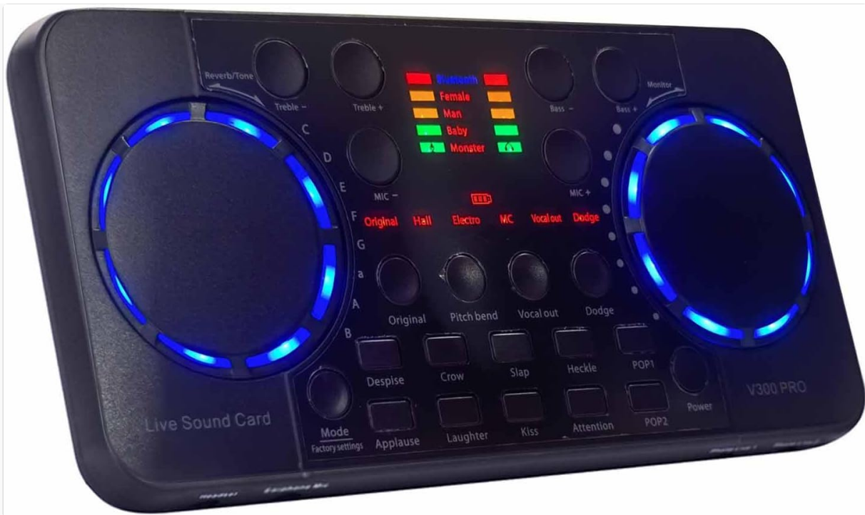
Figure 4.1: Front view of the JINGFENG V300 Pro Live Sound Card, showcasing its control panel and illuminated dials.