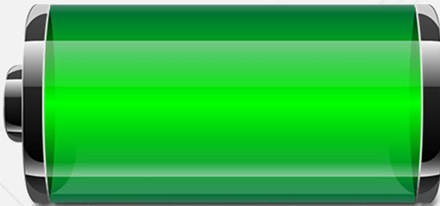
Figure 5.1: The sound card is equipped with a built-in rechargeable battery for extended use.

BUILT IN RECHARGEABLE BATTERY, LONG DURATION