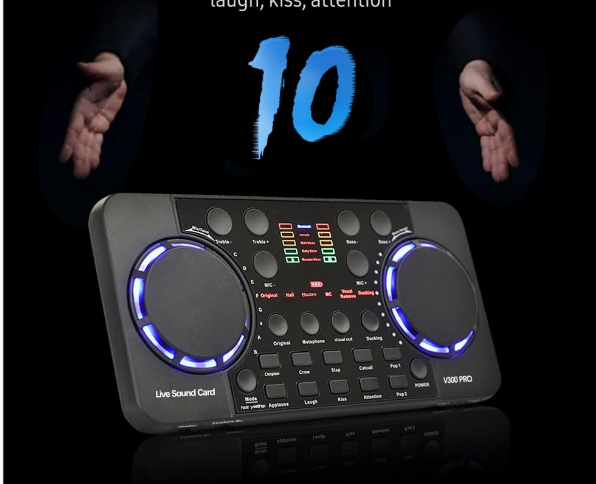
Figure 6.1: The sound card features 10 distinct sound effects, including contempt, crow, slap, catcall, pop 1, pop 2, applause, laugh, kiss, and attention.

contempt, crow, slap, catcall, pop 1, pop 2, applause, laugh, kiss, attention