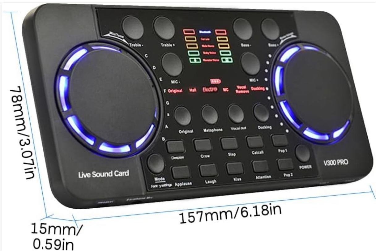
Figure 9.1: Physical dimensions of the JINGFENG V300 Pro Live Sound Card.