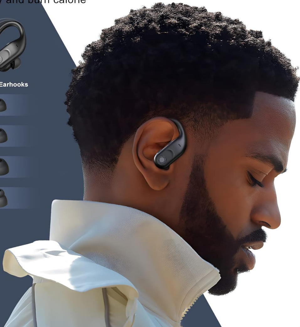
Image: A person wearing a Jzones U7 earbud, highlighting the flexible earhook design. Various ear tip sizes (S, M, L, D) are also shown for customizable fit.