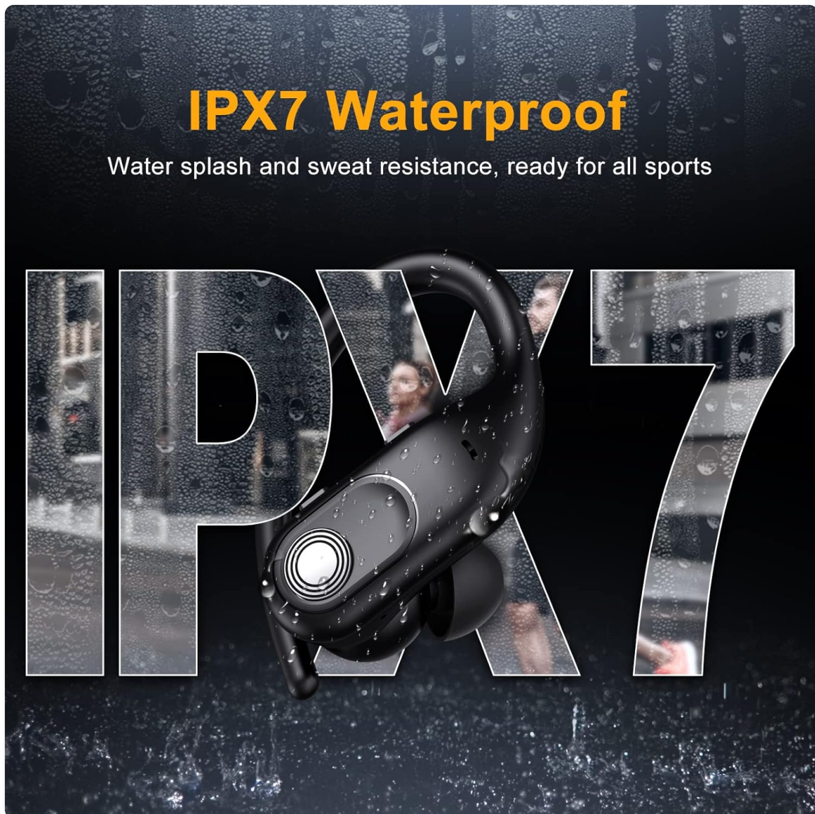
Image: A Jzones U7 earbud partially submerged in water, with water droplets splashing around, emphasizing its IPX7 waterproof feature.