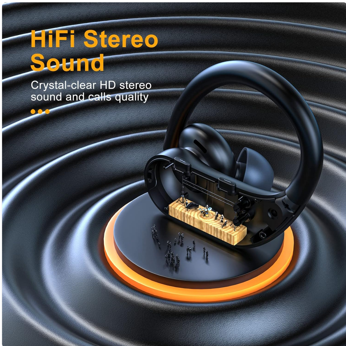
Image: A detailed view of the Jzones U7 earbud's internal speaker components, illustrating its Hi-Fi stereo sound capabilities.