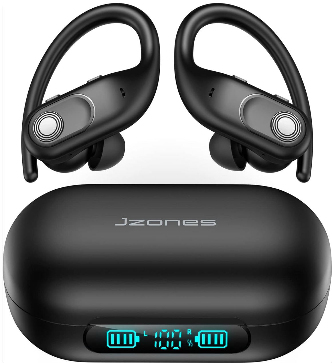
Image: Jzones U7 Wireless Earbuds and their charging case, showcasing the LED display.