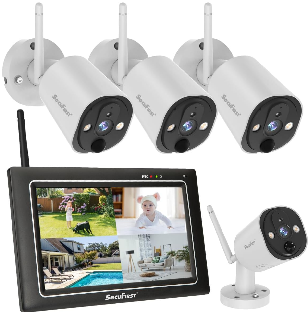
Image: The SecuFirst 2K Wireless Surveillance System, showing the 7-inch monitor displaying a four-camera split view, and four white outdoor cameras.