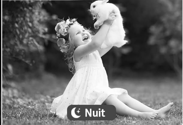
Image: A comparison image showing the camera's 2K/3MP resolution in daylight (color) and its clear night vision in black and white.