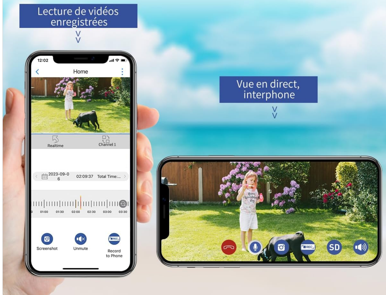
Image: A smartphone showing the "Observer HD+" app interface, demonstrating remote access capabilities alongside the physical monitor.

Connectez le moniteur au WiFi ou à Internet filaire. Vous pouvez également visionner la vidéo via notre application gratuite, partout dans le monde.