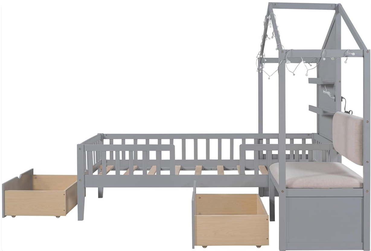
Image Description: This image displays the bed frame with both under-bed storage drawers partially pulled out, revealing their interior space for organization.