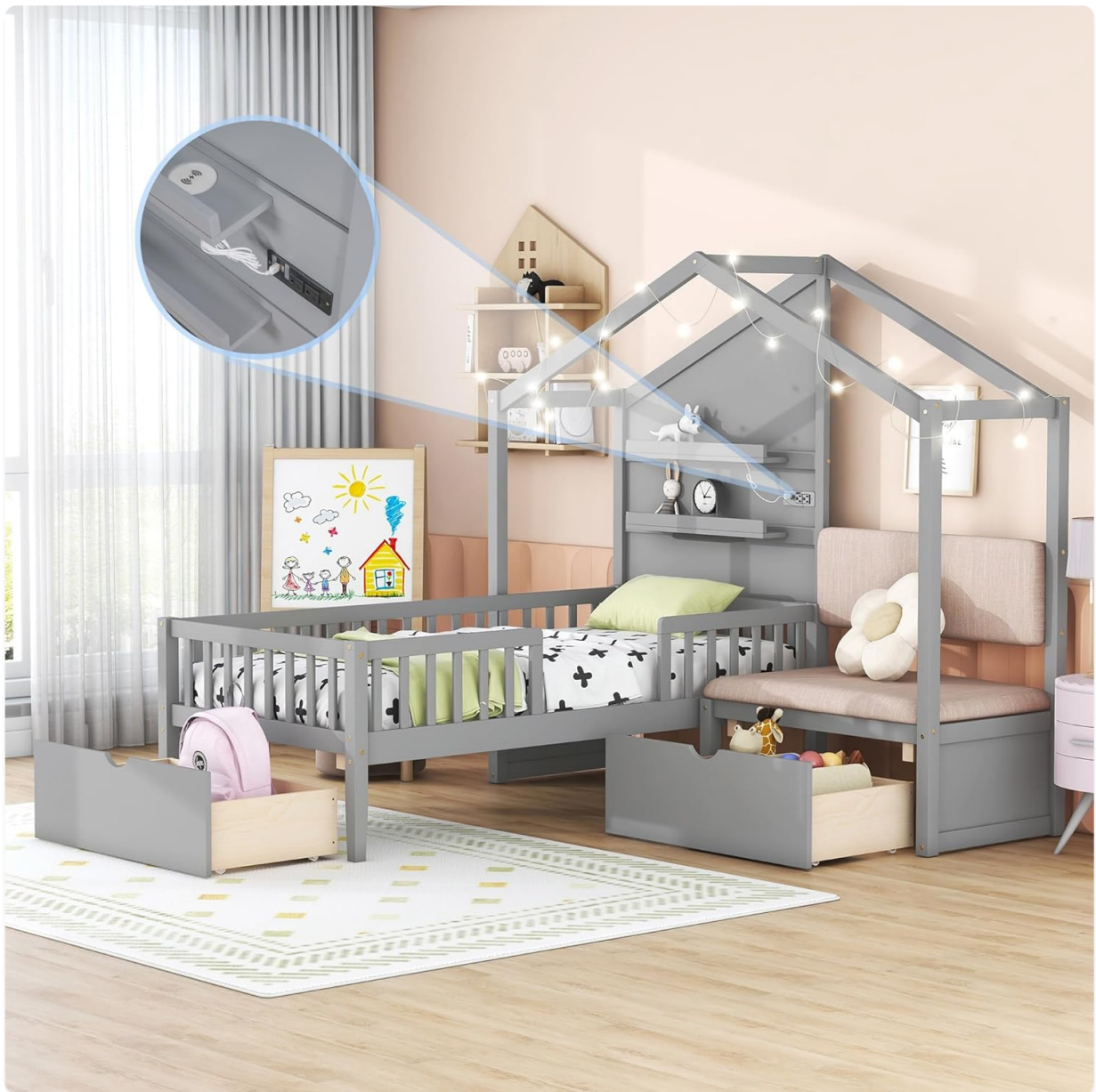
Image Description: A close-up view highlighting the integrated shelves and the charging station on the bed's back panel, showing a phone being charged wirelessly and a USB cable connected.