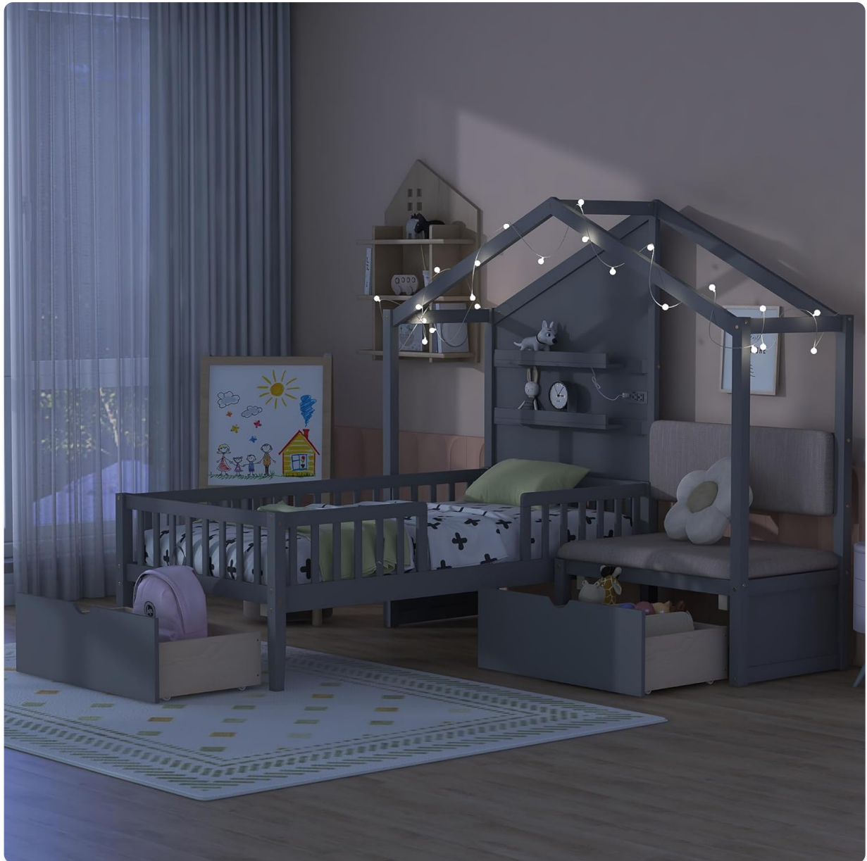
Image Description: A view of the bed frame at night, showcasing the soft glow of the integrated LED lights along the house-shaped roof, creating a cozy atmosphere.

The integrated LED light strip along the roof frame provides ambient lighting. To operate, locate the power switch, typically found near the charging station on the back panel. Toggle the switch to turn the lights ON or OFF. Some models may feature different lighting modes; refer to the specific light strip instructions if provided separately.