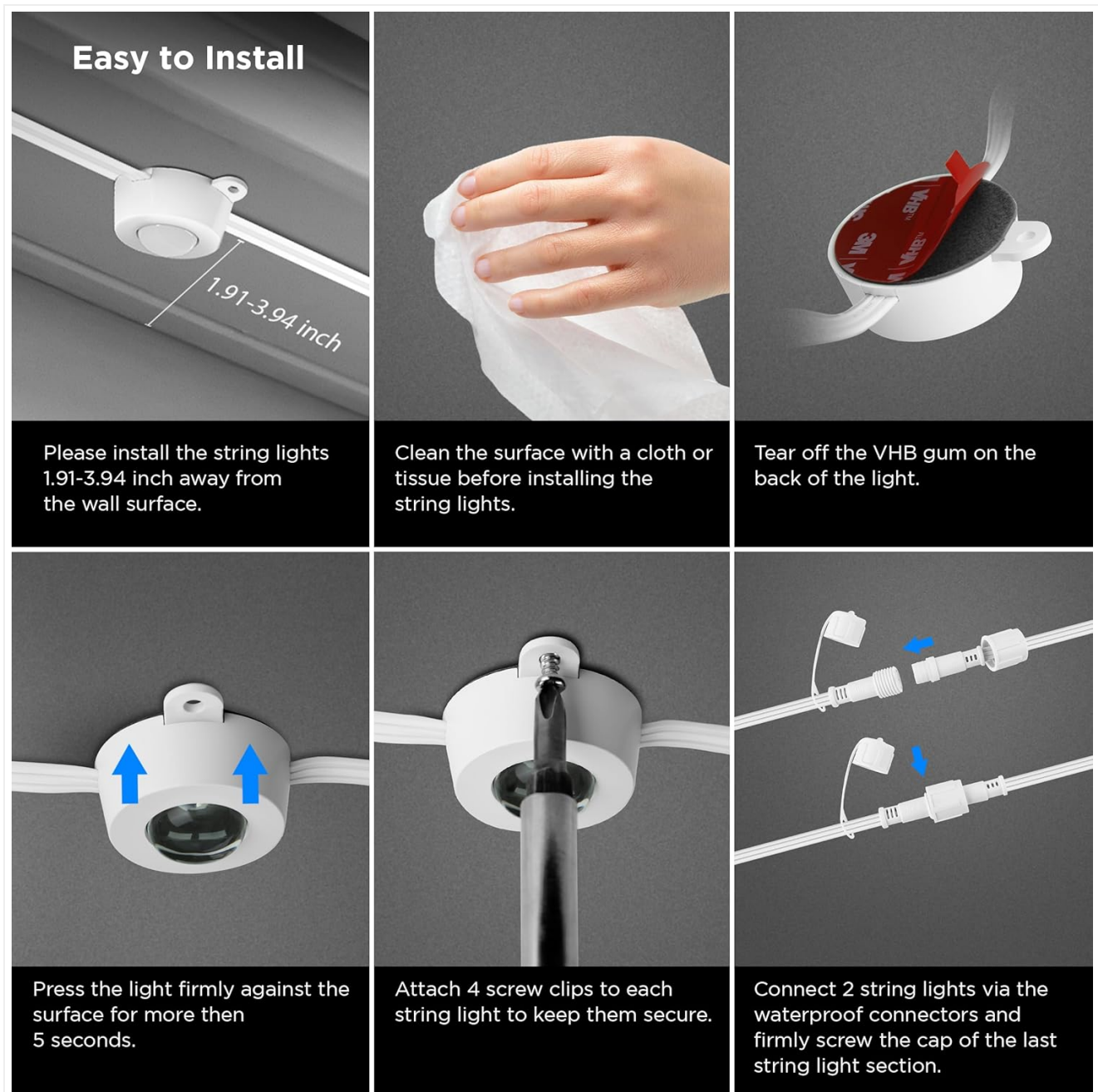
Image: Detailed installation steps showing surface cleaning, adhesive removal, firm pressing, and screw attachment.