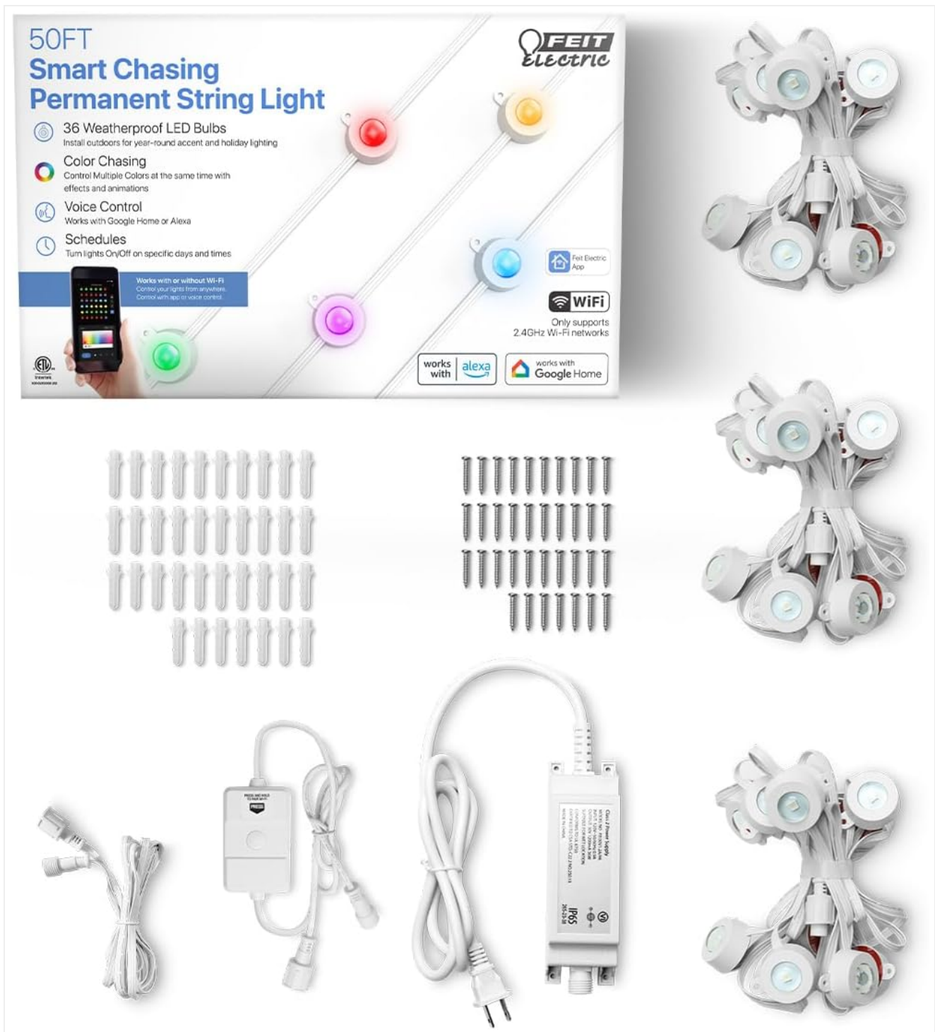
Image: Package contents including the 50FT string light, power adapter, controller, and mounting hardware.