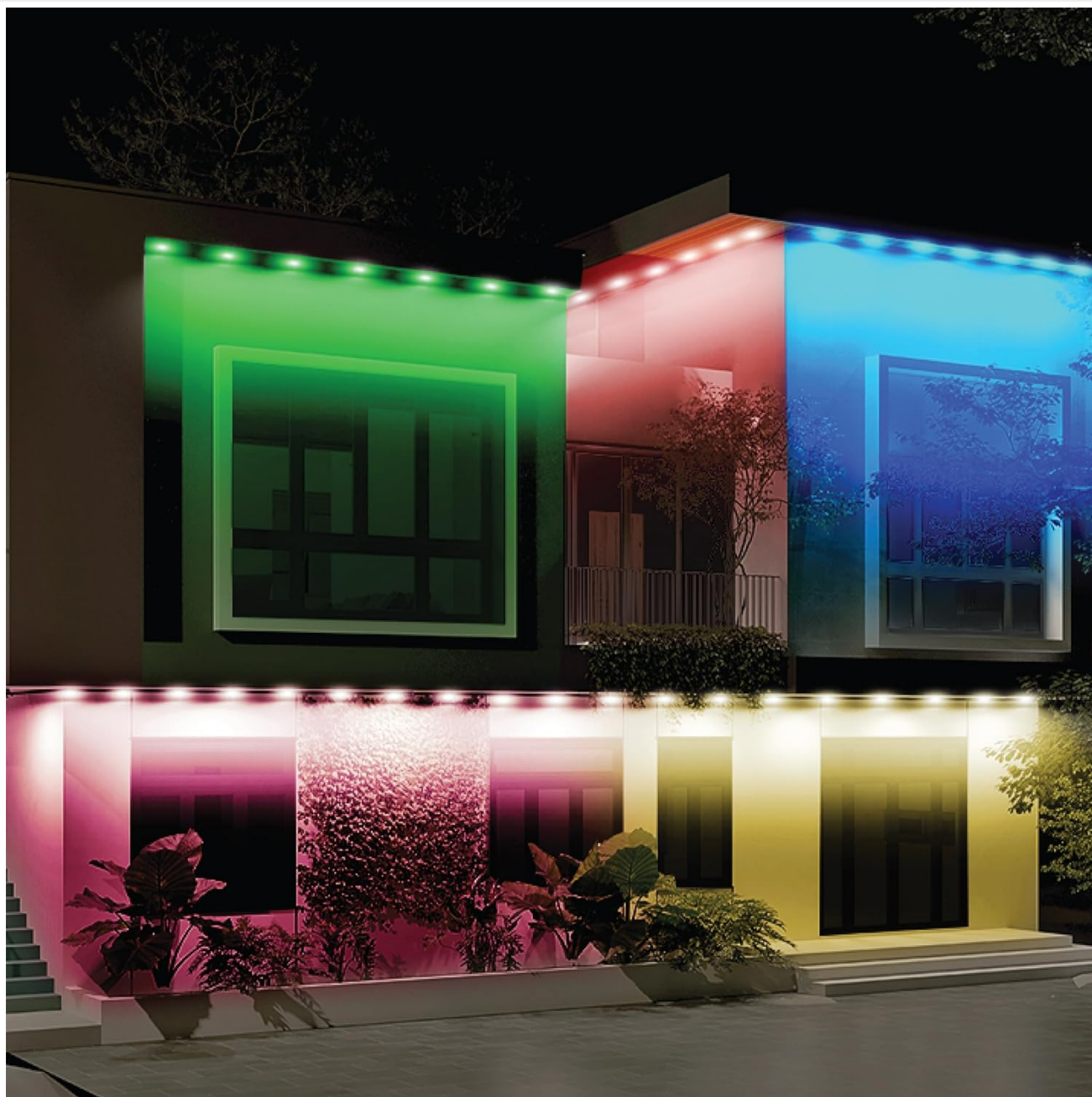
Image: A house facade lit with vibrant colors from the permanent outdoor lights, demonstrating their aesthetic appeal and year-round use.