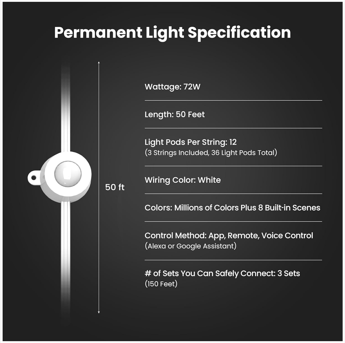
Image: A graphic displaying key specifications of the permanent light system.