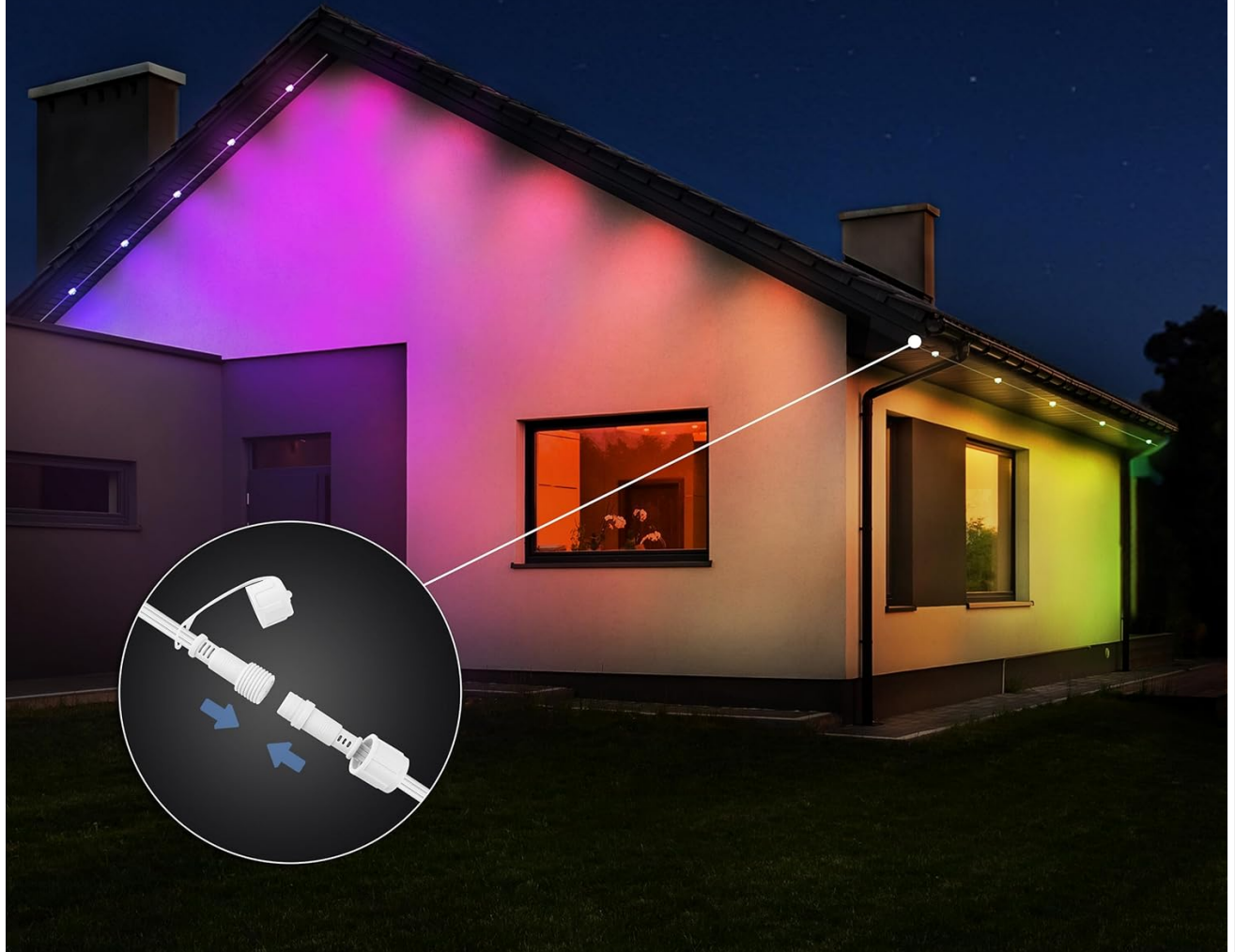
Image: Illustration demonstrating the connection of an extension light strand to the main unit.

Connect one 16 ft. extension for wider coverage.