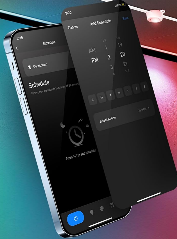
Image: The Feit Electric app showing options for scheduling and setting a countdown timer for the lights.