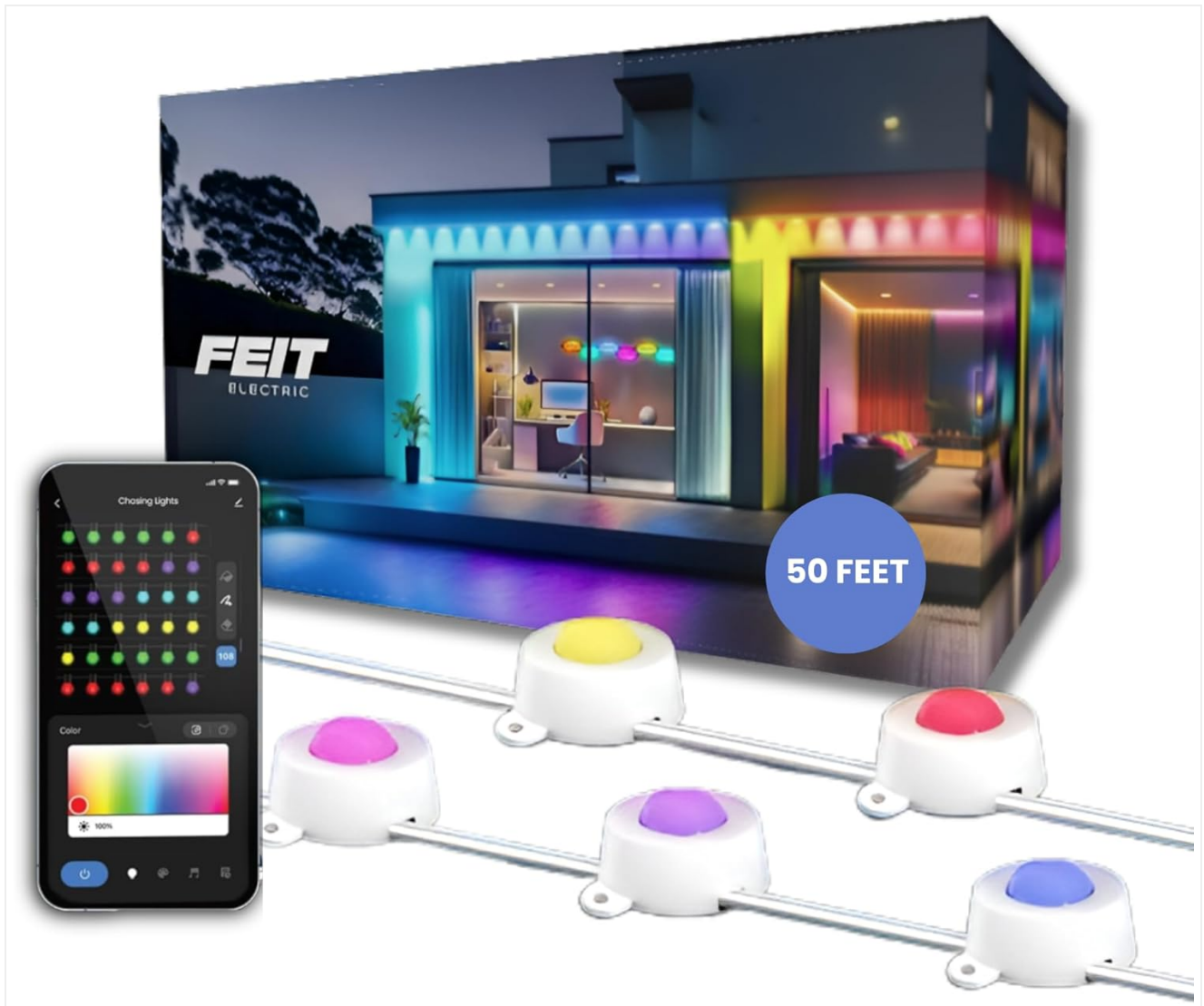
Image: The Feit Electric app interface showing color selection and light control options.