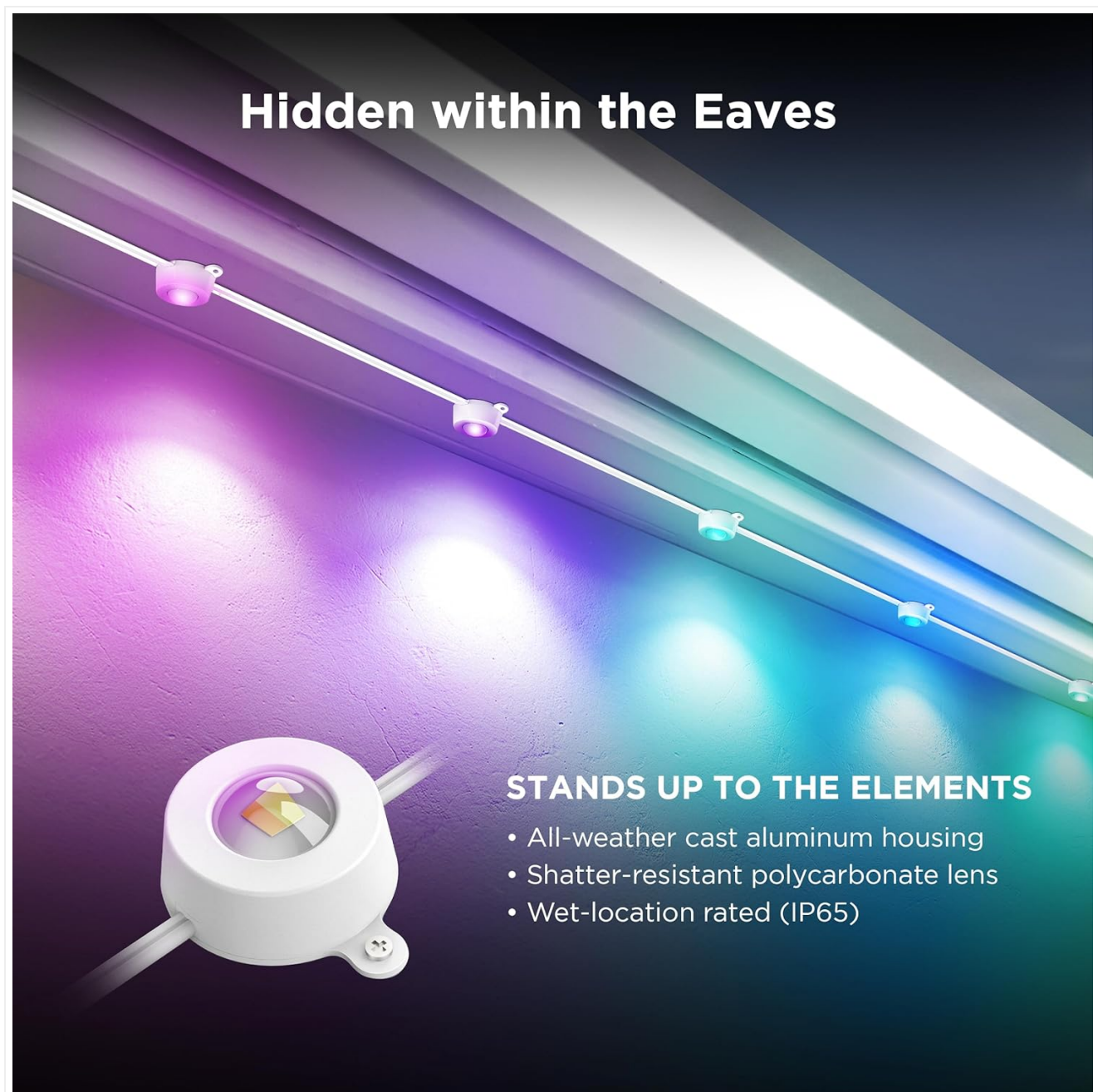
Image: Lights installed discreetly under the eaves of a house, showing the "Hidden within the Eaves" concept.