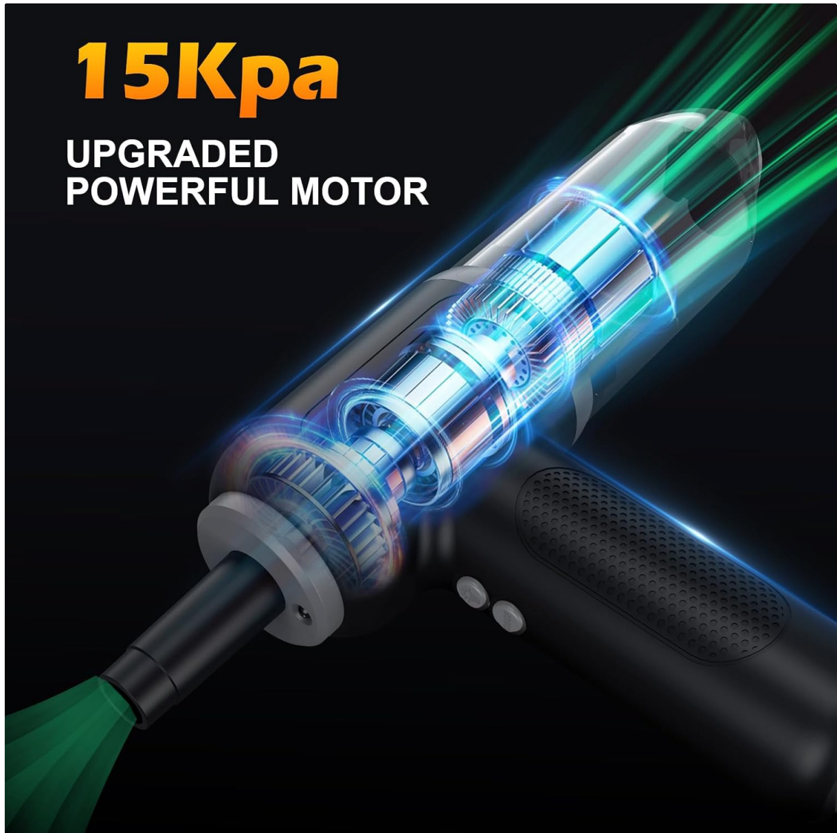
Figure 2: Device and Included Accessories