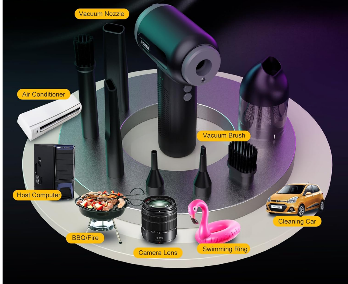
Figure 5: Interchangeable Nozzles for Diverse Applications