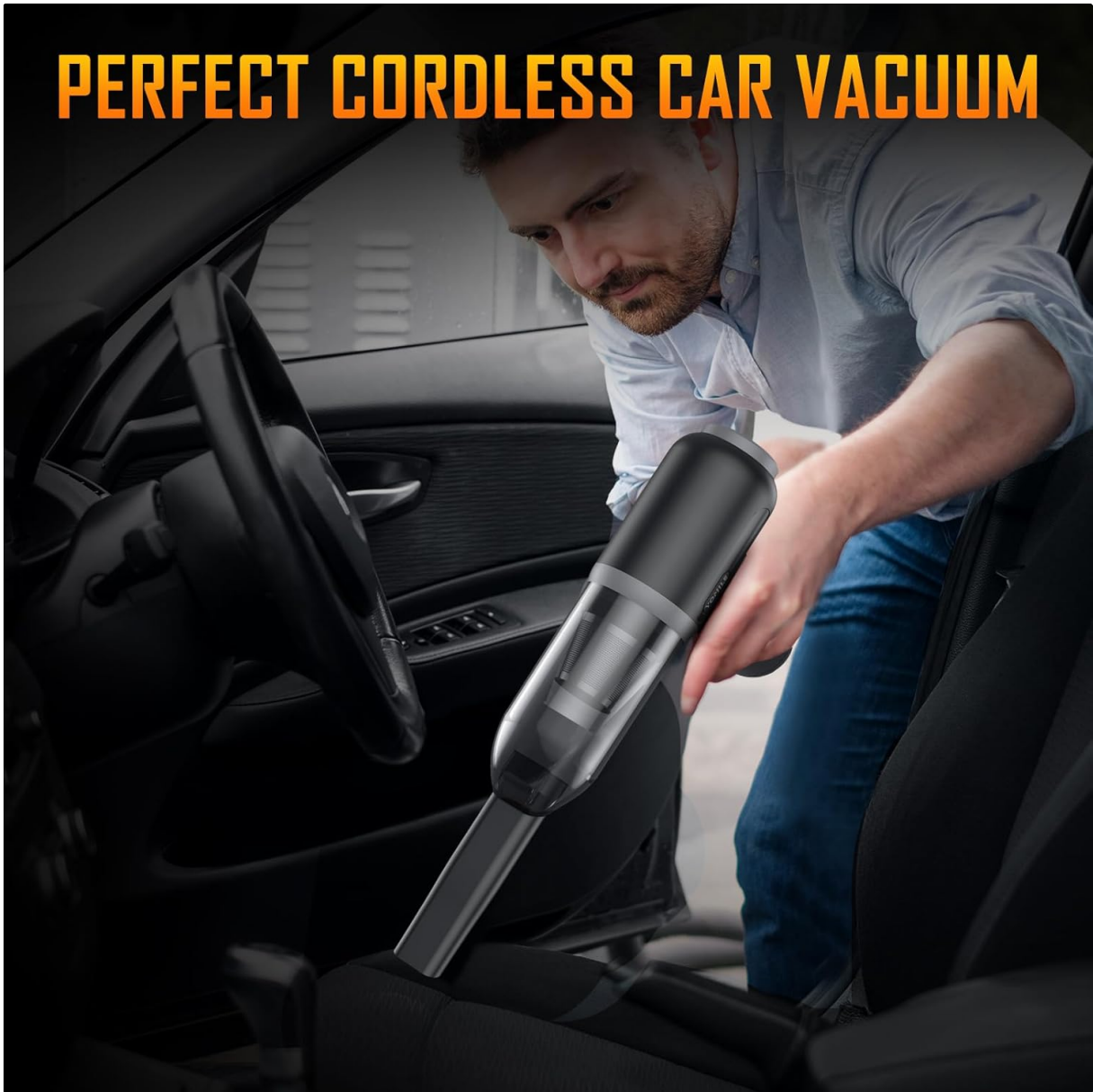
Figure 6: Using the Vacuum Function in a Car