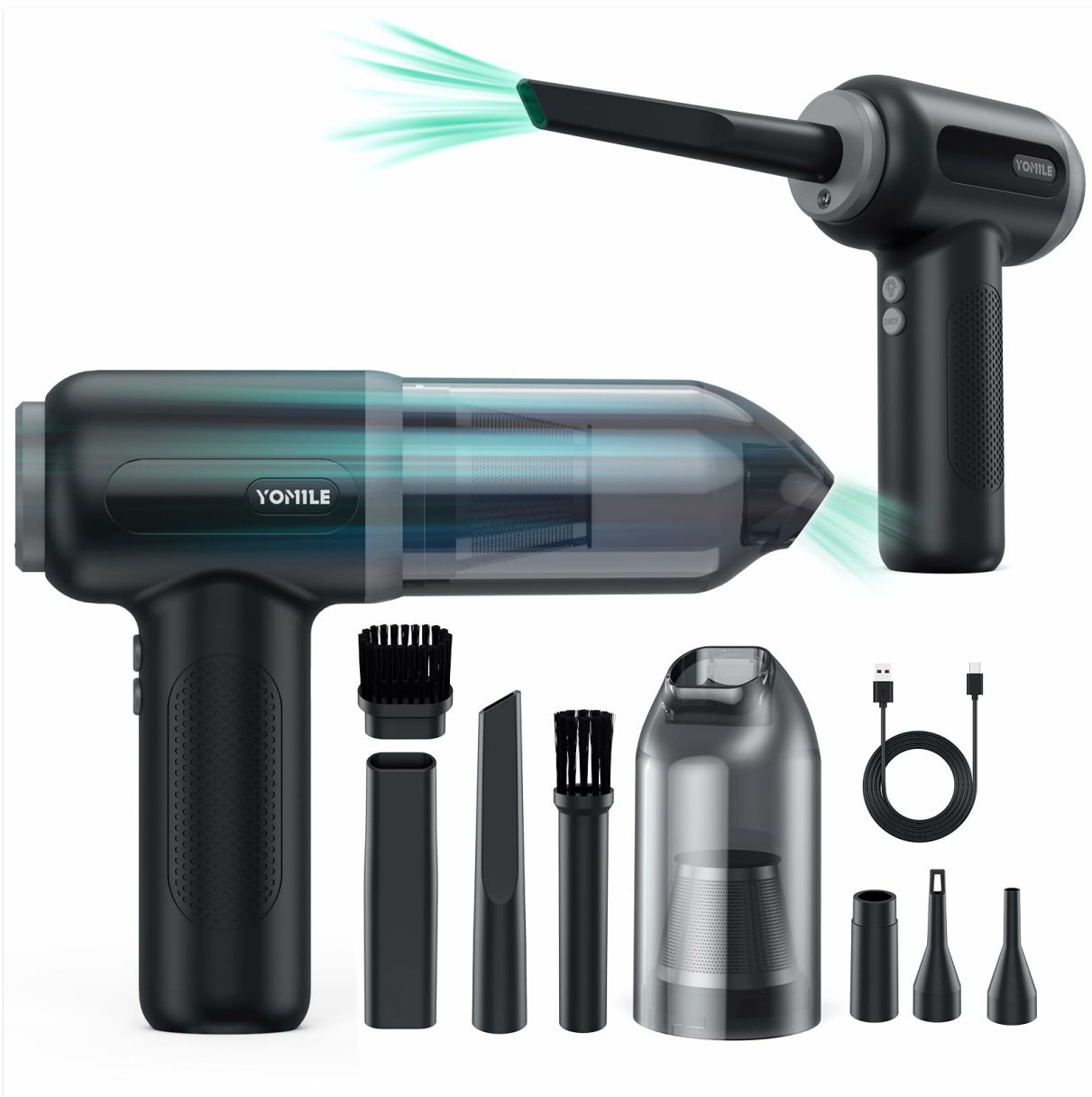
Figure 1: Yomile 3-in-1 Mini Vacuum Cleaner and Air Duster