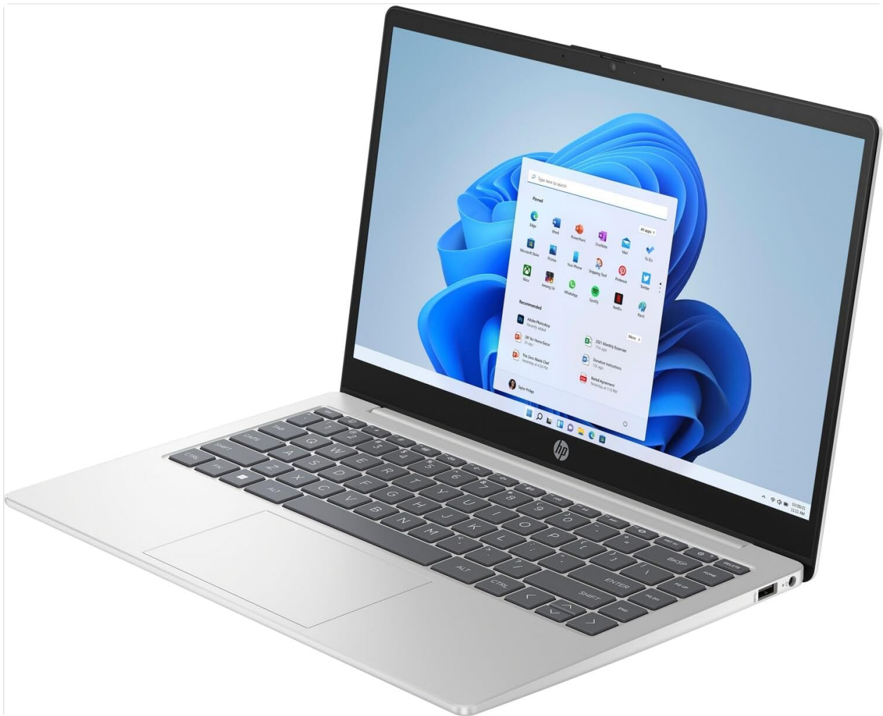
Image 1.1: The HP 14-inch 14-ep0145cl Laptop, showcasing its display and keyboard.