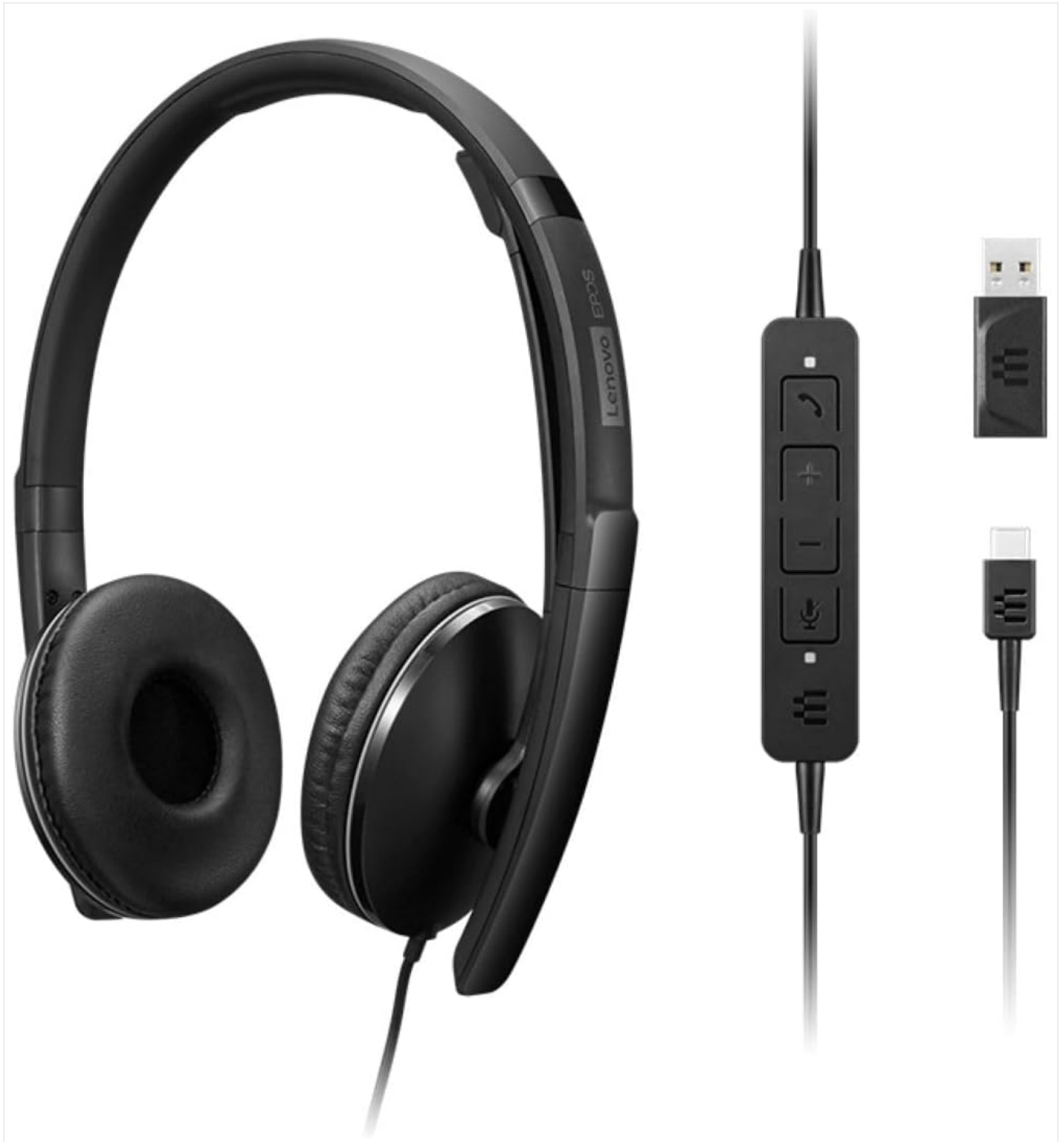
Image 2.1: The headset with its inline control unit, USB-C connector, and USB-A adapter.