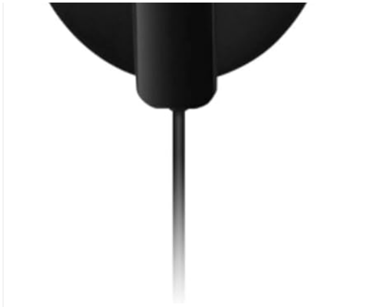
Image 5.1: Side view of the headset with the microphone boom extended for use.