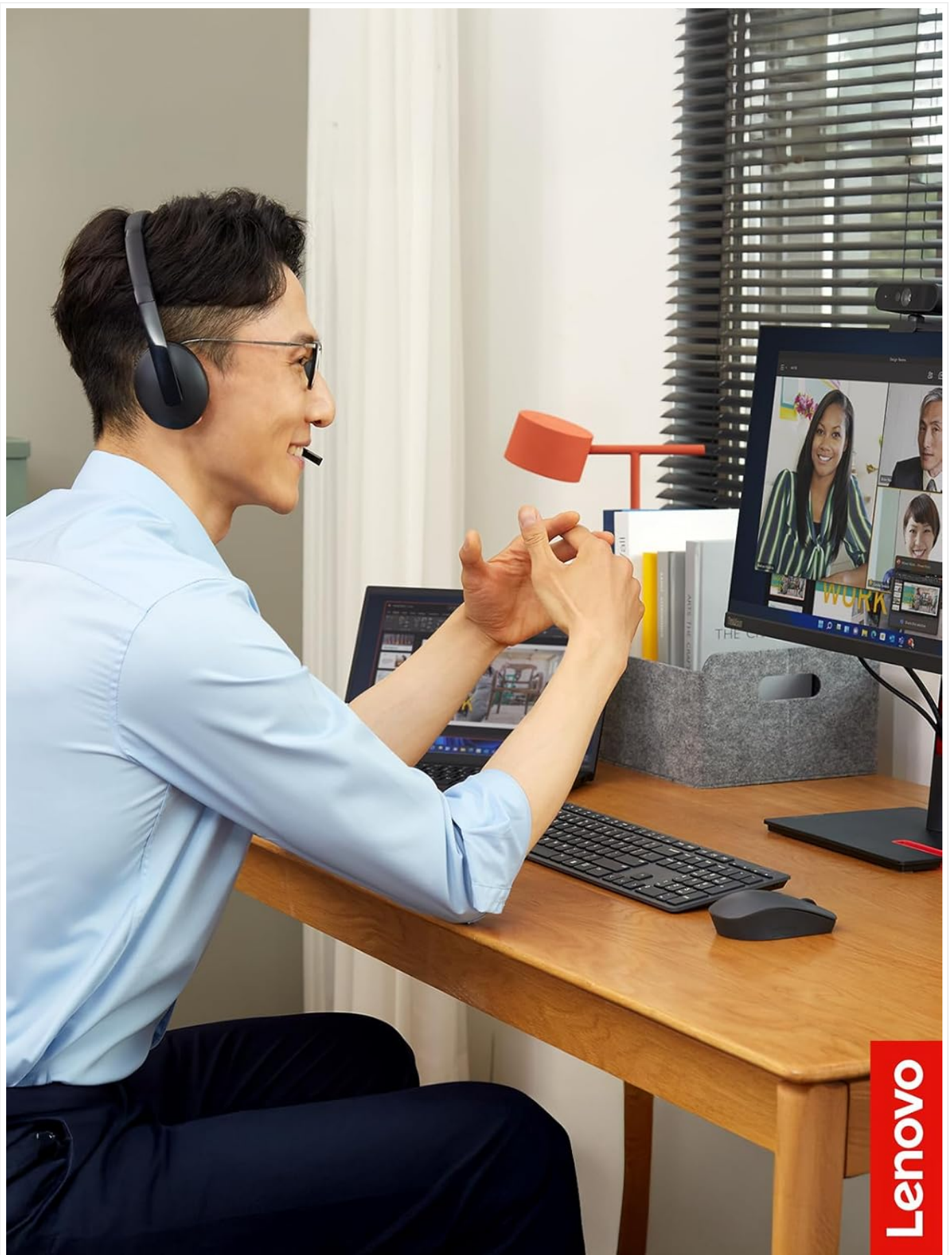
Image 5.2: A user engaged in a video conference call while wearing the headset, demonstrating its use in a professional setting.