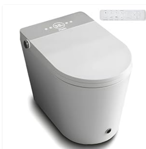
Image 1.2: Benefits of the Nashi Ovia SE Smart Toilet, highlighting improved daily hygiene, skin care, enhanced autonomy for children and the elderly, reduced toilet paper usage, and relief from hemorrhoid discomfort.