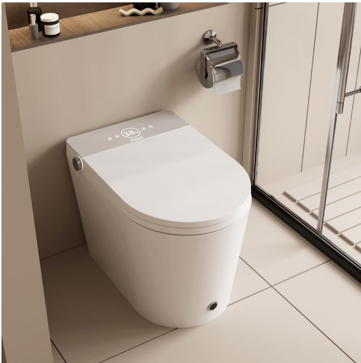
Image 1.1: The Nashi Ovia SE Smart Toilet in a bathroom setting, showcasing its sleek design.