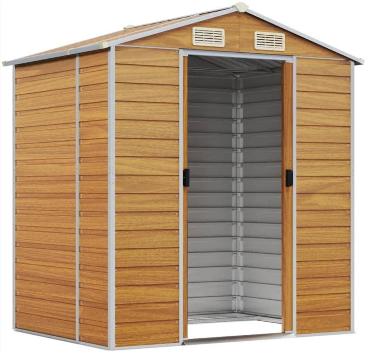
Figure 2: The shed with its door open, demonstrating the ample storage capacity. The interior is visible, highlighting the potential for organizing various garden items.