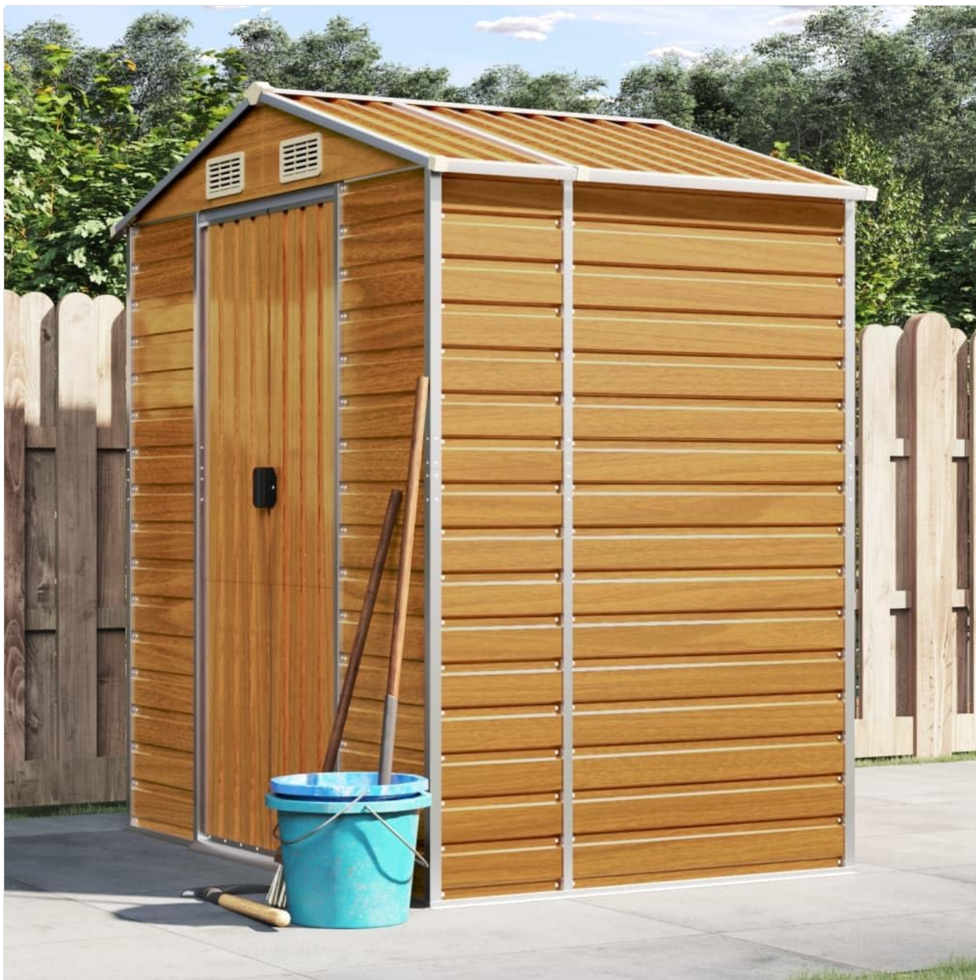
Figure 3: The garden shed situated in an outdoor environment, showcasing its practical use for storing garden tools and equipment. Note the ventilation vents near the roofline.