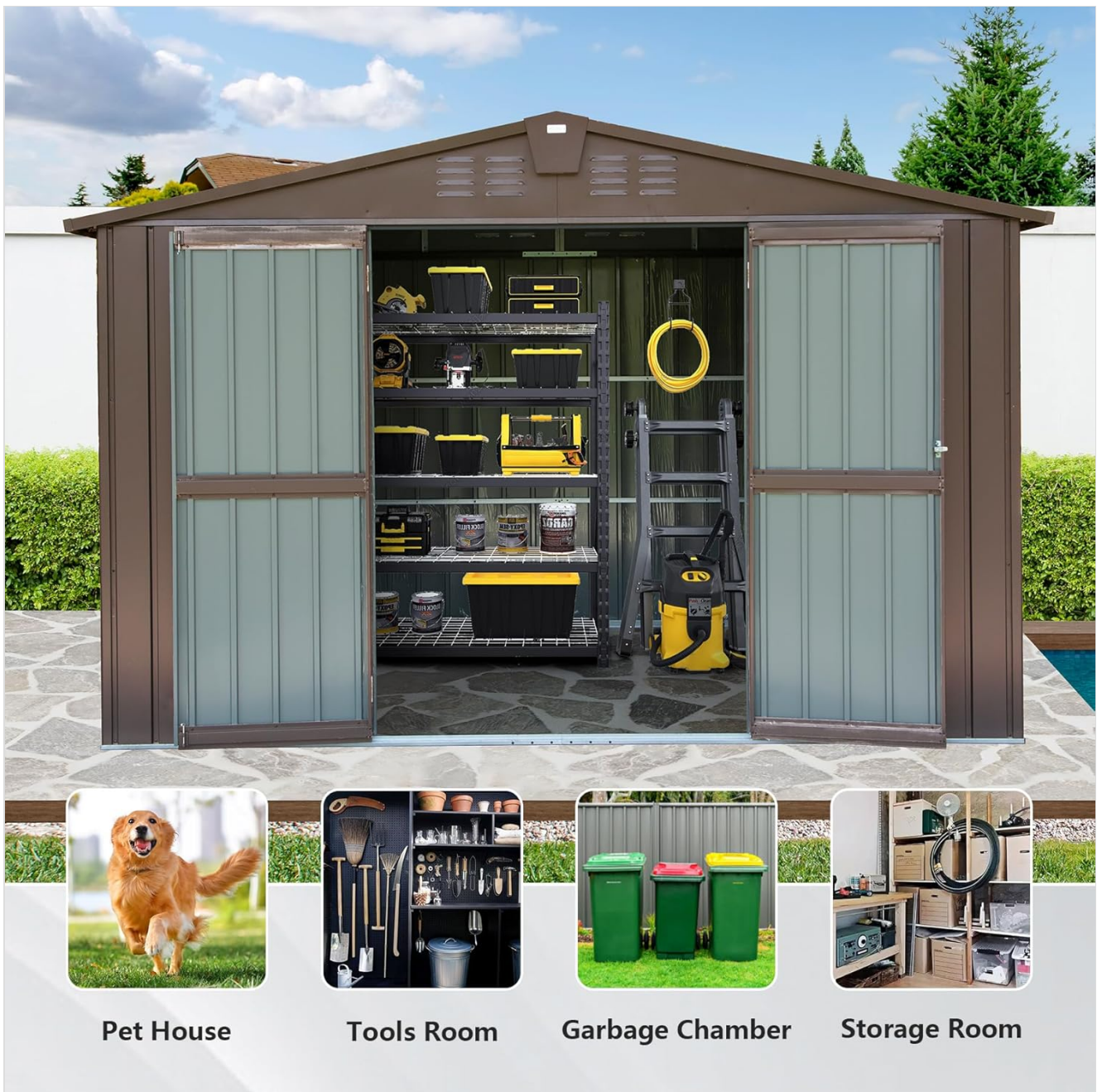
Image: Examples of how the shed can be utilized, including as a pet house, a tools room, a garbage chamber, or a general storage room.