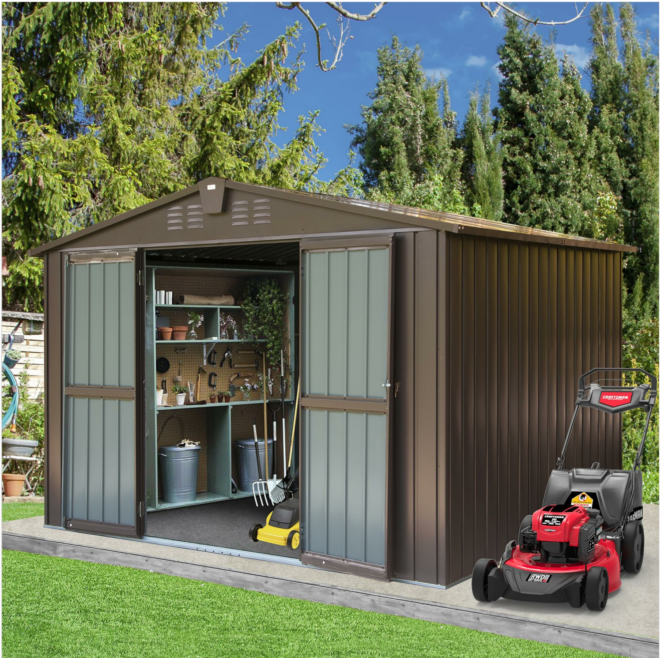
Image: The assembled Domi Outdoor Storage Shed 10'x8' highlighting the stable ground base and overall structure.