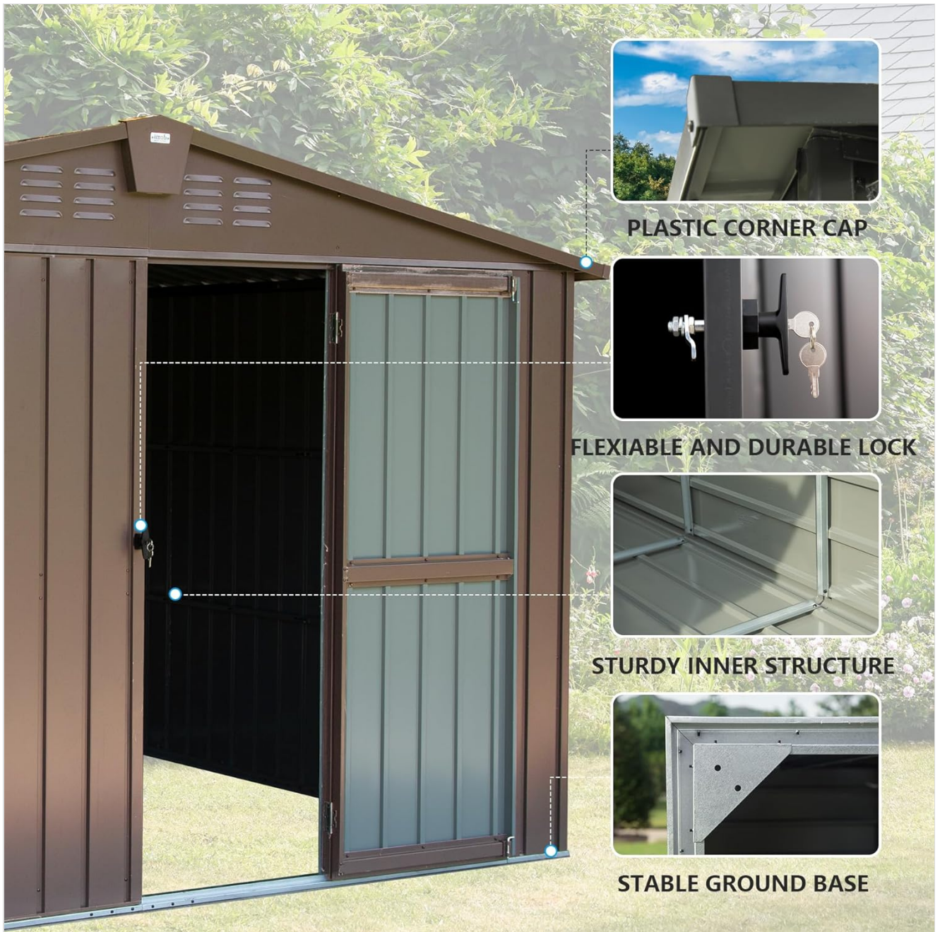
Image: Close-up details of the shed's construction, including the plastic corner cap, flexible and durable lock, sturdy inner structure, and stable ground base.

3. Roof Frame Assembly: Construct the roof frame and attach it to the top of the wall panels.