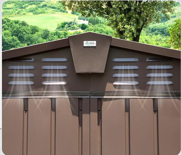
Image: The shed's sloping roof design, demonstrating water runoff, and integrated air vents for proper ventilation.

5. Door Assembly and Installation: Assemble the sliding doors and install them onto the designated tracks. Ensure smooth operation.