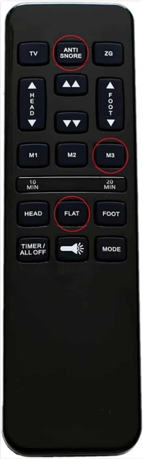
Image: A detailed view of the HJH55 remote control, highlighting key buttons such as "ANTI SNORE", "M3" (memory preset), and "FLAT" with red circles.

The HJH55 Remote Control provides intuitive control over your adjustable bed base. Familiarize yourself with the button functions: