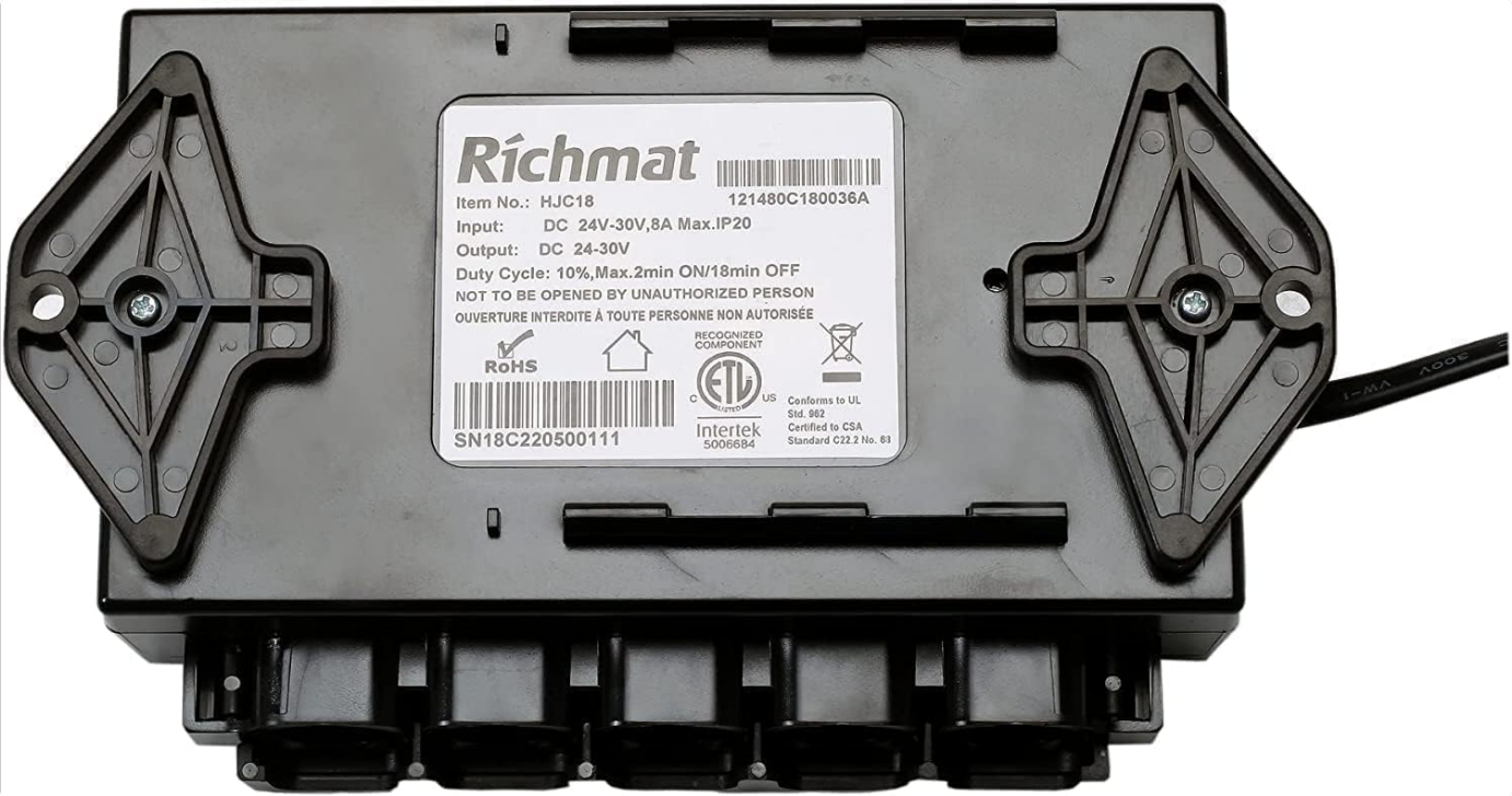
Image: The underside of the HJC18 control box, displaying the Richmat product label with detailed specifications including item number, input/output voltage, current, duty cycle, and certifications.