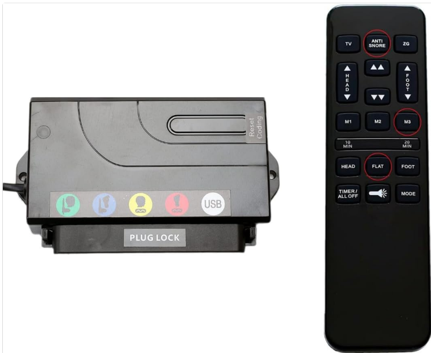
Image: The Richmat HJH55 remote control and HJC18 control box, shown together as a complete package.