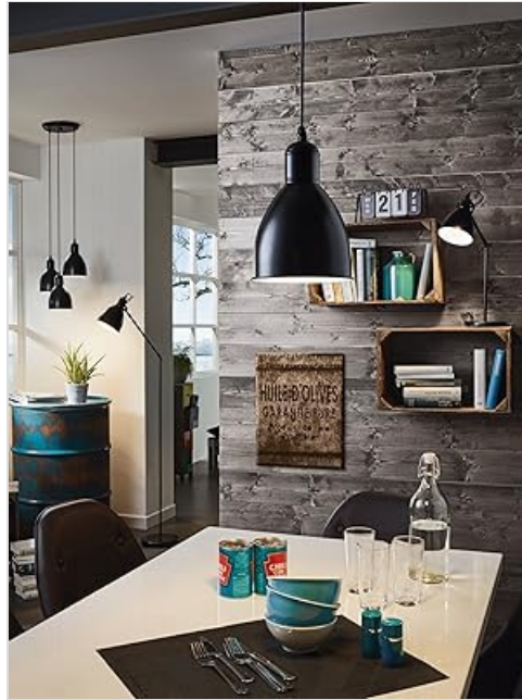
Image 2: The EGLO Priddy Pendant installed in a dining room, demonstrating its adjustable hanging length.

The pendant features an adjustable hanging length via its black cable. To adjust, loosen the cable grip at the canopy, pull the cable to the desired length, and then tighten the grip securely. Ensure the fixture hangs level.