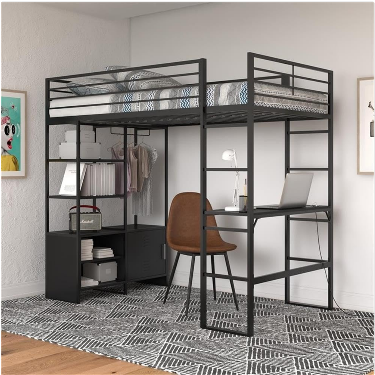
Image 4.1: The loft bed in a furnished room, showcasing the integrated desk with a laptop and lamp, and the storage shelves with books and decorative items. A chair is positioned at the desk.