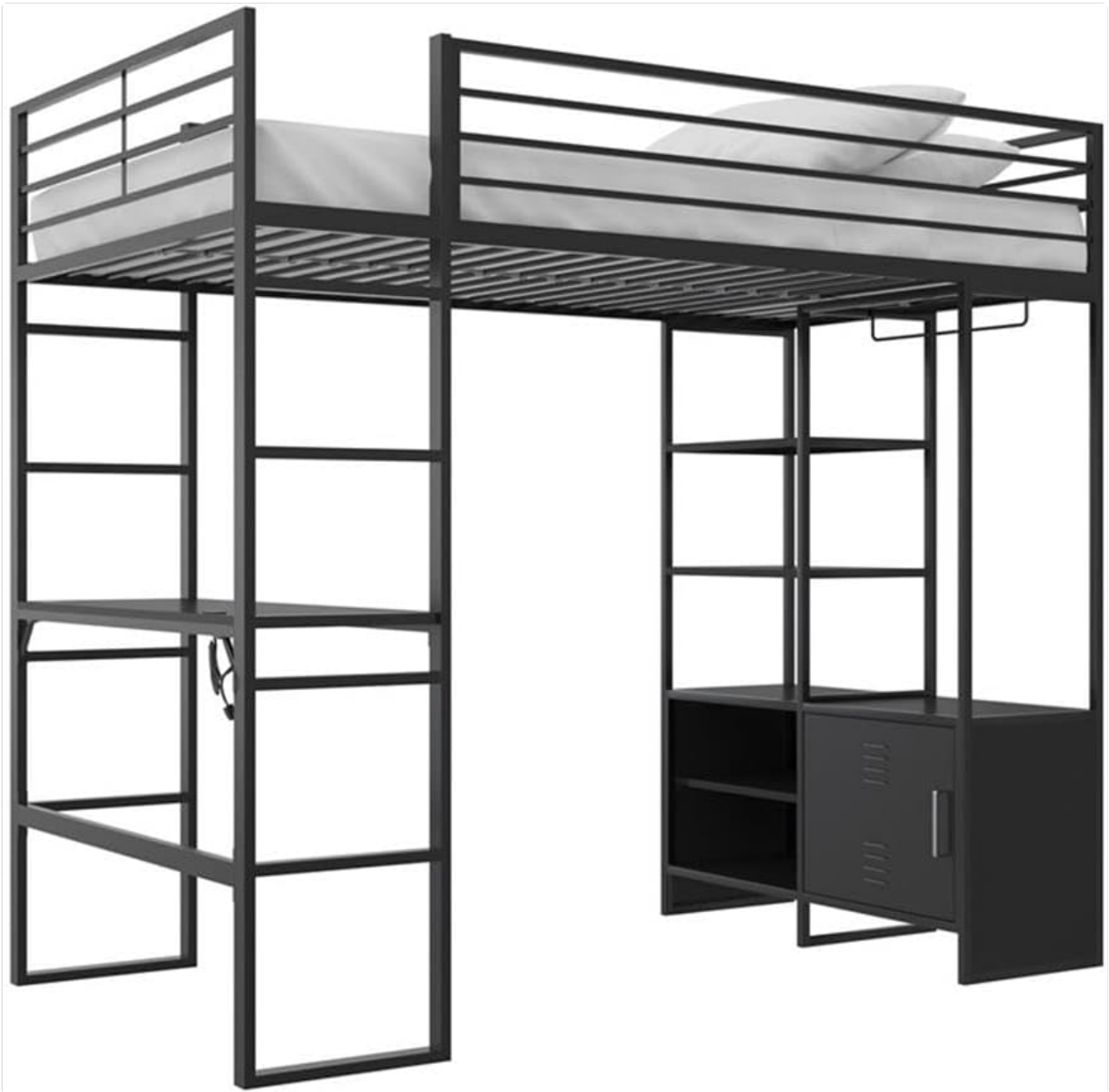
Image 1.1: Overview of the Pemberly Row Modern Metal Storage Twin Loft Bed with Desk. This image displays the complete black metal loft bed unit, featuring the elevated twin bed frame, an integrated desk area on the left, and a storage unit with shelves and a locker on the right.