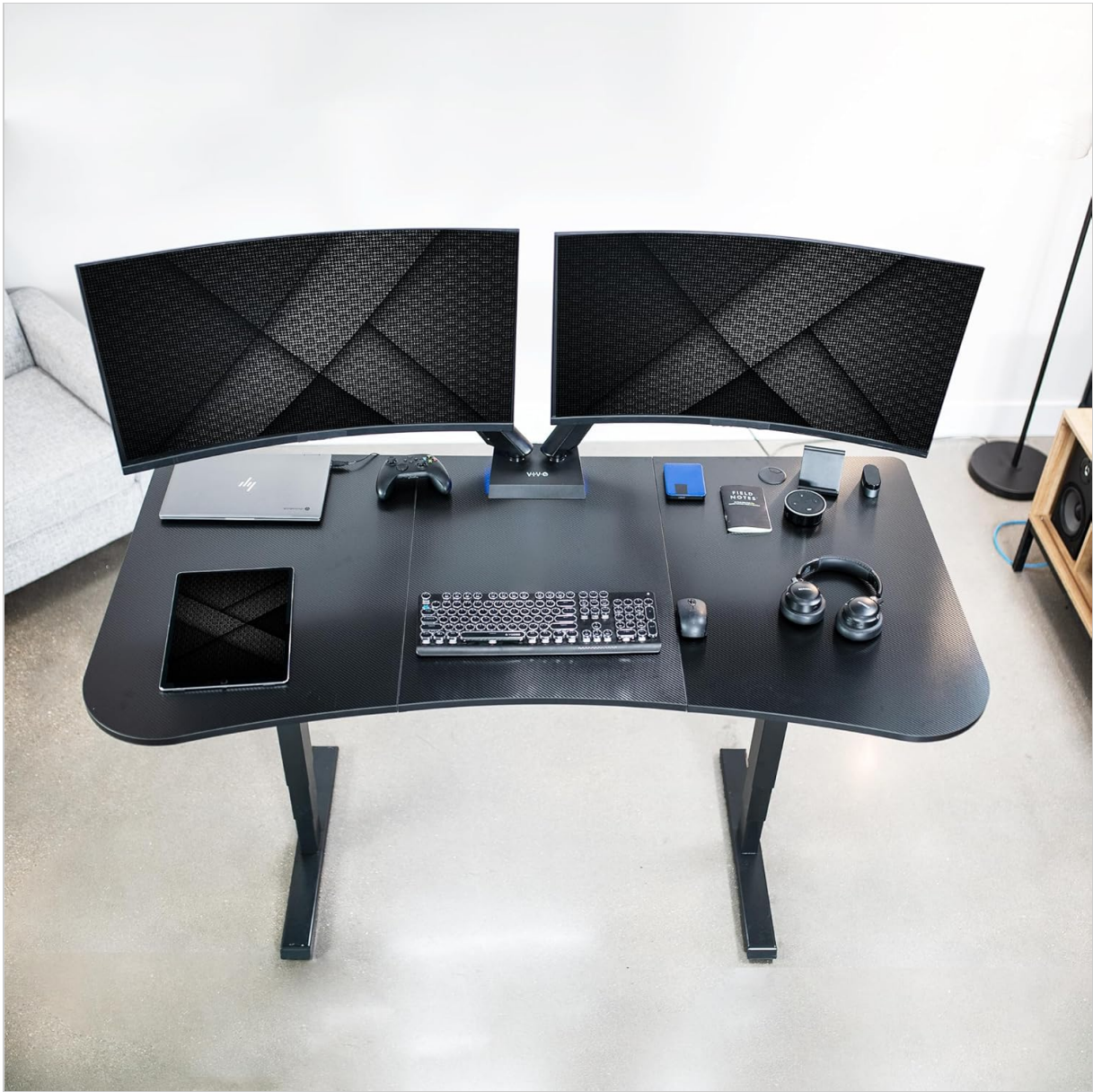
Figure 3: The VIVO DESK-TOP1R Black Carbon Fiber Table Top configured with dual monitors, keyboard, mouse, and other computer peripherals, demonstrating its spacious work area.