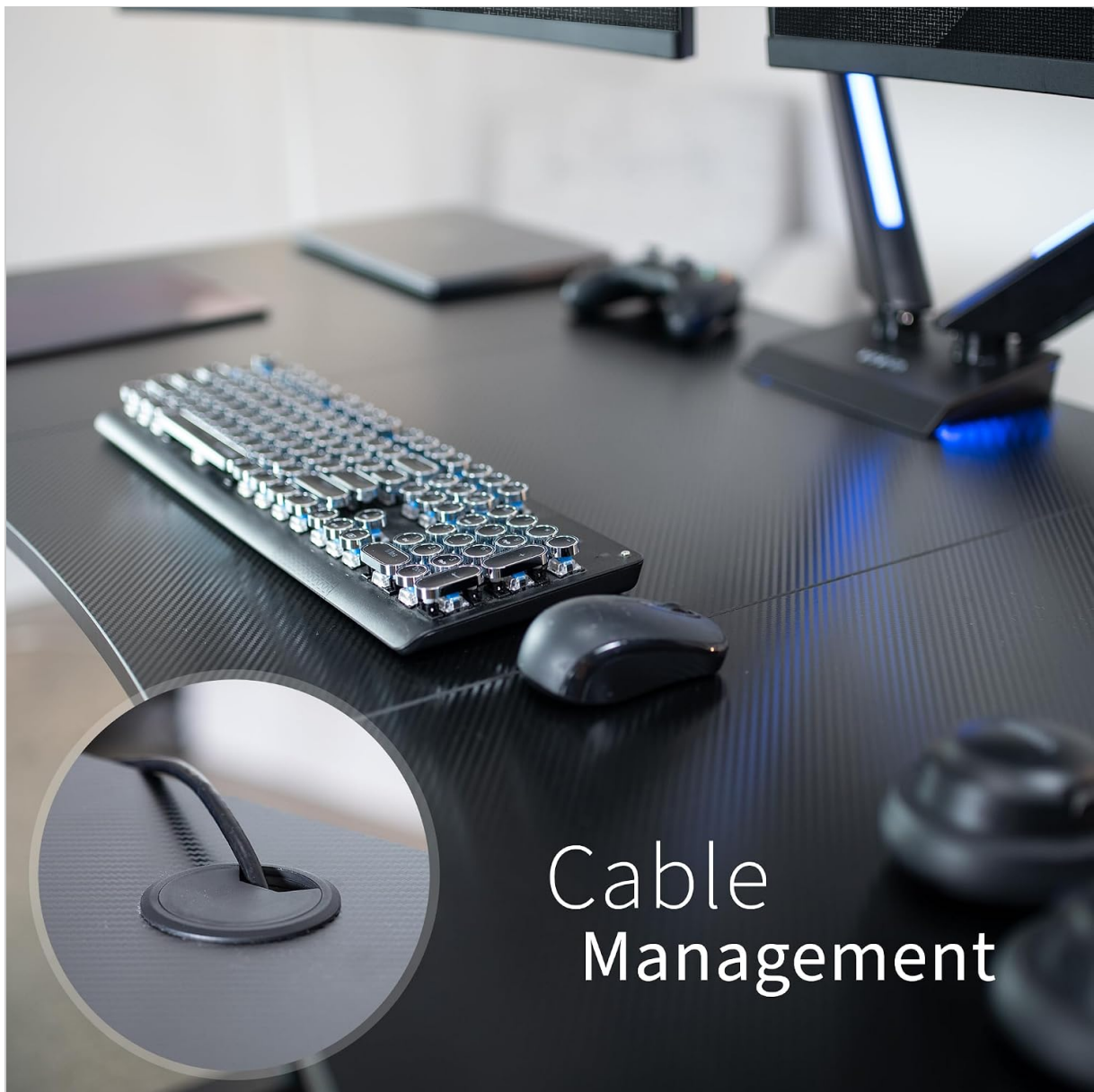
Figure 4: A close-up view of the integrated cable management grommet on the VIVO DESK-TOP1R table top, designed to keep cables organized.