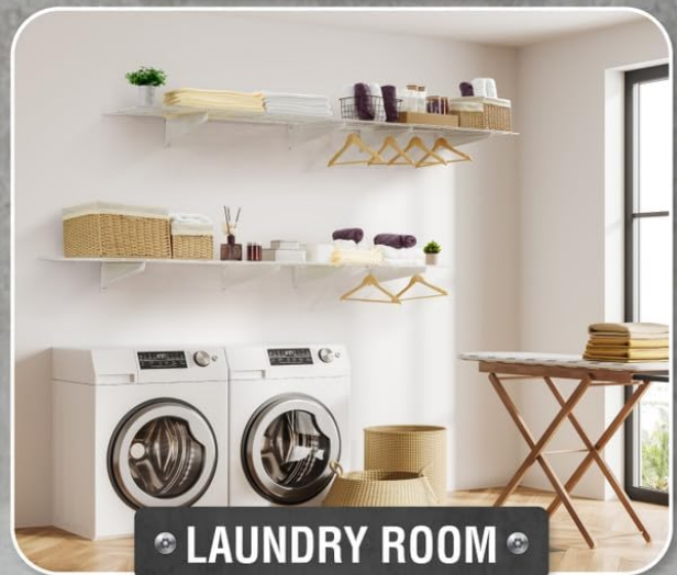
Figure 5: Examples of versatile installation options.