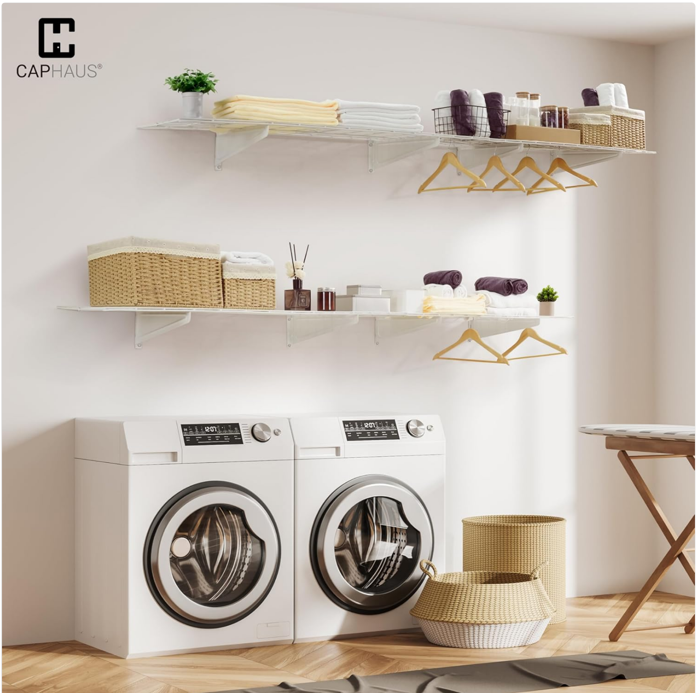
Figure 7: Shelves in a laundry room setting.