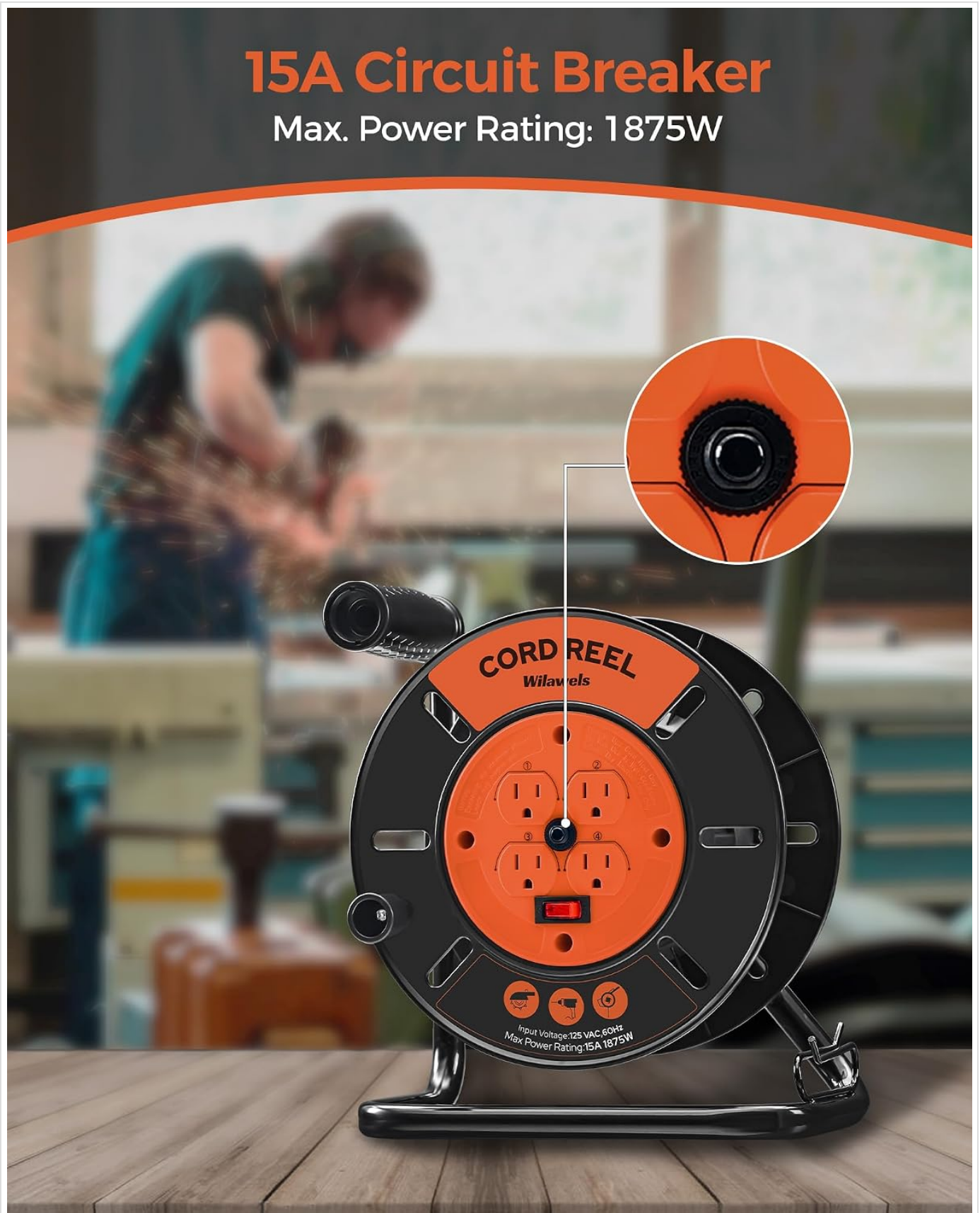
Image: The 15A circuit breaker, designed to prevent overloads and ensure safety. Max Power Rating: 1875W.