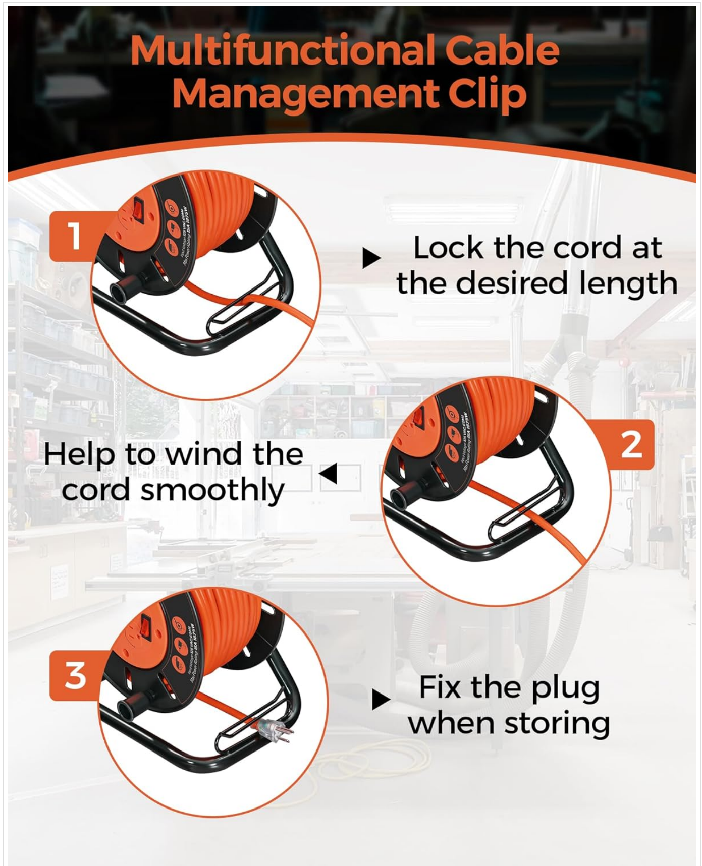
Image: A visual guide showing how to use the multifunctional cable management clip: 1) Lock the cord at the desired length, 2) Help to wind the cord smoothly, and 3) Fix the plug when storing.