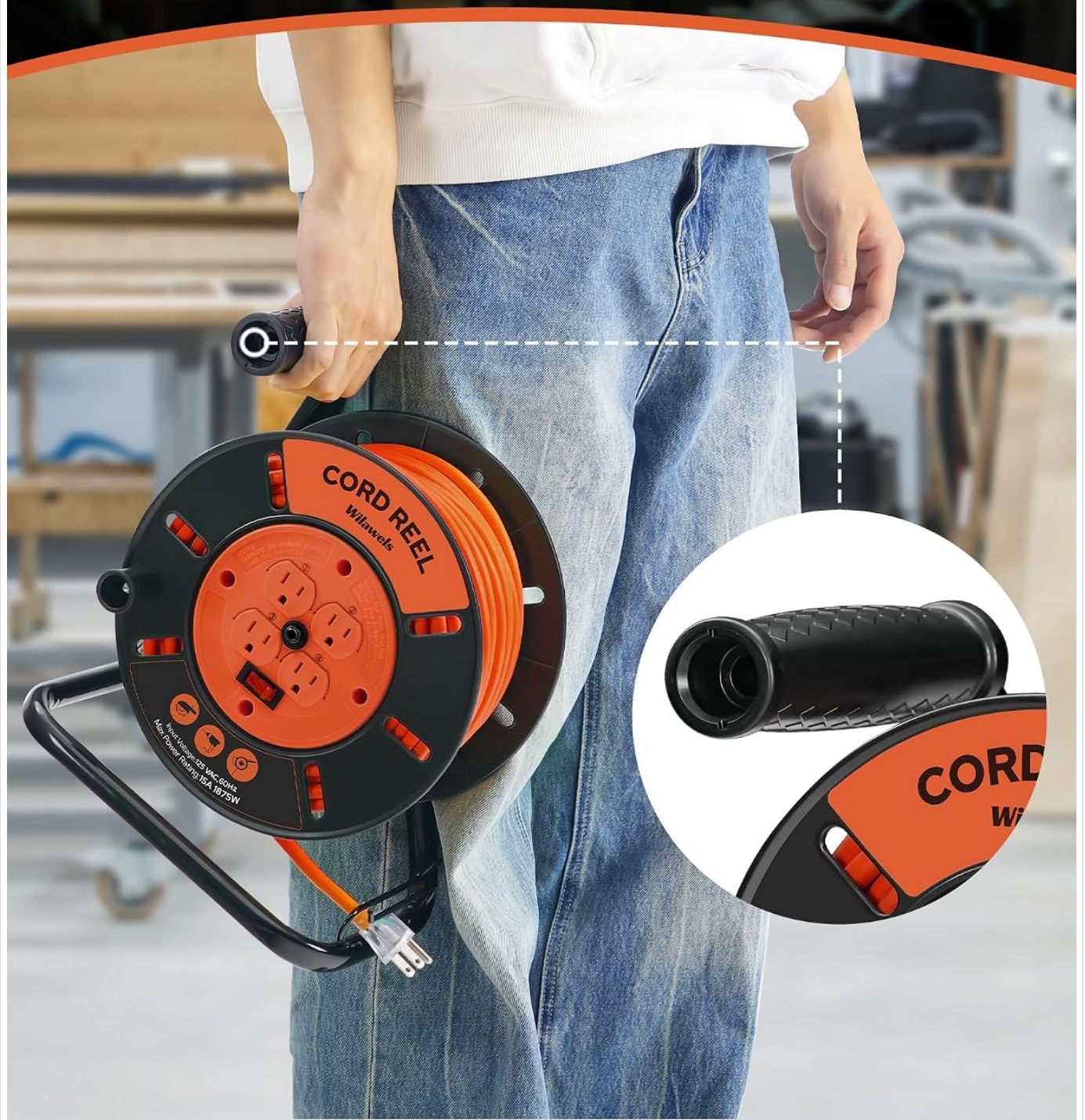
Image: A person demonstrating the smooth rewinding process of the cord reel, highlighting the ergonomic handle and round knob designed for easy retraction.

A handle and a round knob ensure smooth retraction.