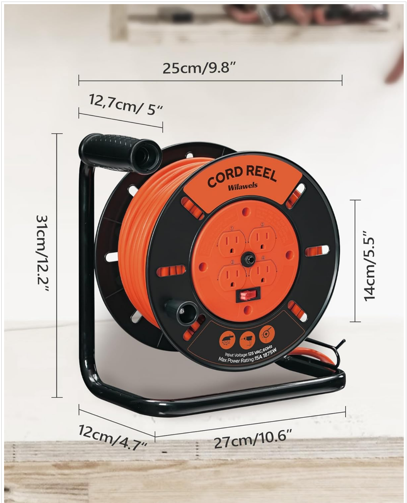
Image: Dimensional drawing of the cord reel, indicating its length, width, and height in both centimeters and inches.