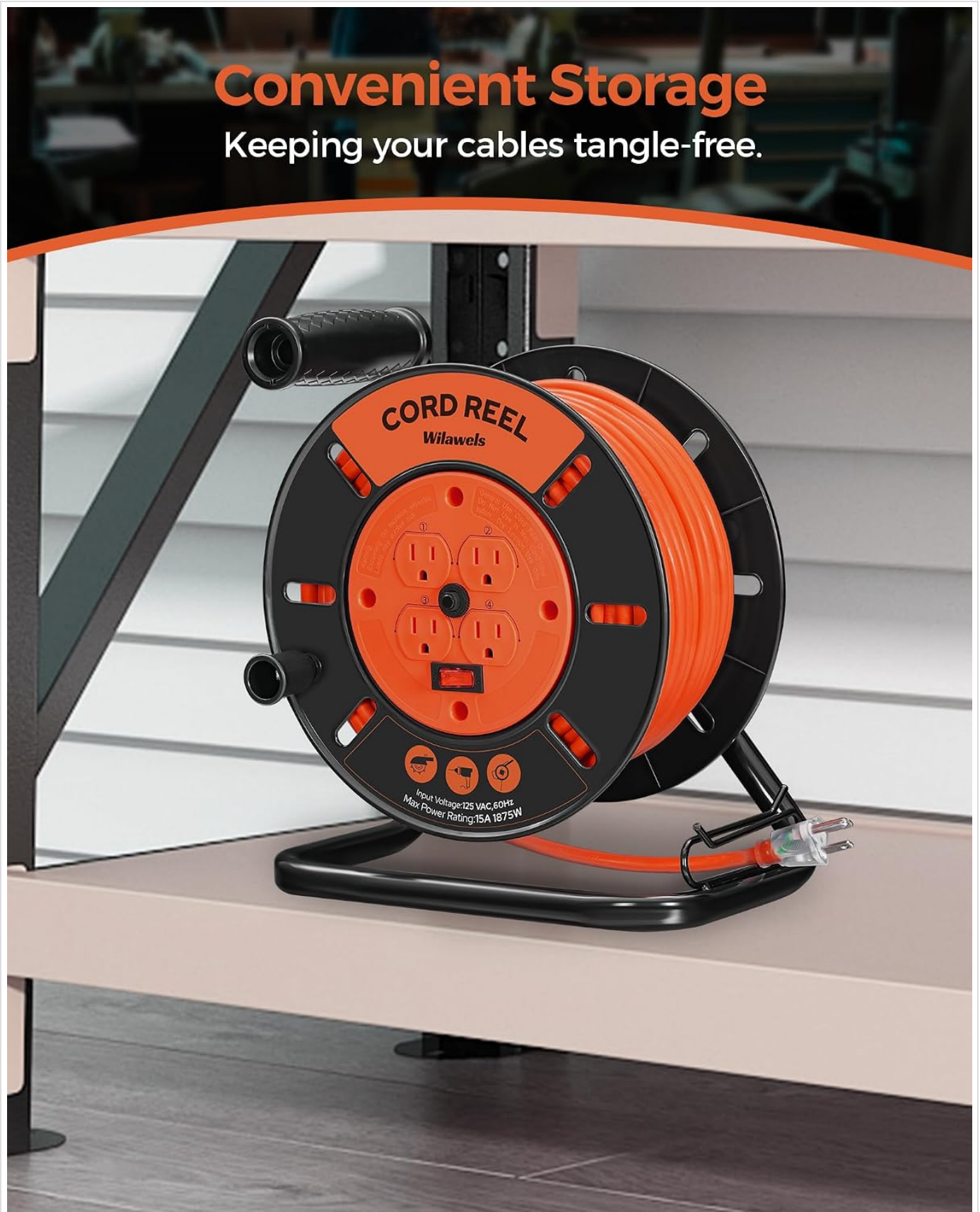
Image: The cord reel stored conveniently on a shelf, illustrating how its design helps keep cables tangle-free and organized.