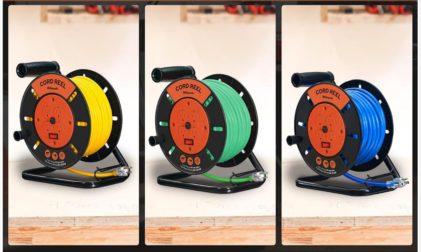
Image: Visual representation of the cord reel's capacity and current limits, showing compatible sizes for 80ft of 12/3 AWG, 100ft of 14/3 AWG, and 100ft of 16/3 AWG cords.

80FT-12/3AWG 100FT-14/3AWG 100FT-16/3AWG