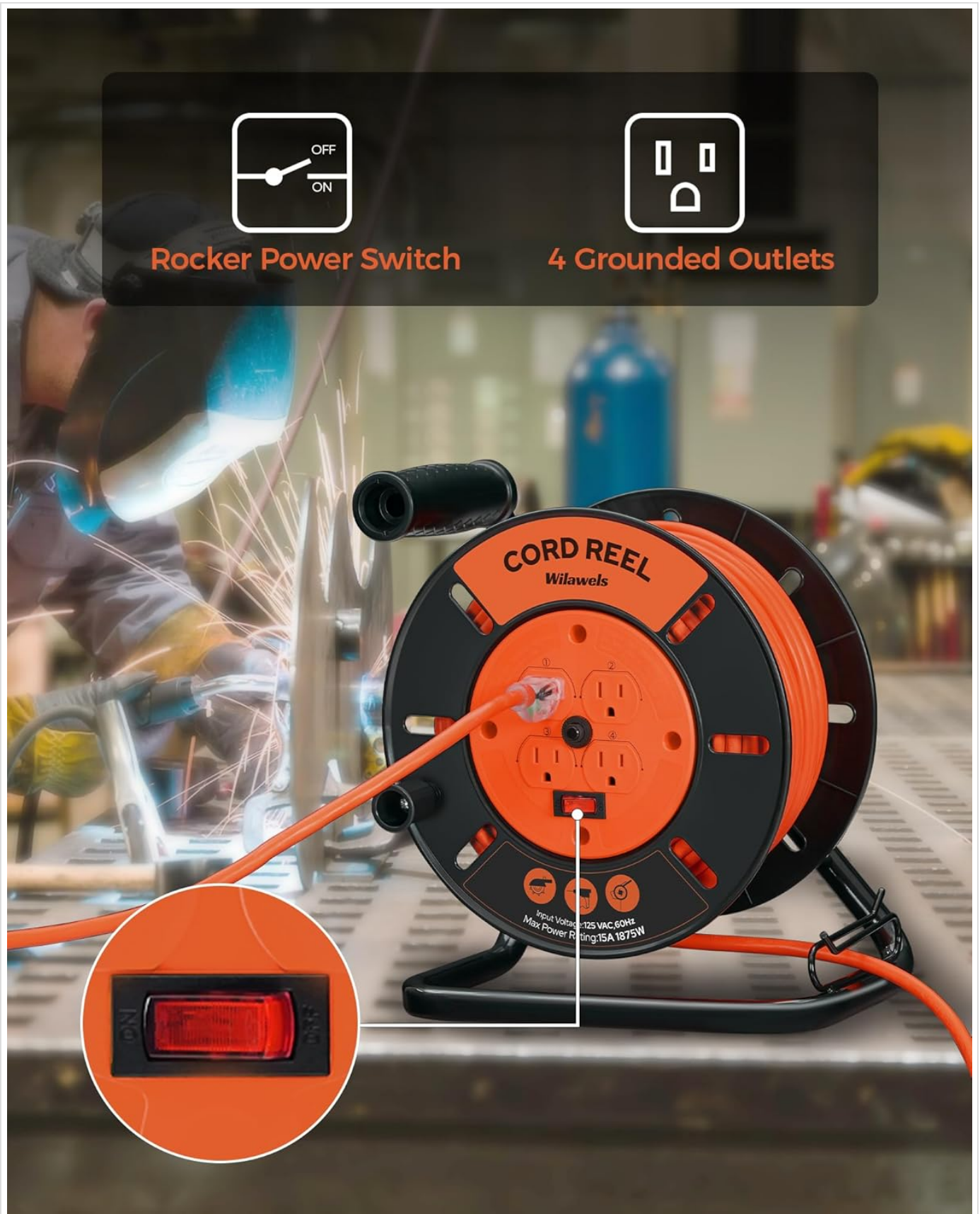
Image: The cord reel in an active workshop setting, demonstrating the rocker power switch in the 'ON' position and a device connected to one of the four grounded outlets.