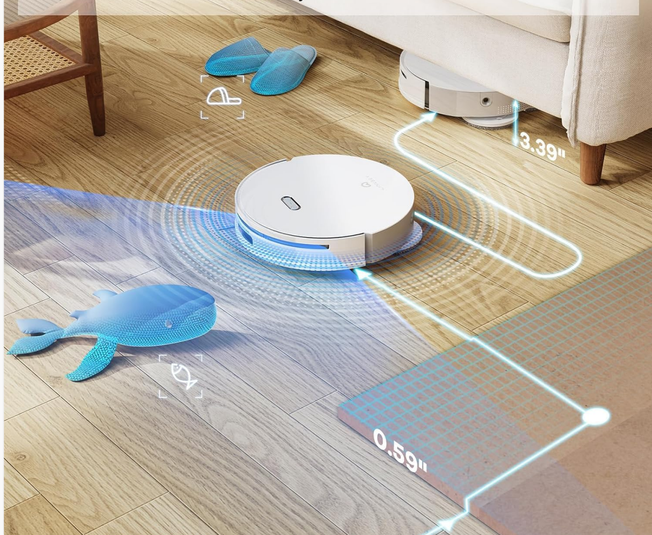
Image: The LYNKBAY M20 Pro robot vacuum using AI obstacle avoidance to navigate around various items on the floor, illustrating its intelligent path planning.

Says goodbye to pre-cleaning, advanced AI system detects and avoids objects on the floor