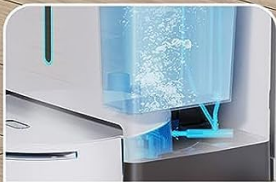
Auto Tank Refilling