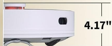
Image: The LYNKBHEY M20 Pro robot vacuum easily navigating under furniture, highlighting its ultra-thin profile compared to other models.