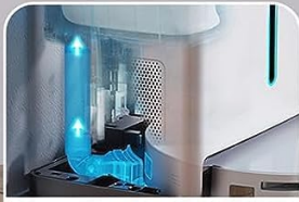
Auto Dust Emptying

A complete auto-maintenance cleaning system that frees your hands.