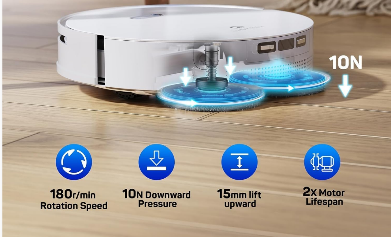
Image: Close-up of the LYNKBHEY M20 Pro's dual rotating mop pads, demonstrating their pressure and lifting capabilities for effective cleaning on different floor types.

Apply a pressure of 10N downward and raise the height of 15mm upward, perfect for Carpet cleaning and tackling sticky mess and oil stains.