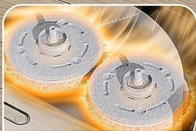
Auto Hot Air Drying