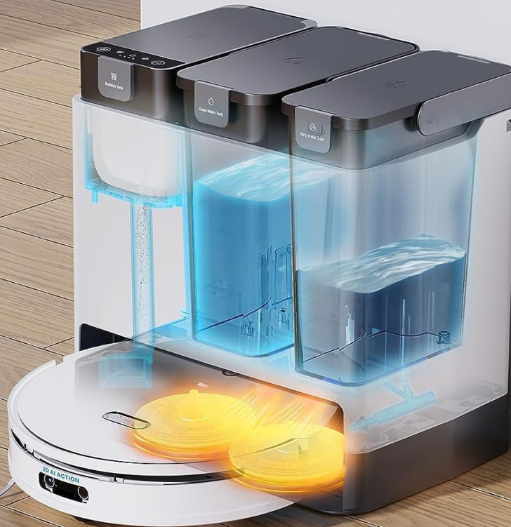
Image: The LYNKBHEY M20 Pro docking station, showcasing its integrated tanks for clean water, dirty water, and dust collection, along with the robot vacuum docked for charging and maintenance.