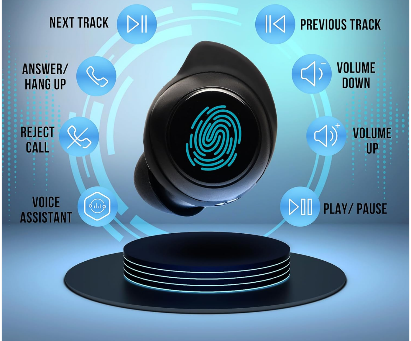
Image: A visual guide detailing the touch control commands for the WALLA SOUND T9 Earbuds, showing gestures for functions such as playing/pausing music, skipping tracks, adjusting volume, answering/rejecting calls, and activating voice assistant.