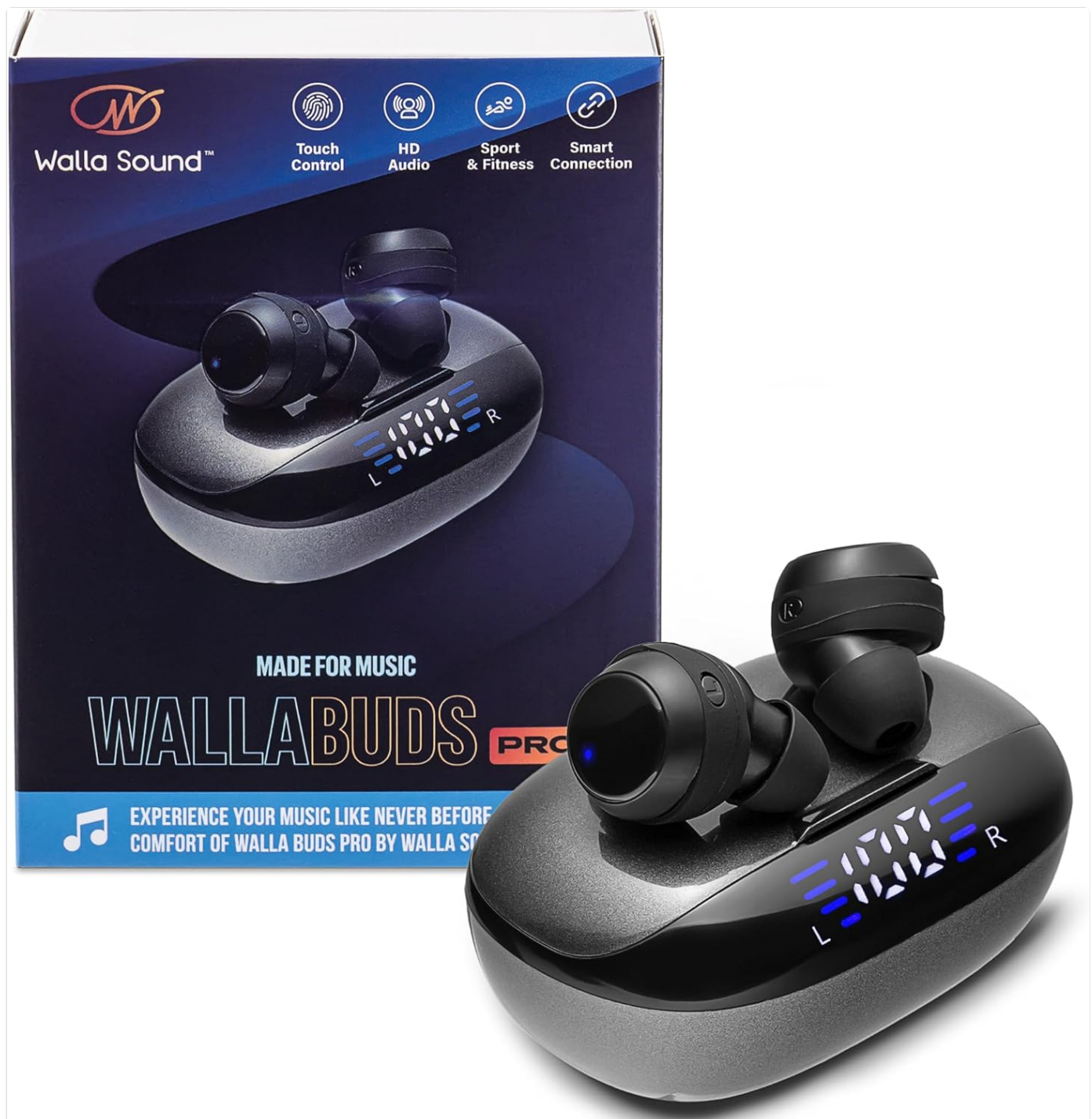
Image: The WALLA SOUND T9 Earbuds displayed with their charging case, highlighting their sleek design.