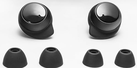
Image: Contents of the WALLA SOUND T9 Earbuds package, showing the earbuds, charging case, USB-C cable, and multiple sizes of ear tips.