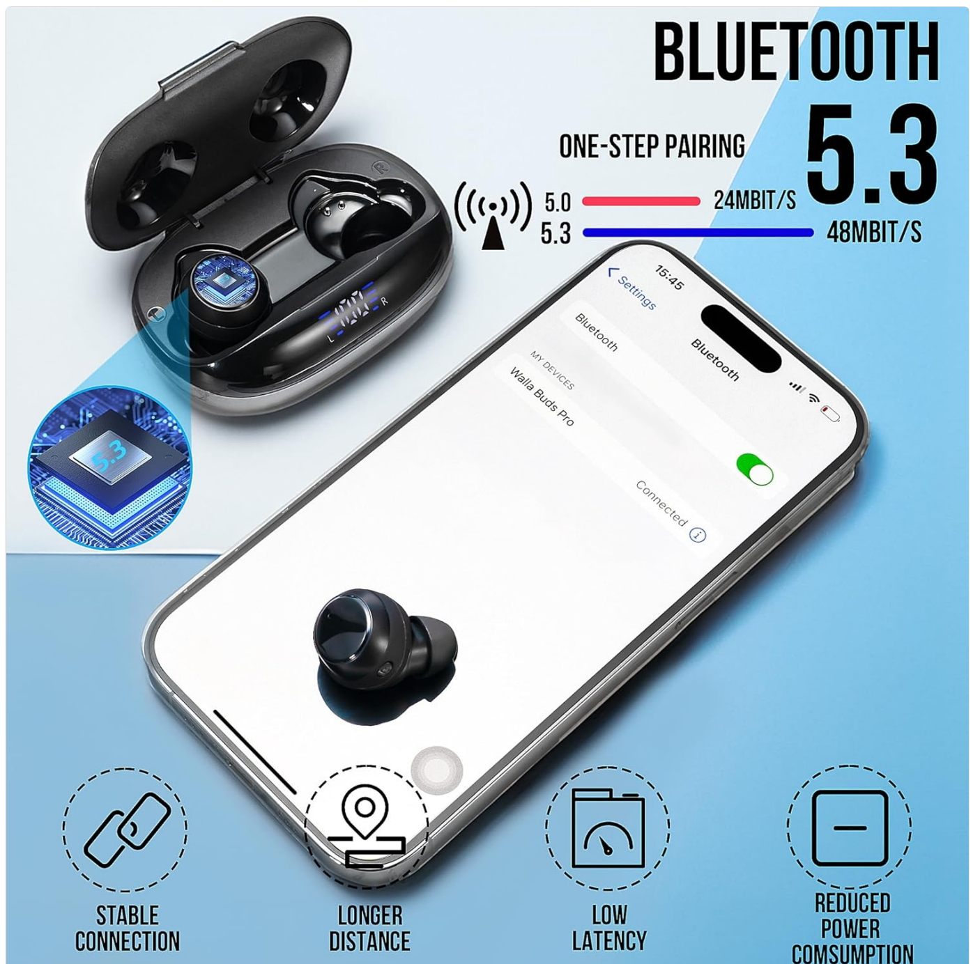
Image: A smartphone displaying its Bluetooth settings, showing the WALLA SOUND T9 Earbuds as a connected device, emphasizing the Bluetooth 5.3 pairing process.