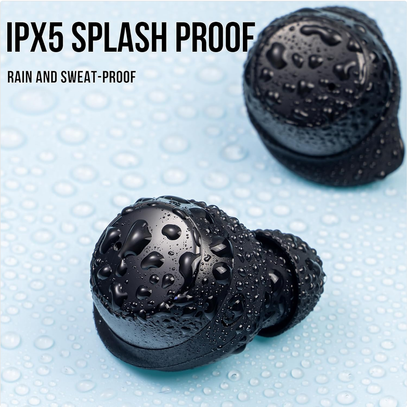
Image: A close-up view of the WALLA SOUND T9 Earbuds covered in water droplets, illustrating their IPX5 splash-proof and water-resistant design.

The WALLA SOUND T9 Earbuds are IPX5 waterproof, meaning they are designed to withstand sweat, rain, and splashes. They are not intended for submersion in water. After exposure to moisture, ensure the earbuds and charging case are completely dry before placing them back in the case or charging.