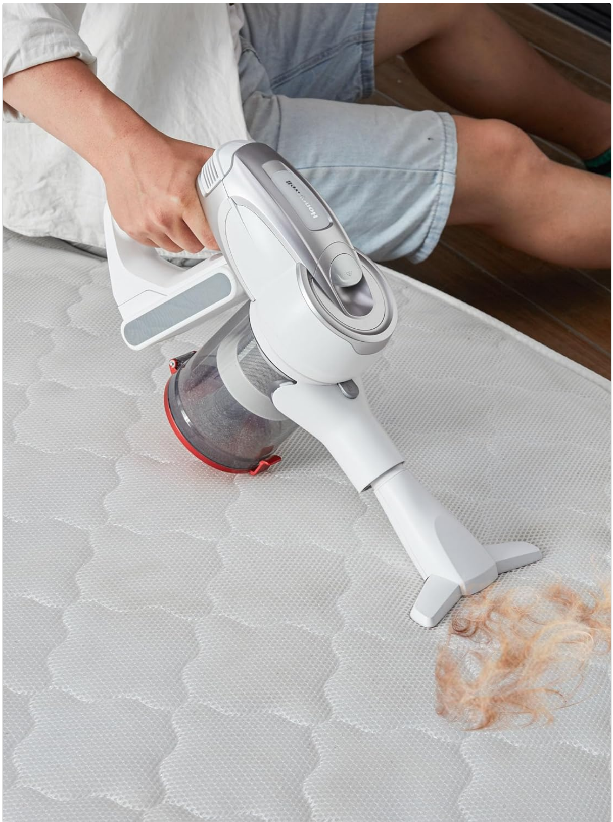
The Honeywell VC10 Aeromax Elite equipped with its deluxe pet hair removal brush, shown effectively cleaning pet hair from a mattress surface.