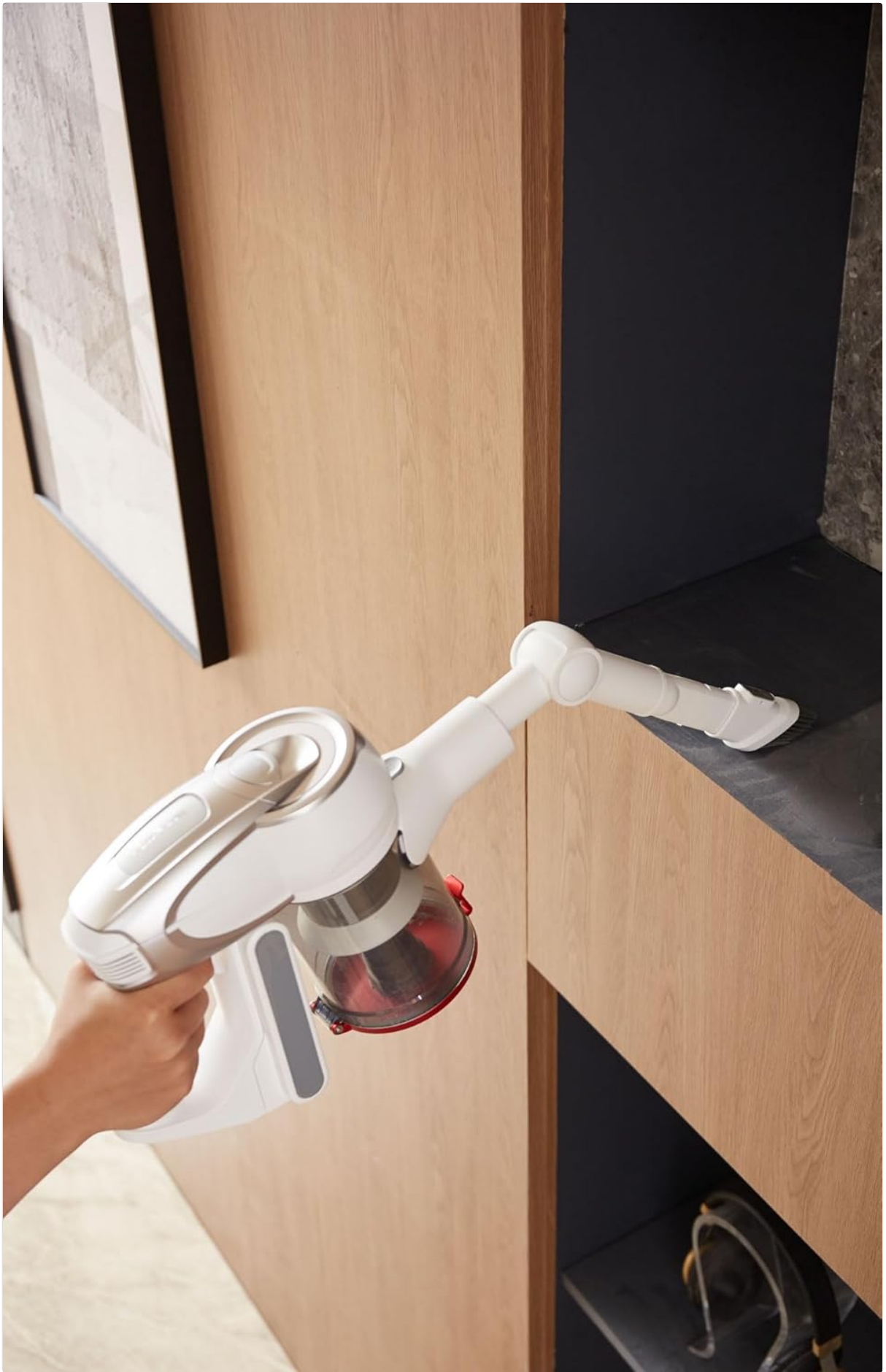
The Honeywell VC10 Aeromax Elite in handheld mode, demonstrating its use with a crevice tool to reach tight spaces.