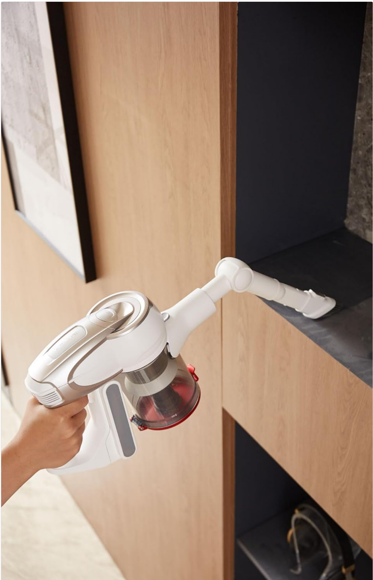
The Honeywell VC10 Aeromax Elite Cordless Vacuum with all its included accessories, demonstrating the comprehensive set of tools for various cleaning tasks.