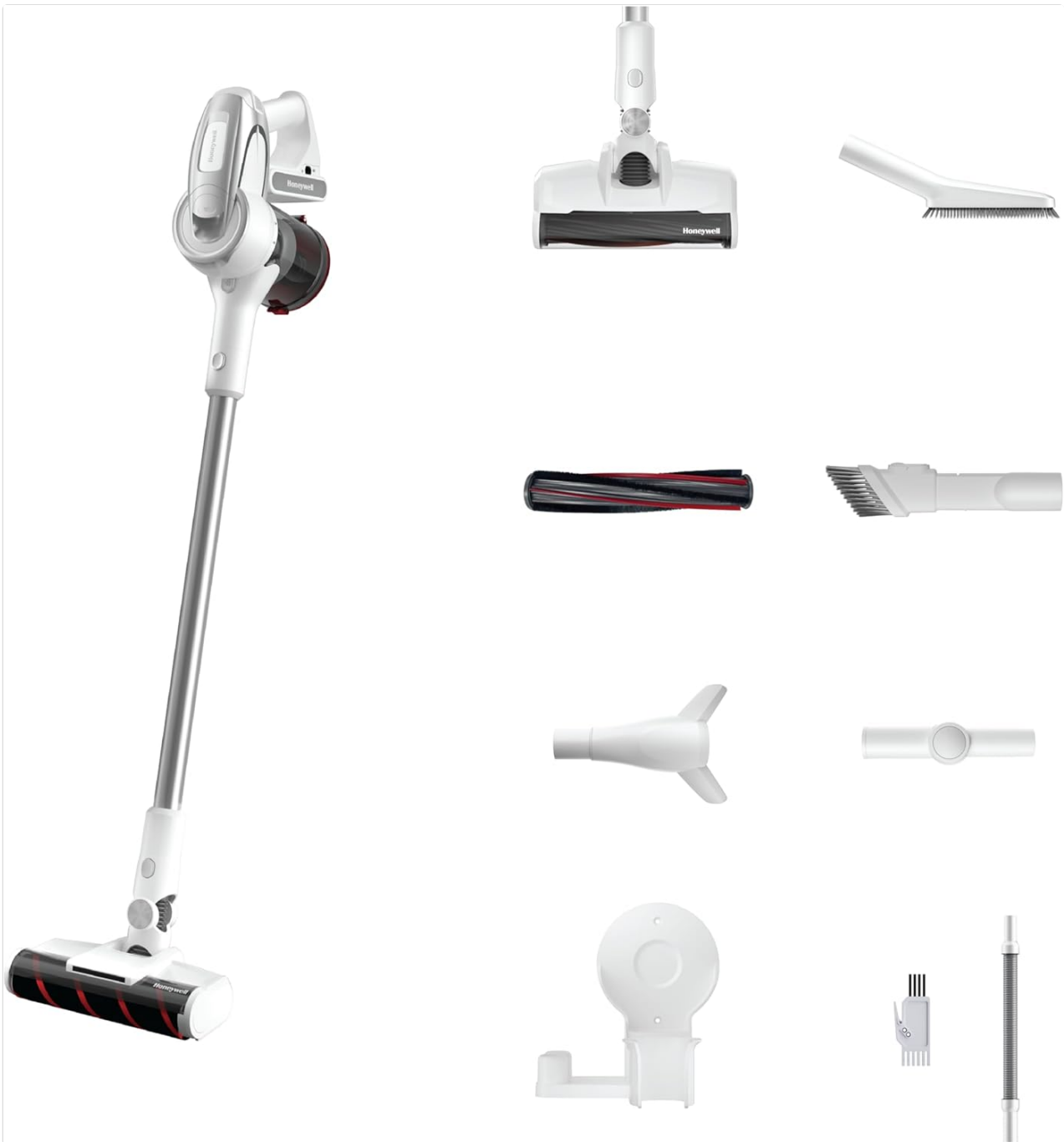
The main unit of the Honeywell VC10 Aeromax Elite Cordless Vacuum, showcasing its sleek design and upright configuration for floor cleaning.