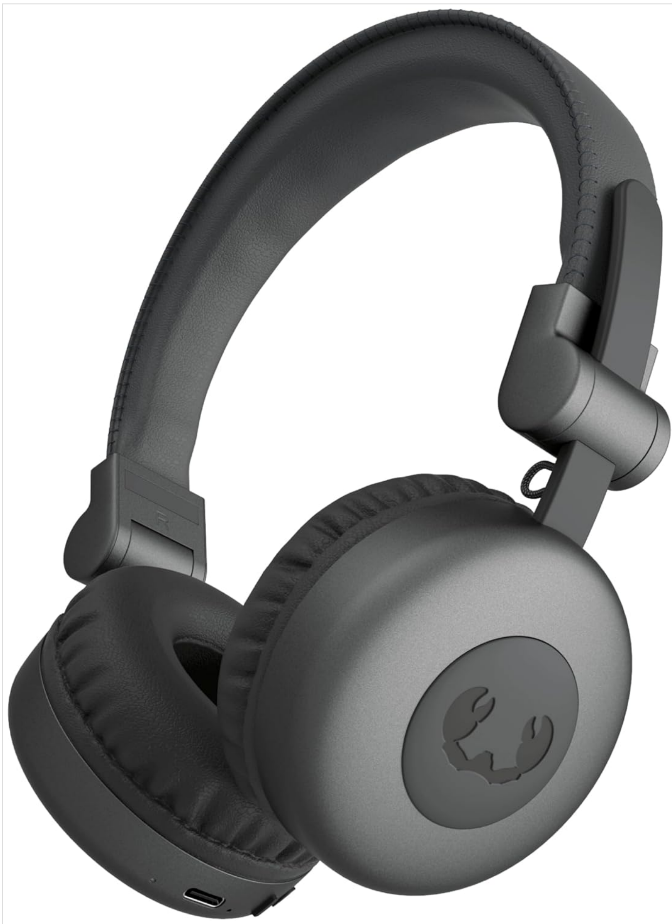
Image: Fresh 'n Rebel Code Core Bluetooth Headphones in Storm Grey, showcasing the sleek design.