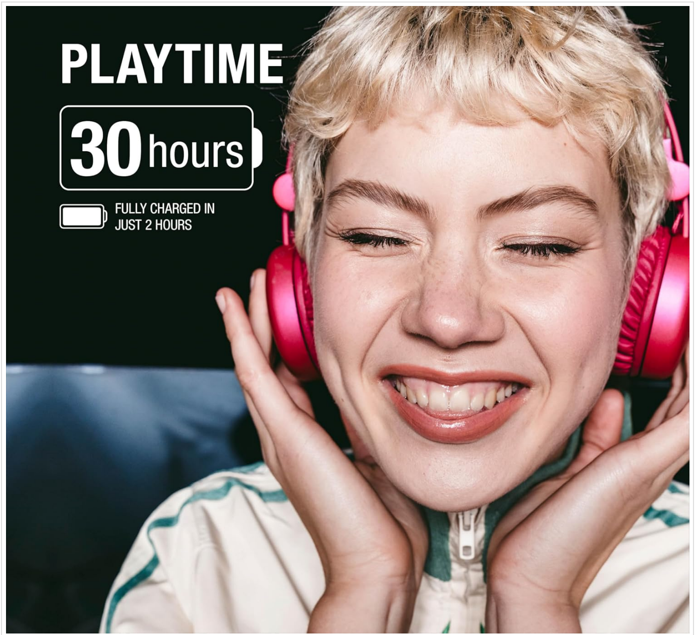
Image: Visual representation of the headphones' 30-hour playtime and 2-hour charging duration.