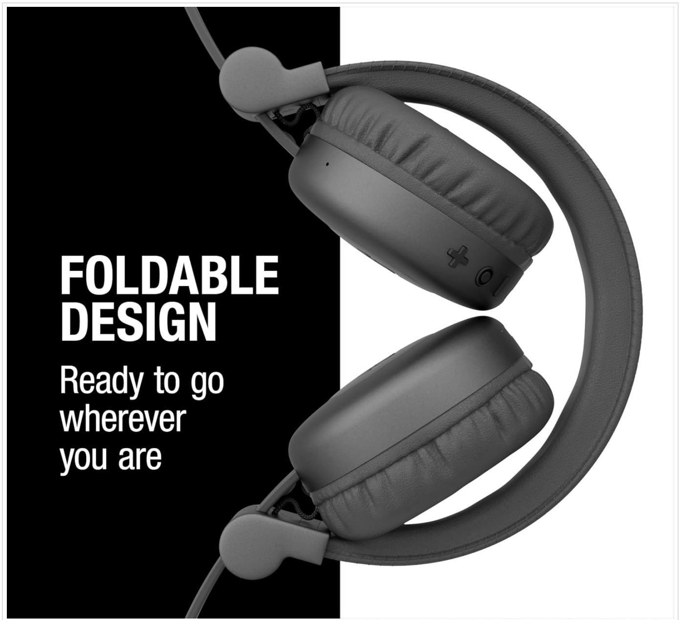
Image: The headphones in their folded configuration, demonstrating their compact and portable design.