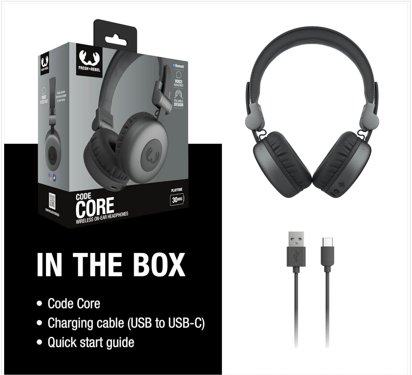
Image: The Fresh 'n Rebel Code Core headphones, charging cable, and quick start guide, as packaged in the box.