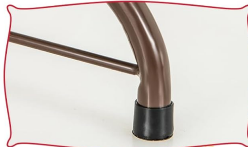
Anti-Slip Foot Pads