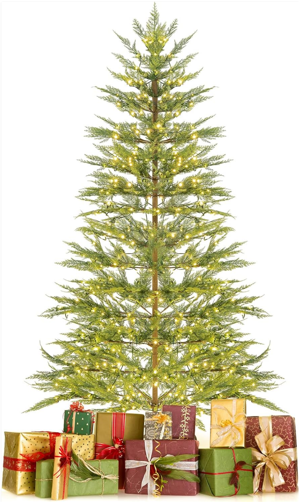
Figure 1: Fully assembled GOFLAME 6.5FT Pre-Lit Artificial Christmas Tree.