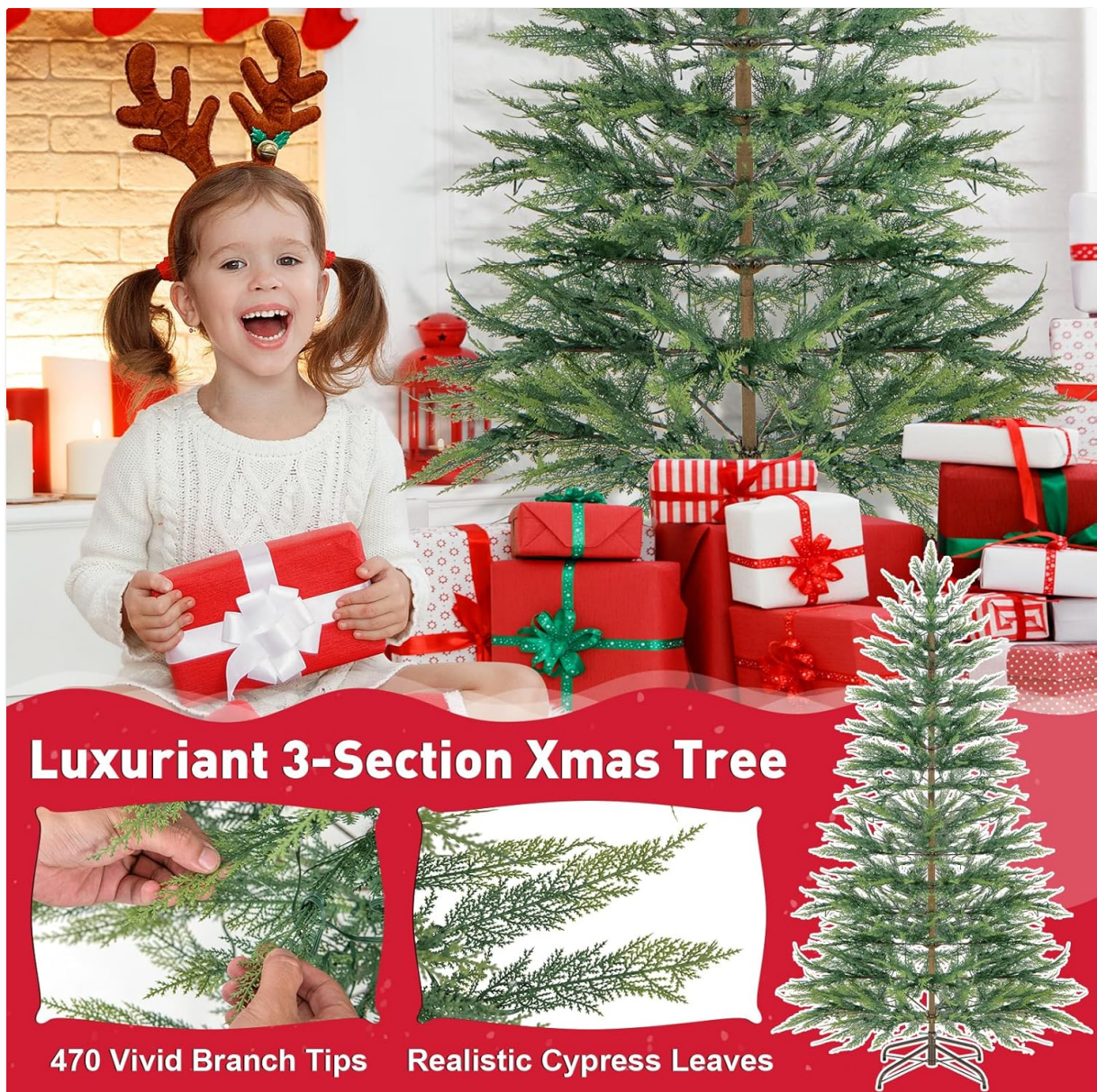
Figure 3: The tree's 3-section design and realistic cypress leaves.