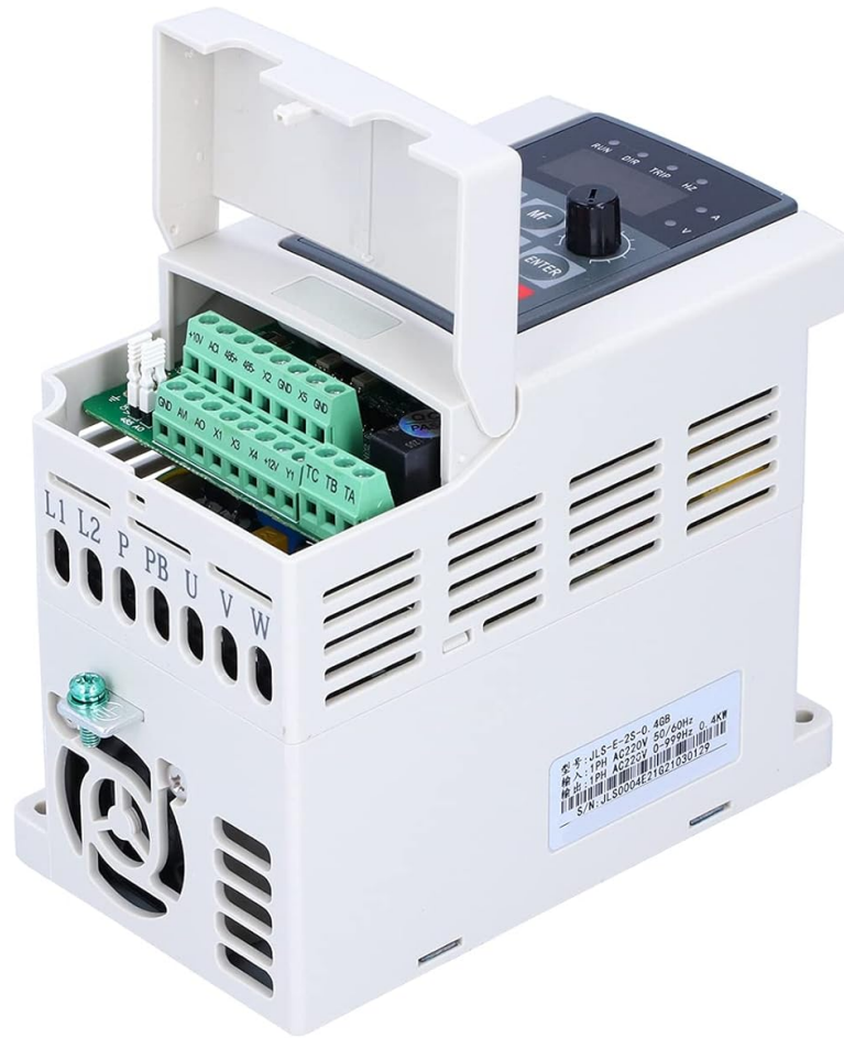
Figure 3.2: Top view of the VFD with the terminal cover open, showing the wiring terminals. This design provides strong anti-interference ability and stable, reliable performance.

Strong anti-interference ability Stable and reliable performance.