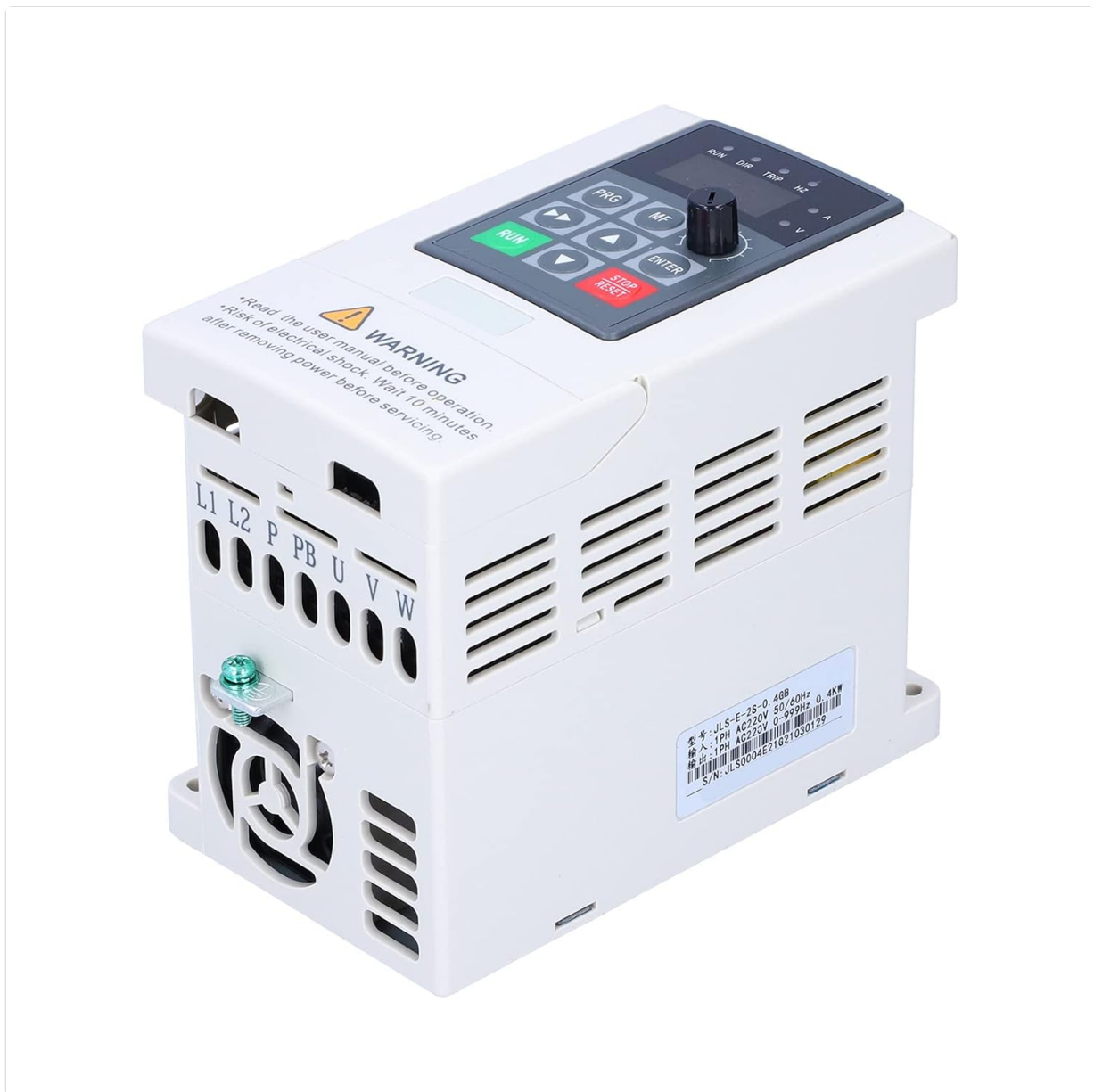
Figure 5.3: Angled view showing both the power terminals and the smaller control terminals for external connections.