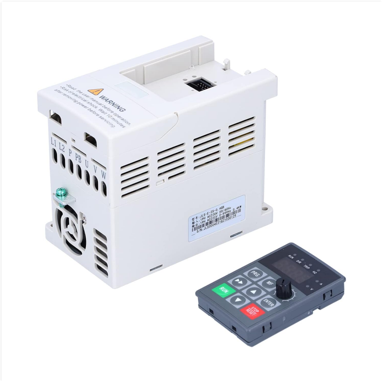
Figure 3.1: Overall view of the Fafeicy JLS-E-2S VFD Frequency Inverter.