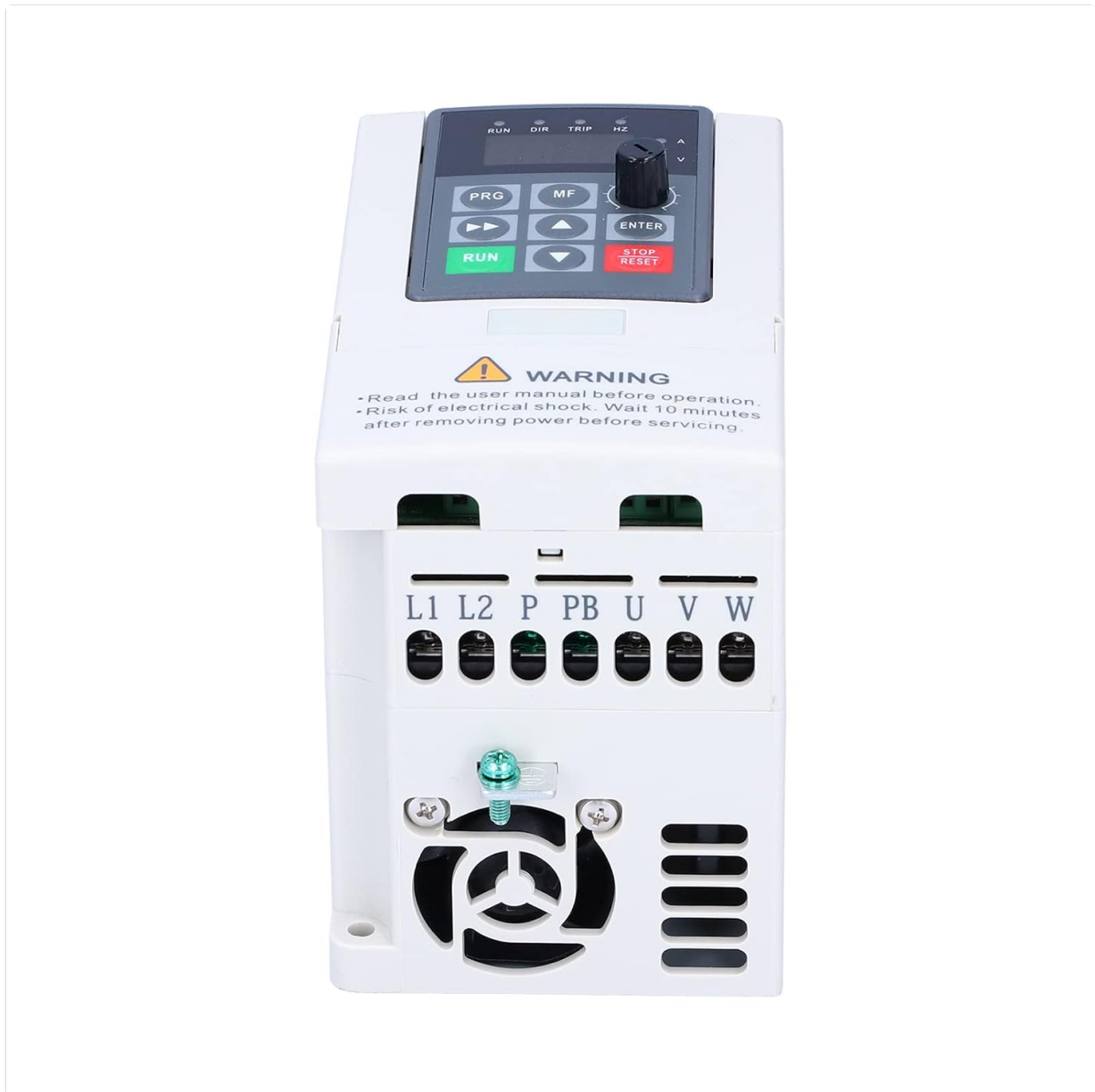
Figure 3.3: Front view of the VFD, highlighting the control panel and the safety warning label.