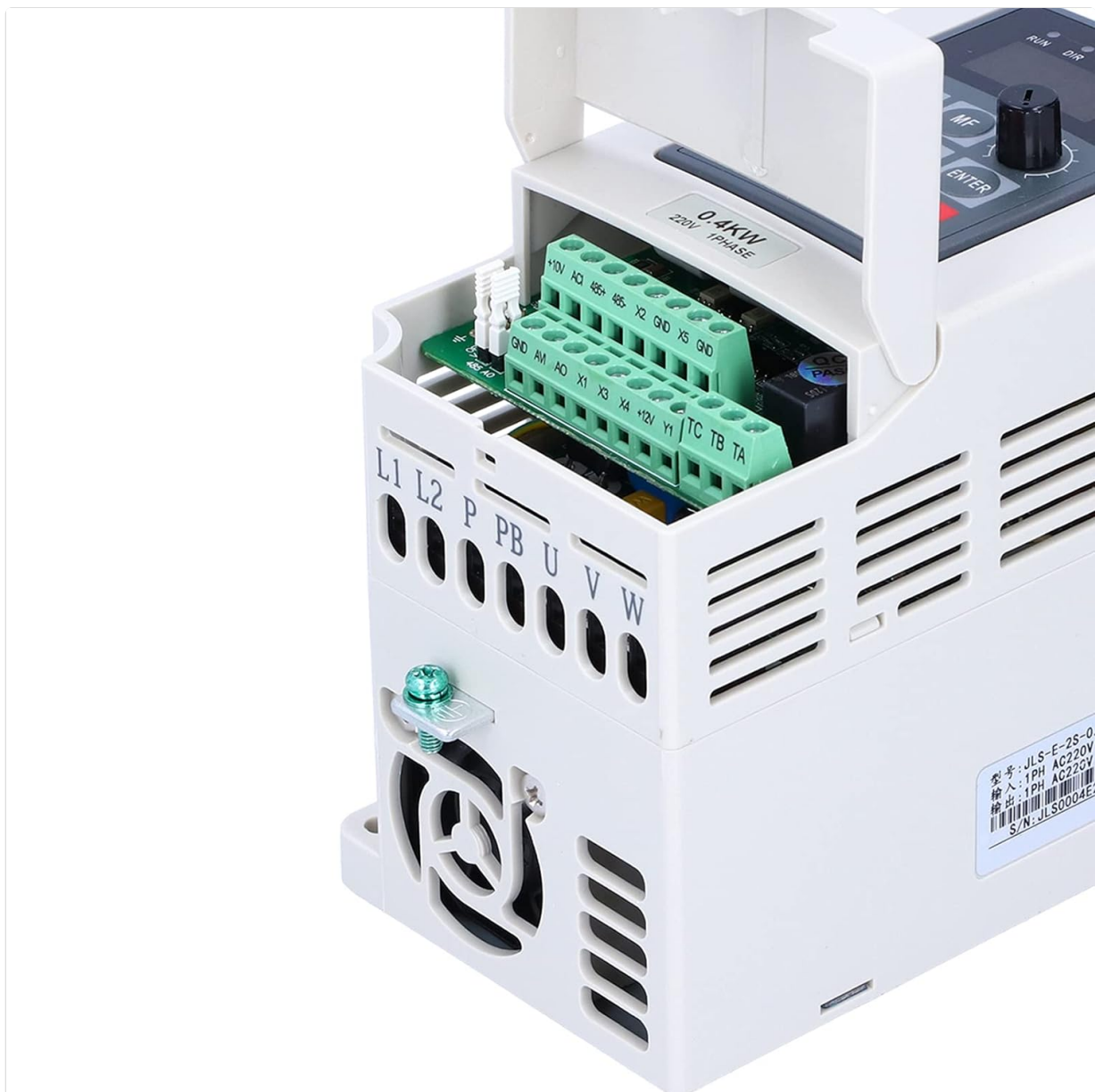
Figure 5.2: Close-up view of the main power and motor wiring terminals (L1, L2, P, PB, U, V, W).