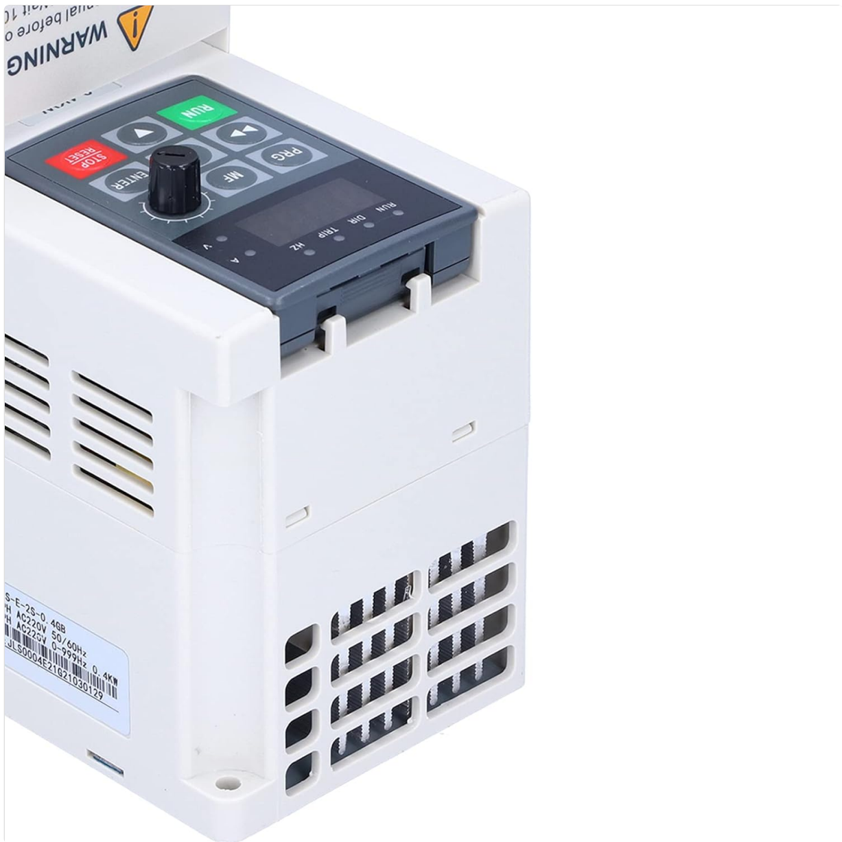
Figure 6.1: Close-up view of the VFD control panel.