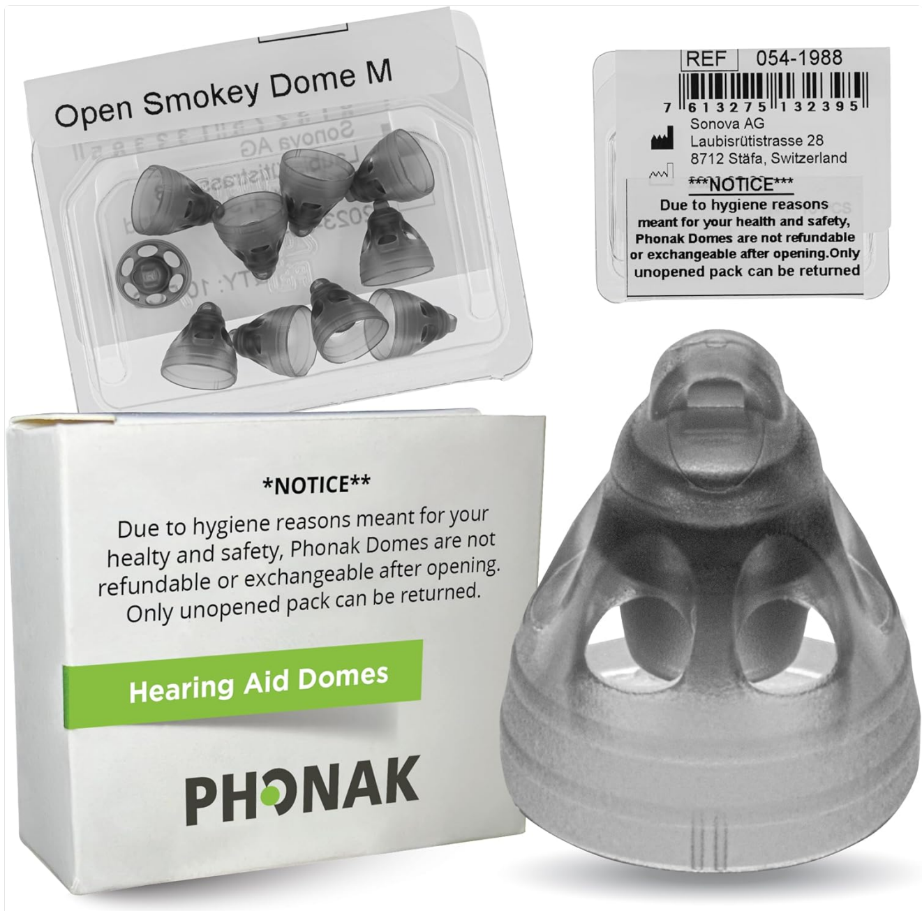
Image: Packaging of Phonak Open Smokey Domes, showing a blister pack with multiple domes and a single dome enlarged for detail. The packaging indicates "Hearing Aid Domes" and "PHONAK".