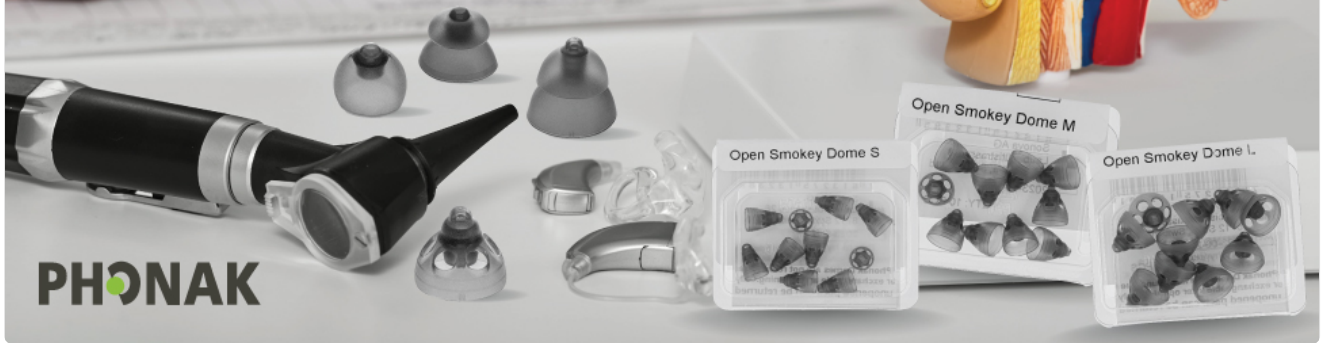
Image: An image depicting an audiologist's desk with various hearing aid components, including domes, and text stating "Audiologists' Recommend Authentic Phonak Hearing aid Domes."