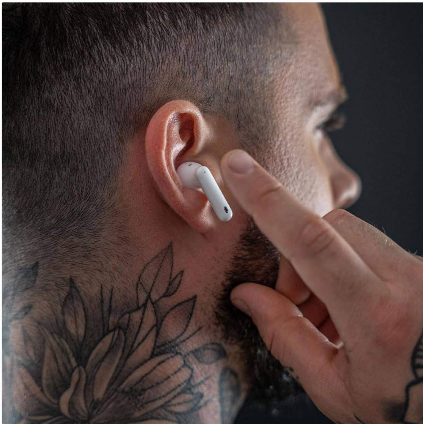
Image: A man's hand gently touching a white 3MK Hardy LifePods Pro earbud in his ear, illustrating the process of adjusting the earbud for a proper fit.