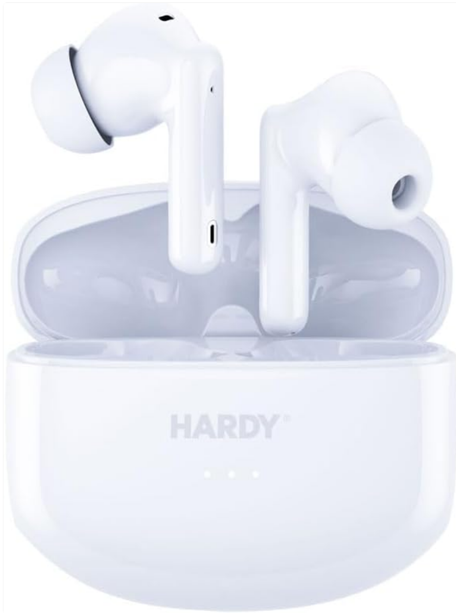
Image: The white charging case is open, revealing the two white 3MK Hardy LifePods Pro earbuds seated inside their respective charging slots. Three small indicator lights are visible on the front of the case.