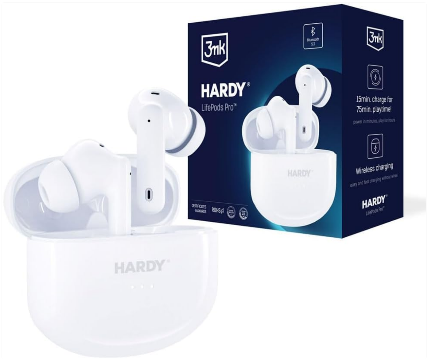
Image: The 3MK Hardy LifePods Pro White earbuds and their charging case, displayed alongside their retail packaging.