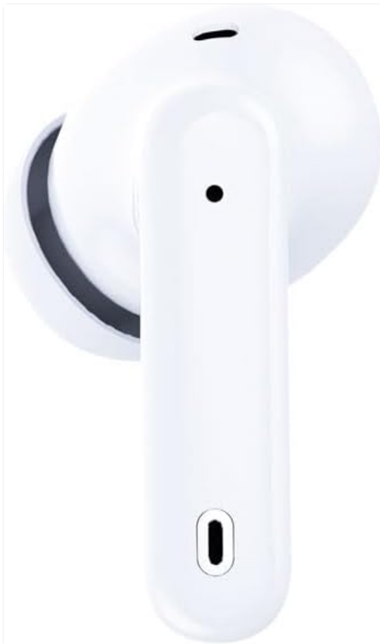
Image: A close-up view of a single white 3MK Hardy LifePods Pro earbud, highlighting its sleek design, the small microphone opening at the bottom, and the touch-sensitive area.