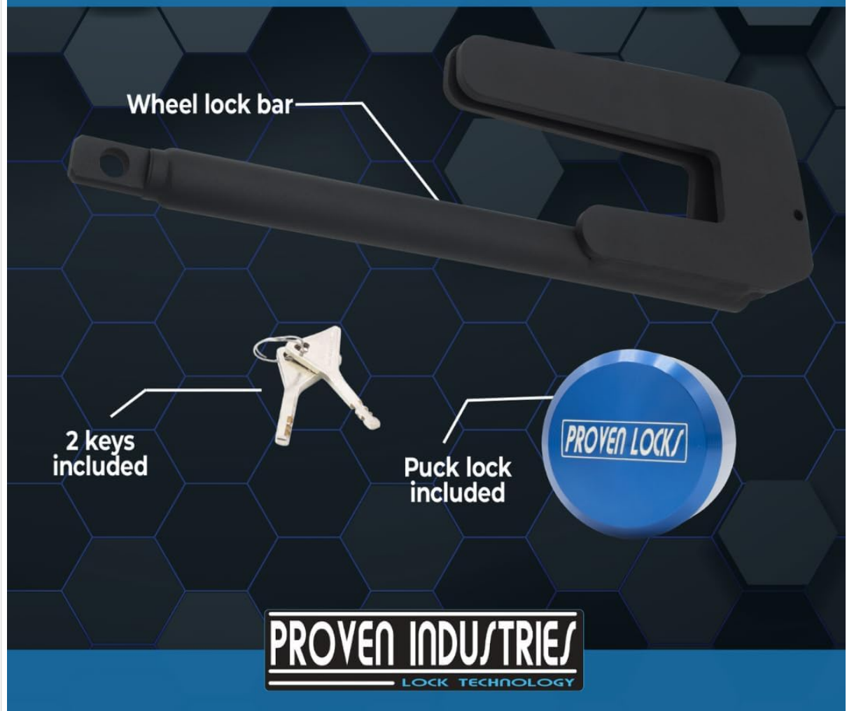
Image 3.1: Included components: wheel lock bar, puck lock, and keys.