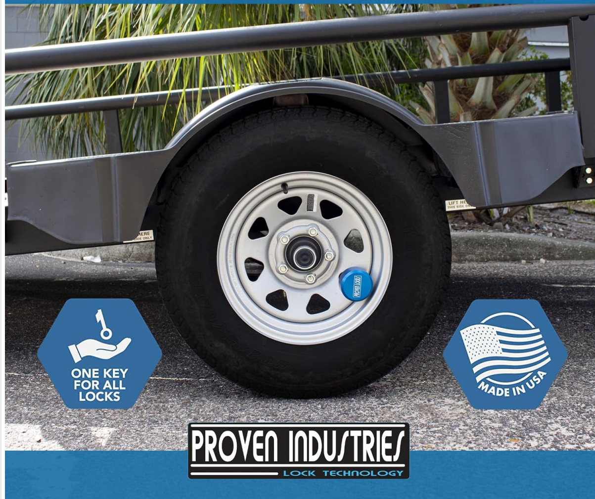
Image 4.2: The WL-200 J-Style Wheel Lock correctly installed on a trailer wheel.