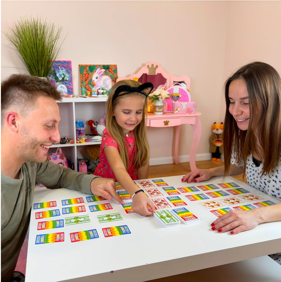
Image: A family setting up their cards in a grid formation on a table, preparing to play SKYJO Junior.