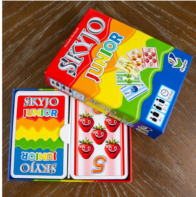
Image: The SKYJO Junior game box opened, revealing the deck of playing cards inside.