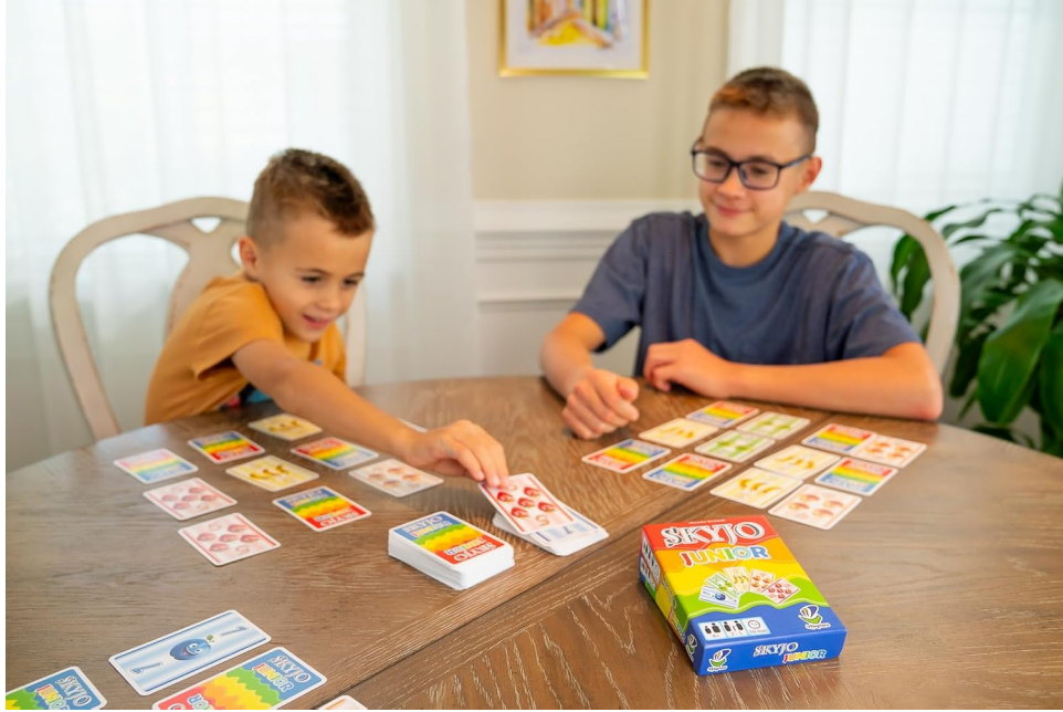
Image: Two boys intently playing SKYJO Junior, with their card grids spread out on a wooden table.