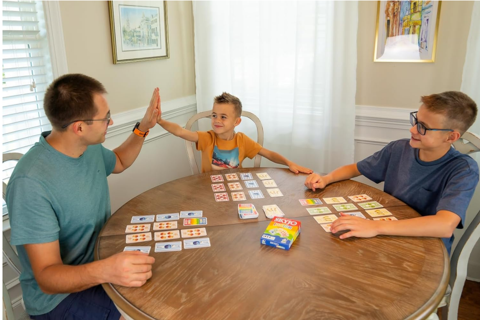
Image: A father and two children engaged in a game of SKYJO Junior, with cards laid out on the table.

Important Rule: If all three cards in a vertical column are the same number, all three cards are removed from the game. This reduces your total score.