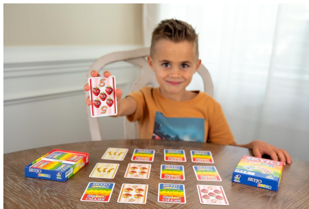
Image: A young boy smiling and holding up a card from the SKYJO Junior game, showing a strawberry fruit card.