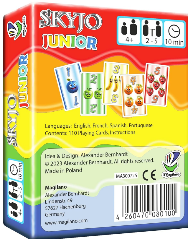
Image: The back of the SKYJO Junior game box, detailing the included languages and game contents.