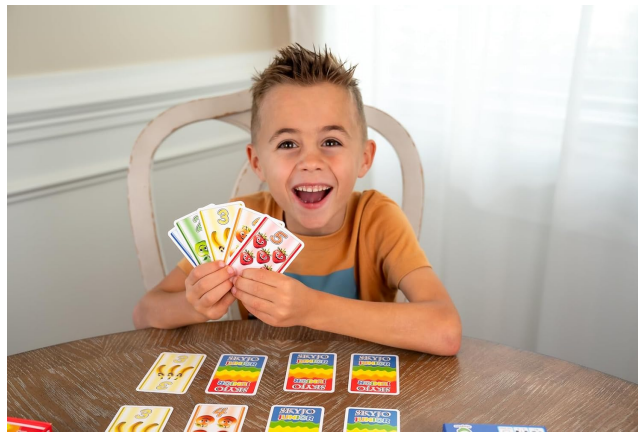
Image: A young boy smiling broadly while holding a fan of SKYJO Junior cards, indicating enjoyment of the game.