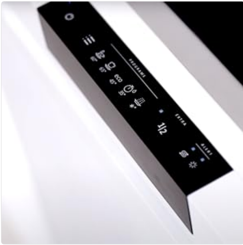
Figure 3.2: Close-up of the hidden control panel with LED display for intuitive program selection.