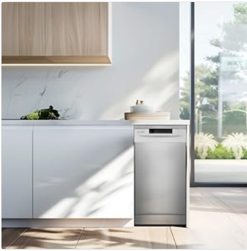
Figure 3.1: The EVVO D1 Slim dishwasher seamlessly integrated into a modern kitchen.