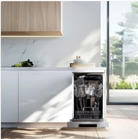
Figure 5.1: Open dishwasher showing the interior racks and adjustable upper basket.

Proper loading ensures effective cleaning and drying. Utilize the adjustable upper basket for taller items and the cutlery basket for silverware.