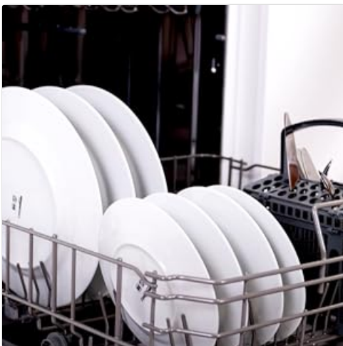
Figure 5.2: Example of properly loaded dishes in the lower rack.